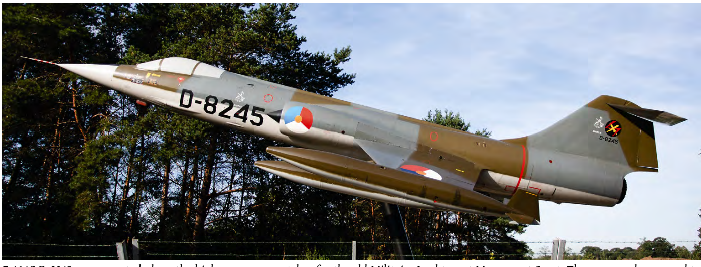
F-104G D-8245 was mounted along the highway as eye-catcher for the old Militaire Luchtvaart Museum at Soest. The museum has moved to Soesterberg and became the Nationaal Militair Museum. Since a few months the Starfighter has taken up its old task and is once again an eye-catcher, now pole mounted close to the NMM. (23 August 2019, Manolito Jaarsma)