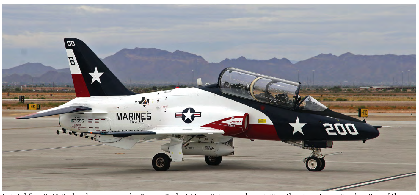
In total four T-45 Goshawks were seen by Ramon Berk at Mesa-Gateway when visiting the airport on a Sunday. One of them is 163656 of TAW-2 (19 May 2019)