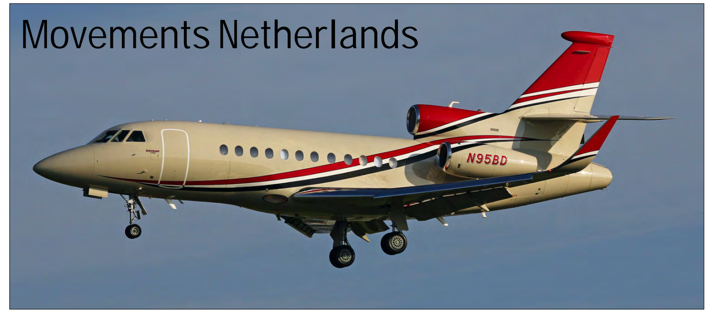
This Falcon 900LX was acquired by the Discount Tire Company in 2015. N95BD has been operating for the company ever since. (Amsterdam - Schiphol, 29 July 2019,)