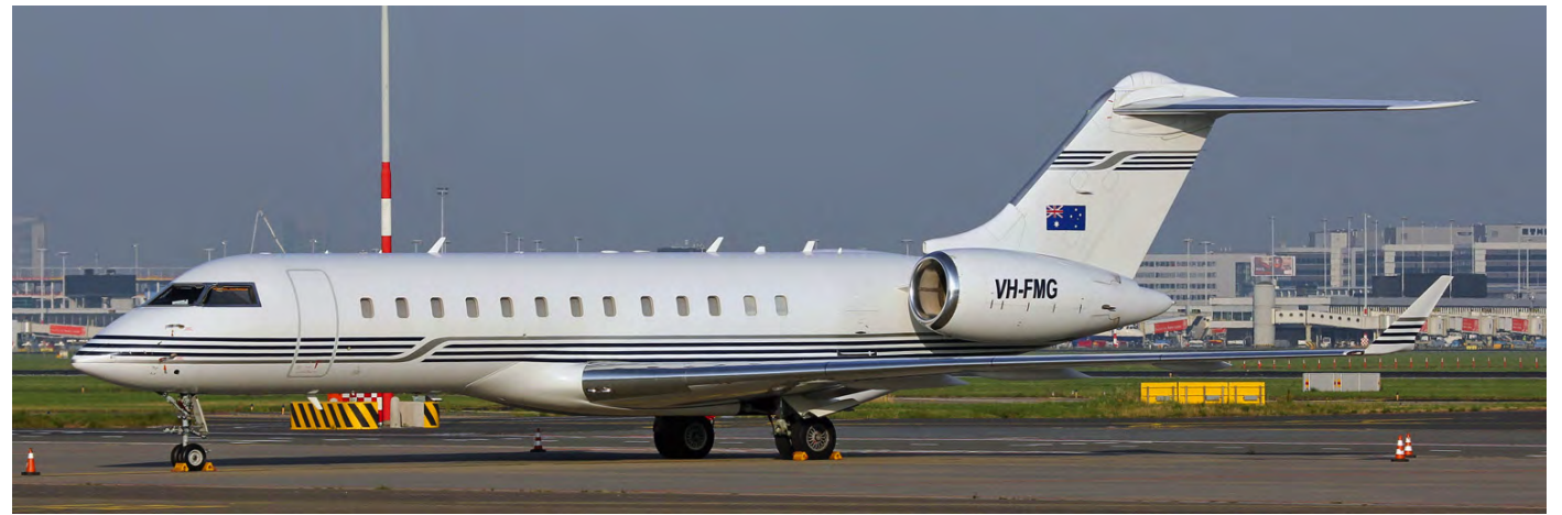
This Global Express came off the production line in 1998, and was registered until late 2004 in the US. It then moved to Switzerland for five years before returning to the United States. The Global was acquired by the Fortescue Metals Group in 2011 and until 27 February 2019 the aircraft was operated by Avwest. Currently FMG Air is listed as operator although VH-FMG is still owned by the Fortescue Metals Group. (Amsterdam-Schiphol, 29 July 2019,)