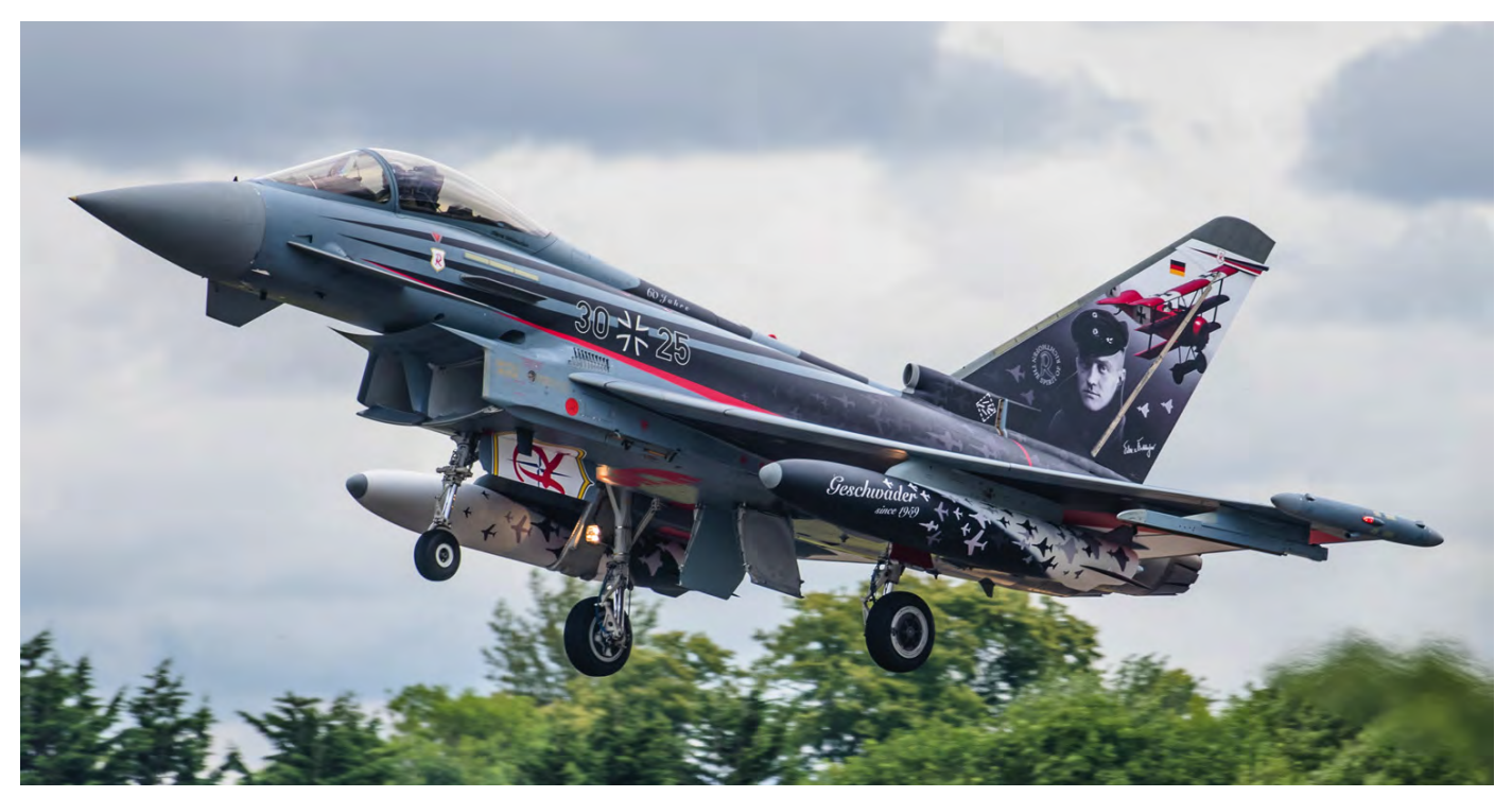
Fairford Photo page two: EF2000 30+25 carries special markings for 60 years Geschwader Richtenhofen. (18 July 2019 Rob Skinkis)