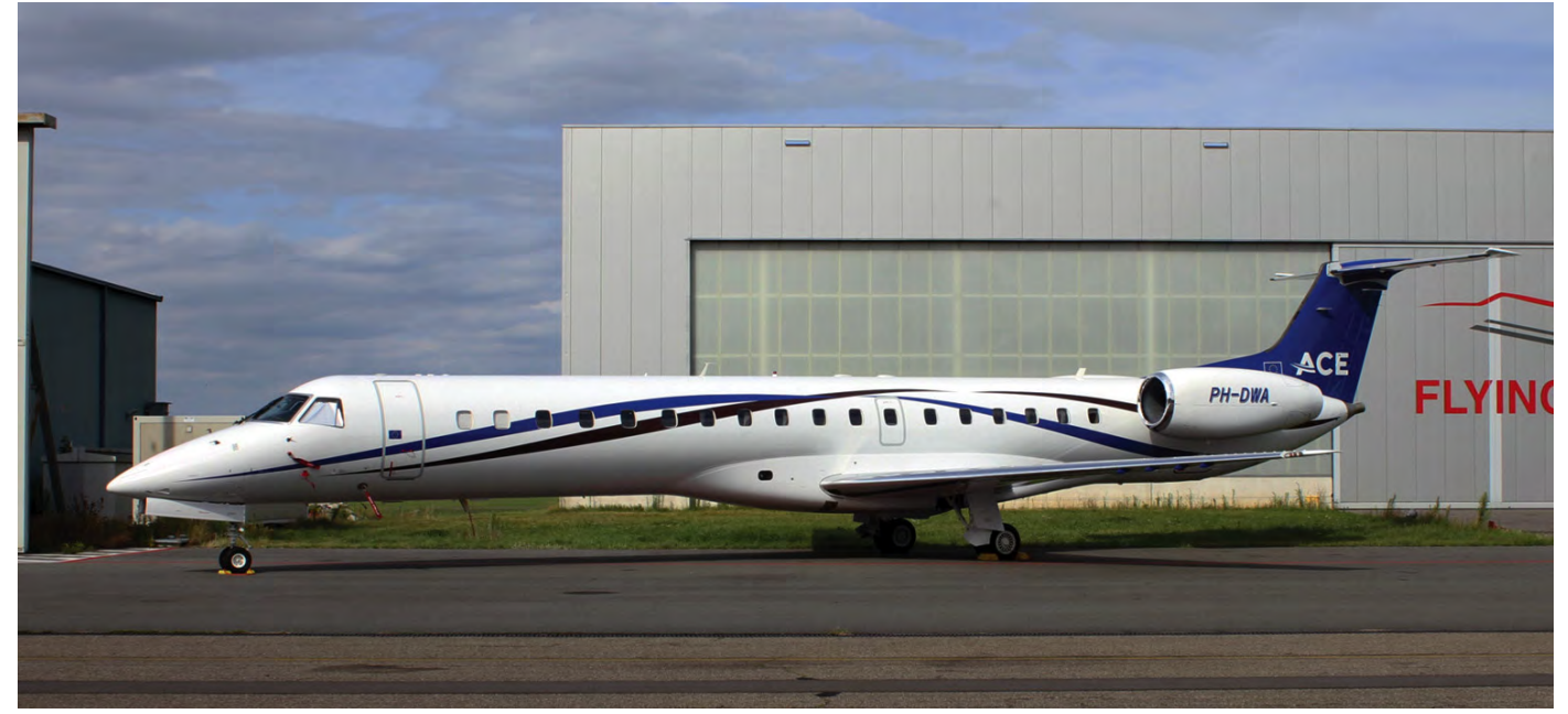
On 1 August Air Charters Europe welcomed its second Embraer aircraft. It arrived at Antwerp on 1 August 2019, still registered as N650EC. The Embraer was initialy delivered to Grand China Express as an ERJ145LI, with registration B-3036 and msn 14501000. At some point in its career it also flew for Tianjin Airlines. After the aircraft was returned to its lessor it was converted to an ERJ145LR, and as such it was delivered to Air Charters Europe. Like Embraer ERJ135LR PH-DWS, future PH-DWA will be operated by JetNetherlands. (Antwerp, 5 August 2019, Walter Van Brempt)

Credits: Inspectie Leefomgeving en Transport.