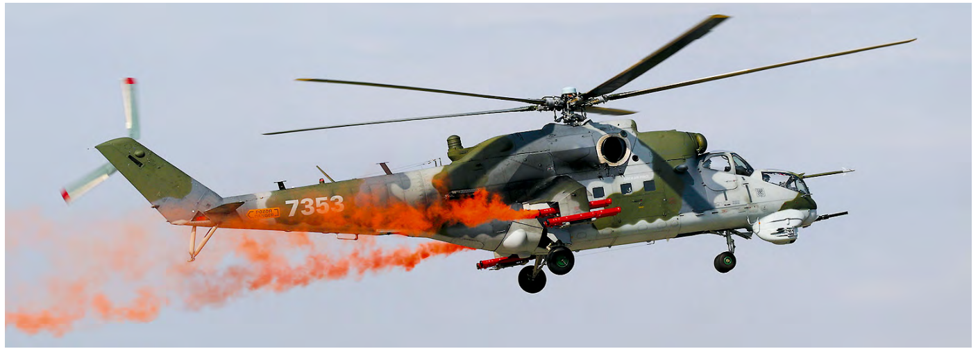
Update on a mishap we reported in issue 483 is this Mi-24V of the Czech Air Force. The update concerns its serial (7353), construction number (087353), and unit (221.vrl). (Sliač Airport, 1 September 2018, David Alders)

splash". According to the Joint Rescue Coordination Centre in Victoria, the Beaver sank after it hit the water. The centre reported several rescuers responded to the incident, including crews from the Navy, Transport Canada, Canadian Coast Guard and Vancouver Fire Rescue. The three male occupants onboard were rescued without injury.