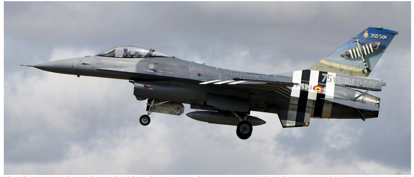
The Belgian Air Force has not hesitated to follow other airforces in the commemoration of the 75th Anniversary of the D-Day Invasion. For the occasion F-16AM FA-57 was painted in this very special livery, with Invasion stripes and 350 Squadron Spitfire drawing on its tail. RAF 350 (Belgian) squadron with its Spitfires Mk.Vs was heavily involved in Operation Overlord on 6 June 1944. The Fighting Falcon was photographed by Ruud van den Berg during the RIAT on 18 July 2019.