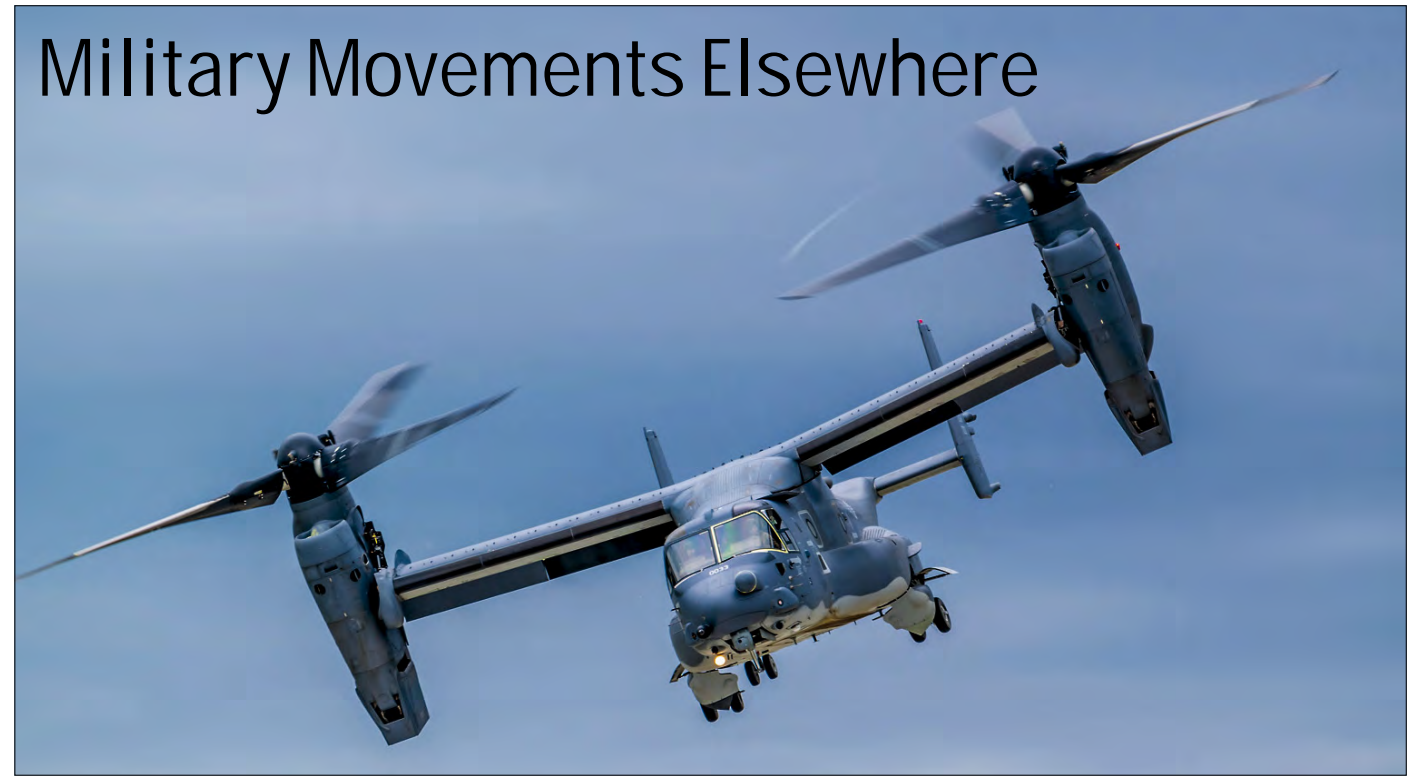
The V-22 is a type based at RAF Mildenhall, and therefore usually not mentioned in the Military Movements Elsewhere section of our magazine. But when you consider that the prototype made ist first flight in 1989, the Osprey today still is a remarkable futuristic design. This photo of 07-0033, taken on 31 July 2019 at Mildenhall, does justice to this 'beast'.