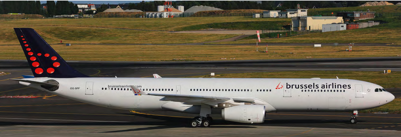
Brussels Airlines is changing its long haul fleet by adding some 'newer' frames to its fleet, replacing the older aircraft. OO-SFF is a former Singapore Airlines aircraft. It arrived at its new home on the day this photo was taken. If you look closely you can see its colours are slightly different than what you are used to. Its lower fuselage is not light blue but white. It is speculated that this will be the new uniformly white livery for Brussels Airlines now that the airline will not be fully integrated into Eurowings. (Brussels, 23 July 2019, Bart Massart)