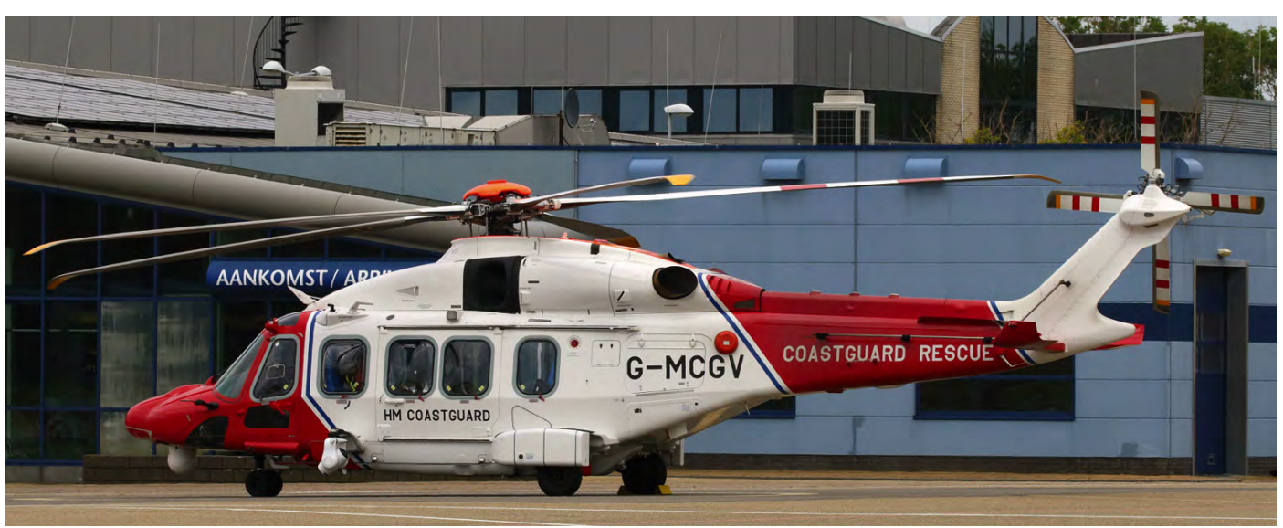
In March 2017 this AW189 was registered to Leonardo MW, a wholly owned subsidiary of Leonardo. In February 2018 the helicopter was delivered to Bristow Helicopters. G-MCGV is being operated in HM Coastguard colours and it is based at Lydd. (Den Helder - De Kooy, 6 July 2019,)