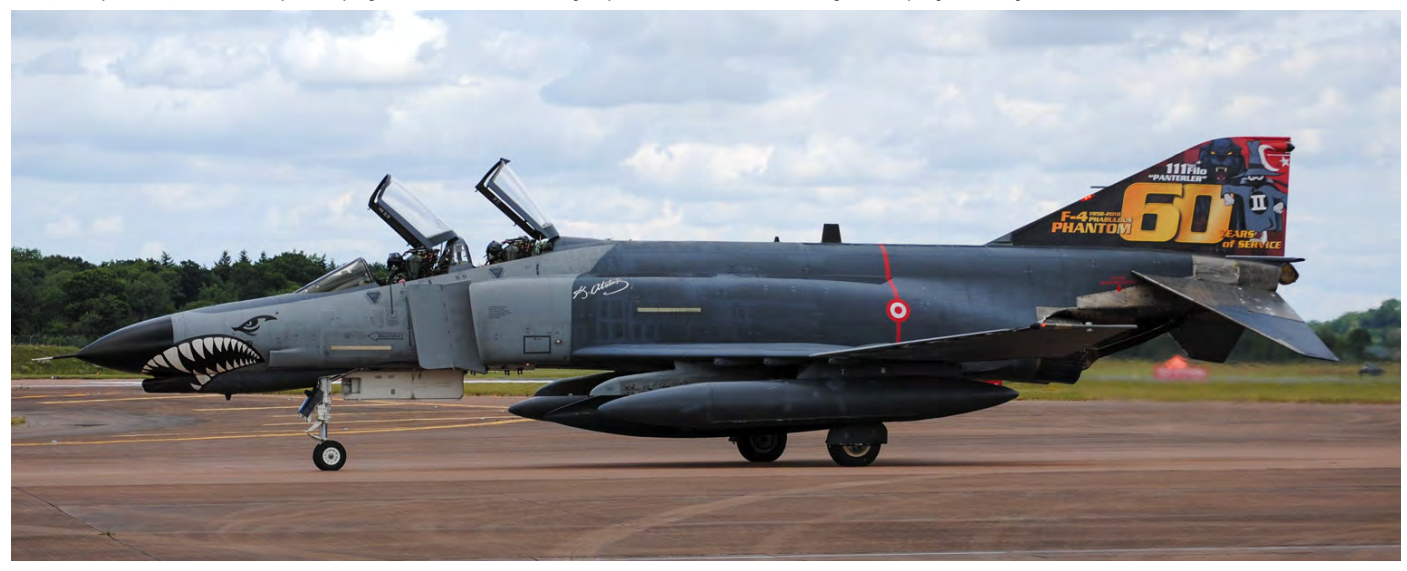
Turkish F-4E 77-0296 with special markings celebrating 60 years of Phantom operations (18 July 2019, Frank Call)