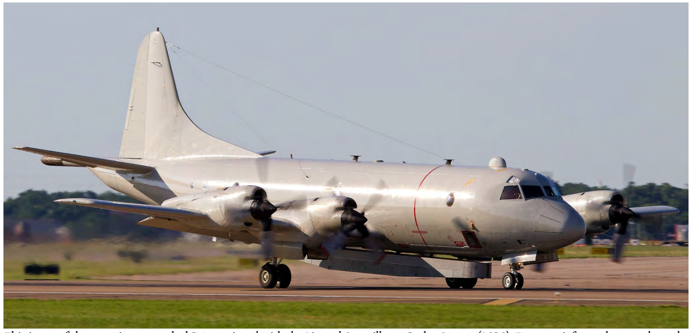
This is one of the secretive, unmarked P-3s equipped with the Littoral Surveillance Radar System (LSRS). For more info see the text about the BUPERS aircraft. (Dallas-Love Field, 17 April 2019, Garrett Heller)

desire to draw the least amount of attention to themselves. The Orions do not sport any BuNo on the outside and they don't even have NAVY titles, although they are flown by US Navy crews and use Navy call-signs. The Poseidons only carry the last three digits of their BuNos. As multiple Orions with the operational Patrol Squadrons are reported operating with the LSRS, we believe that not all P-8As can be equipped with the AAS, or at least not yet. Besides, the Poseidon must be equipped with "pylons" to attach the massive pod, we noticed additional modifications like an aerodynamic body modification underneath the fuselage, just on top of the front-end of the AAS, as well as two large stabilization fins underneath the rear end of the fuselage (see picture elswhere in this section).