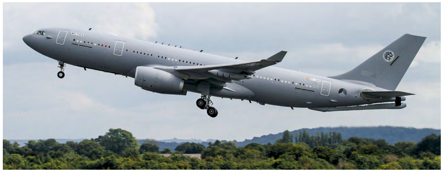
Seen departing from from Manchester to getafe is the first KC-30M MRTT for the Multi National Multi Role Tanker Transport Fleet with the toned-down Royal Netherlands Air Force roundel on the aft fuselage, after being painted by Air Livery. Its previous designation M-001 has been taped over, allegedly it will now become T-054. (2 August 2019)

Menno van de Wal sent us an email with the location of the MiG-29s of the Egyptian Air Force, they are based at Wadi Abu Rish (28°58'29"N, 031°41'55"E). This air base has been considerably rebuilt since late 2014 and has now at least 36 hardened shelters, which is twenty more than before 2014.