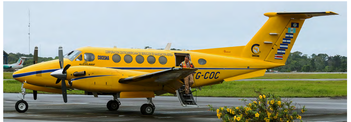
COCESNA is the acronym for Corporación Centroamericana de Servicios de Navegación Aérea or in English "Central American Corporation for Air Navigation Services". This Beech B200 has been in service with the Air Navigation Services provider since August 2001 when it was registered YS-111-N. The aircraft was reregistered to TG-COC in April 2019. Although mostly working in the Central American Region it also performs work for third parties in non-member states. (Paramaribo, 14 May 2019,)