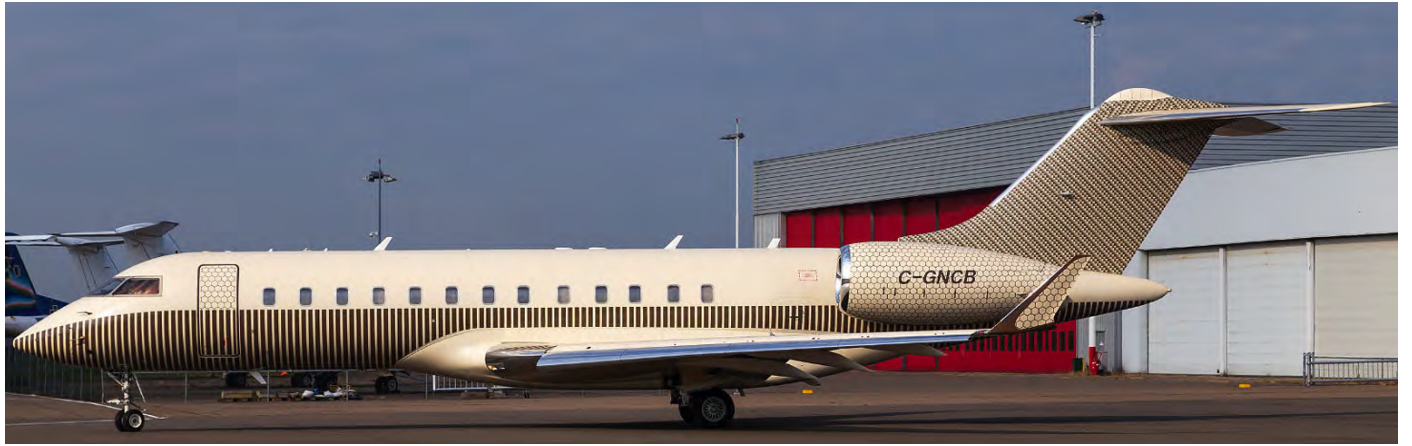
From August 2001 onwards this Global Express has been owned by AIC or a company it is related too. C-GNCB is currently registered to AIC Global Holdings, a privately held company. The jet was photographed in these stunning colours at Maastricht - Aachen Airport on 12 July 2019.