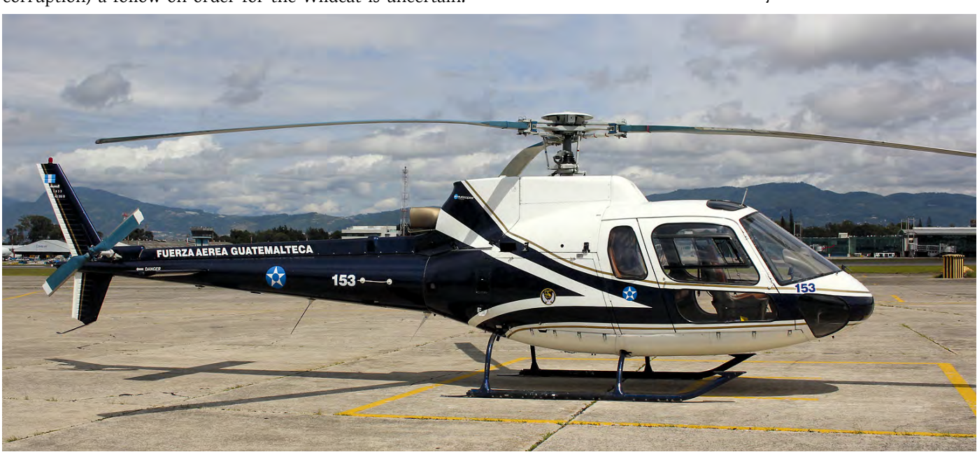
As reported last month, a new asset for the air force of Guatemala is this great looking AS350B 153, which was formerly on the civil aviation register as TG-ALG. It was seized in a raid against criminals together with a huge load of hand weapons on 23 April 2018. (La Aurora, 30 June 2019,)