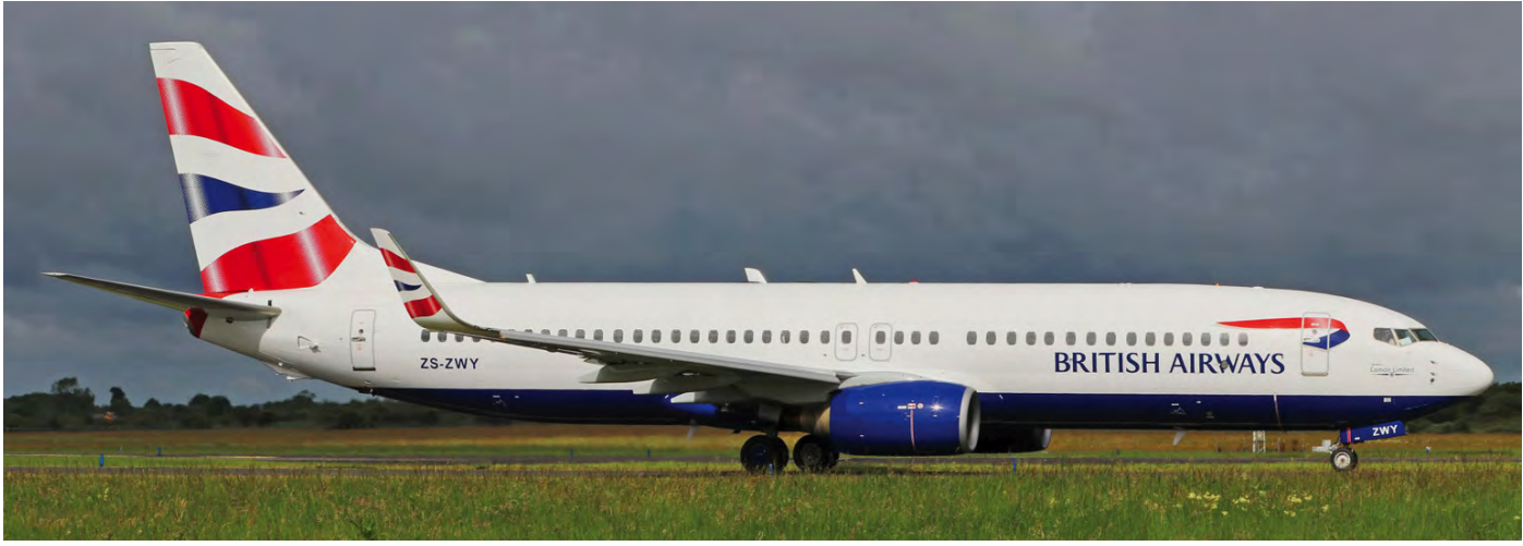
This summer South African Comair took delivery of two ex FlyDubai Boeing 737-800s. One of them became ZS-ZWY, which is former A6-FDT (msn 40247). The aircraft are operated on behalf of British Airways and have been painted at Shannon delivery to Johannesburg. (Shannon, 18 July 2019,)

Credits: Airline-List, FlightAscend, Planespotters and Skyliner.