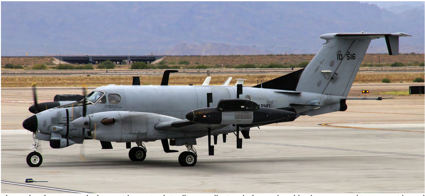
The Beechcraft RC-12 Guardrail is an airborne signals intelligence collection platform and used by the US Army. This RC-12X with serial 91-00516 belongs to the 204th MI Bn and is based at El Paso/Biggs Army Airfield (Fort Bliss) Texas. (Phoenix-Mesa Gateway (AZ), 19 May 2019)