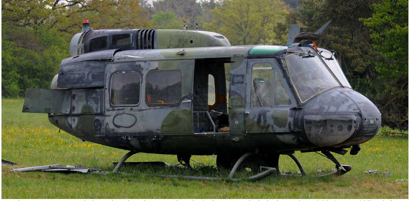
Boomless UH-1D 70+58 is parked outside at the military Standortschießanlagen at Neulindach, close to the airfield of Fürstenfeldbruck. (5 May 2019, Martin Bach)