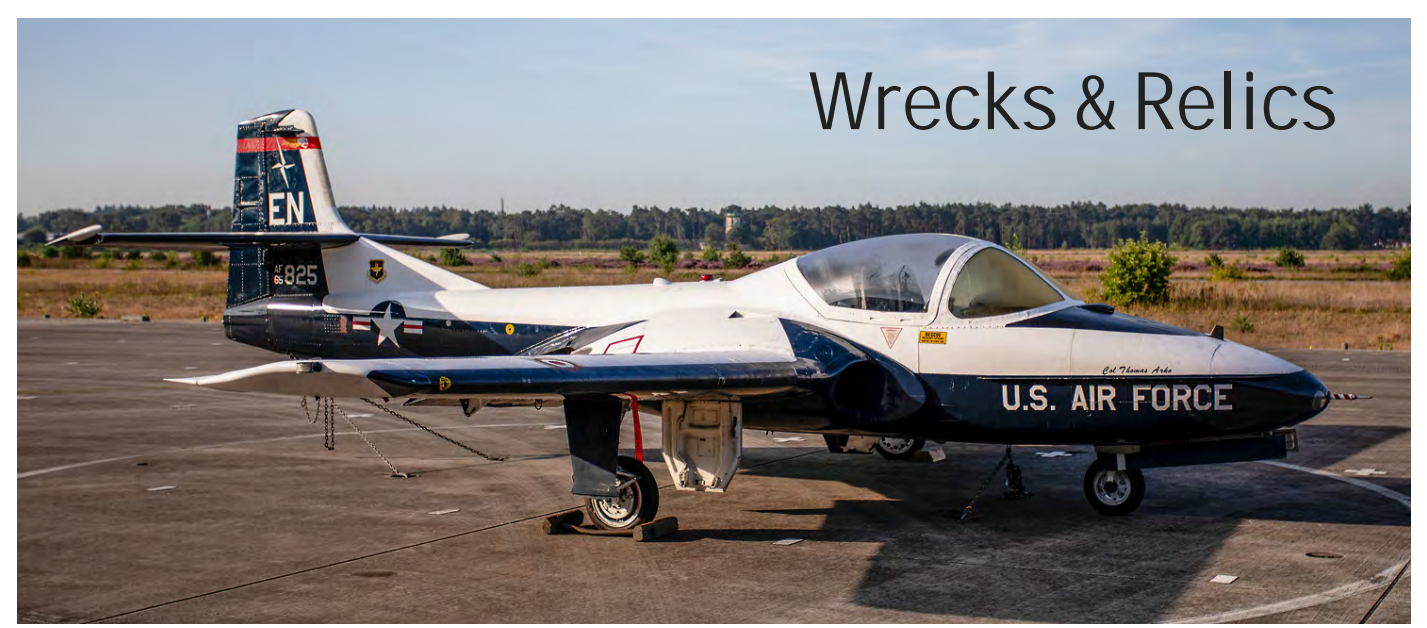
The Nationaal Militair Museum at Soesterberg organized a special event in August named Zomeroffensief 2019 (Summer Offensive) during which several of the aircraft in storage were parked outside. One of them was this USAF T-37B 65-10825/EN. (23 August 2019, Manolito Jaarsma)