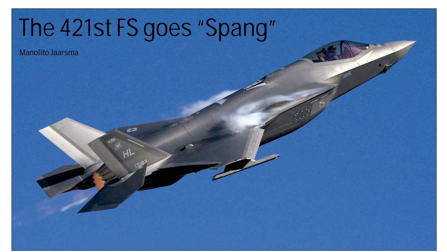
Robert Flinzner was one of our subscribers who responded to our call for more photos in the latest Scramble magazine. He decided to visit Spangdahlem AB on 23 July, despite the very warm weather conditions. It resulted in this nice shot of F-35A 15-5183 during a take off into a clear blue sky