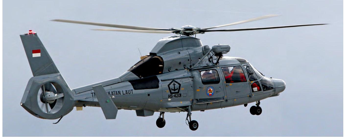
It is not often that we get decent photographs from Indonesia. So we are very happy to be able to present you this AS565Mbe HS-4201 from Skadron Udara 400 of the Tentara Nasional Indonesia - Angkatan Laut, the Indonesia navy. (Bali/Ngurah Rai, 10 July 2019)