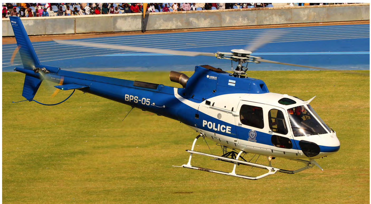
The Botswana police uses a handful of AS350B3. This one was captured at Gabarone. (BPS-05 (8117), 3 August 2019)

For Japan acquiring the F-35B is a solution to the problem of defending the remote islands, however to do this it needs to convert one or both Izumo-class helicopter carriers to be able to allow F-35B operations. For the moment no budget is set aside to start actual work on converting these ships, only for conducting research and study into these 'refurbishments'. So it is a little puzzling why Japanese officials already requested the USMC to deploy F-35Bs aboard these ships. The Marines can only determine the feasibility of such a deployment after conversion. Probably the idea is to first train the JMSDF ship's crew in F-35B operations using USMC assets already used to operations from 'small' ships and thereafter deploy JASDF F-35Bs from their land base, rumoured to be Nyutabaru.