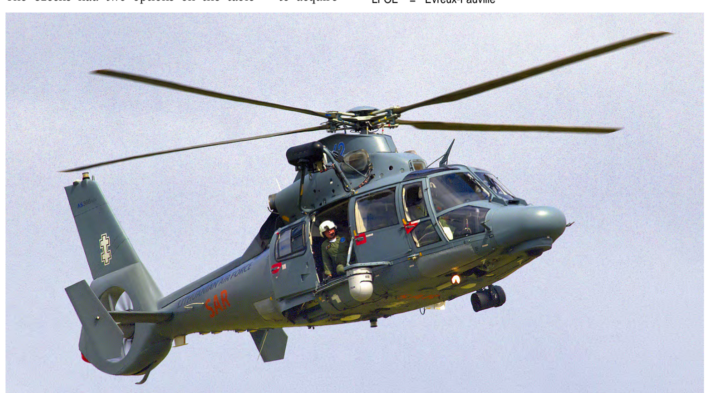
This year Lithuania is celebrating the 100th anniversary of its air force. During the airshow at Siauliai, this AS365N3+ performed. It is one of the more recent additions to the fleet. (42, 27 July 2019,)

LFOC = Chateaudun LFOE = Evreux-Fauville