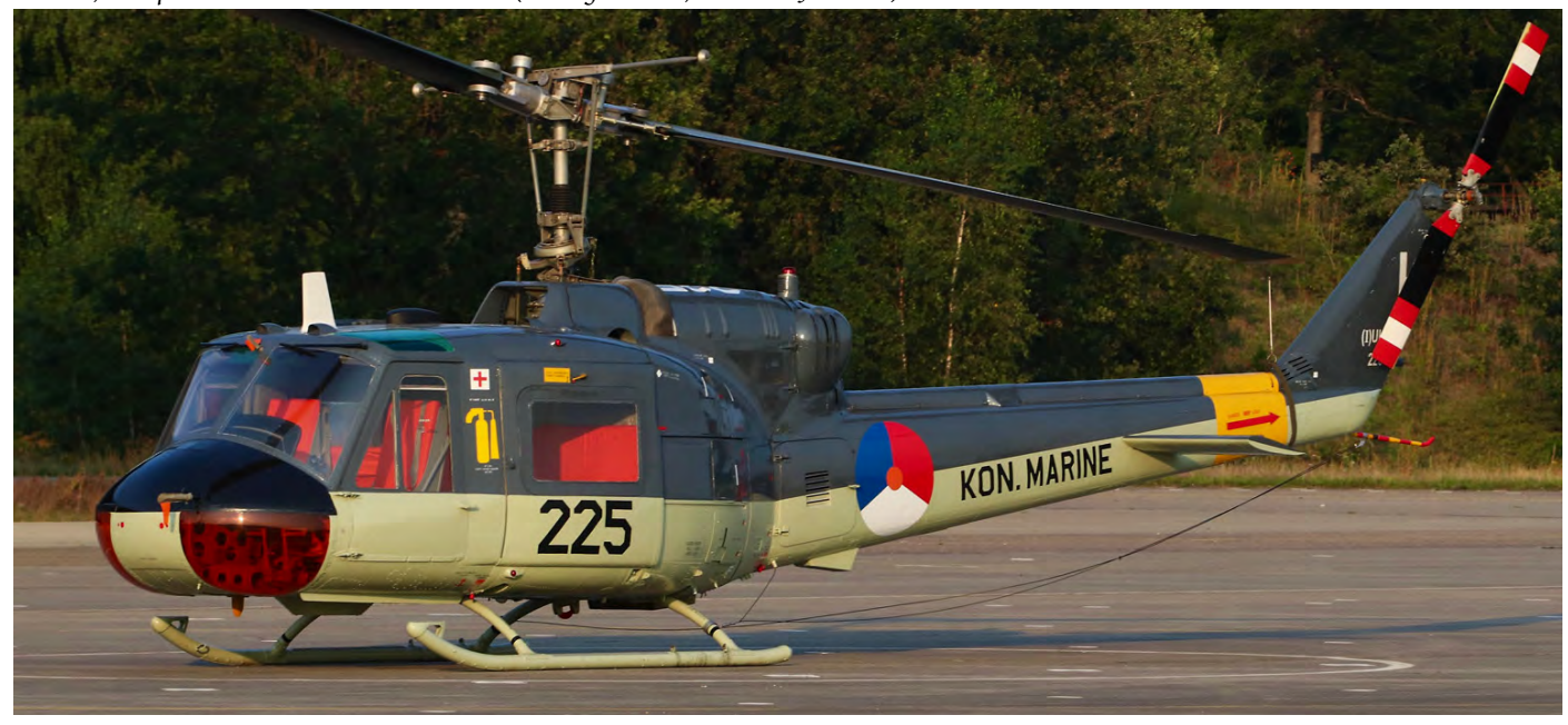
One of the other aircraft moved outside for the Zomeroffensief 2019 at Soesterberg is AB204B 225/K. (26 August 2019, Robbert Snijders)