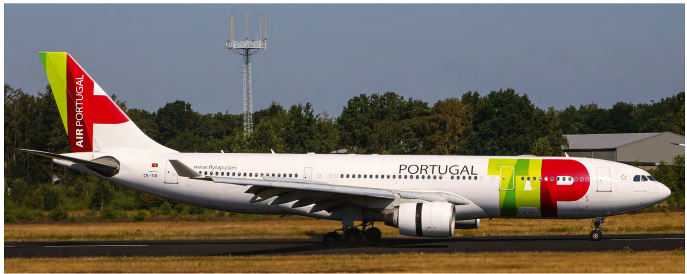
Initially delivered to Austrian Airlines in 1999 this Airbus A330 was added to the TAP Air Portugal fleet in 2007 as CS-TOI. The second A330-200 prototype was flown to Twente for part out by AELS on the day this photo was taken. (Twente, 30 July 2019, Tim Volmer)