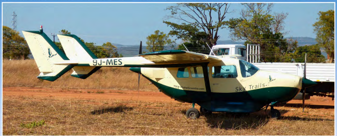
Almost 3,000 Skymasters where built between 1963 and 1982. One of them is Cessna 337 9J-MES flying for Sky Trails and also seen at Kapamba Airstrip.