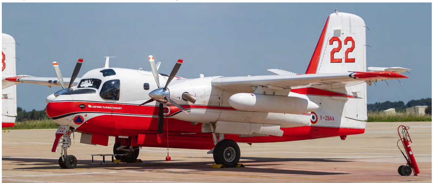
Conair S-2 Turbo Firecat of the Sécurité Civile crashed near the town of Générac (Gard Department) south of Nîmes, France, on 2 August 2019. Iwan Bögels captured the Firecat in full glory at Aéroport de Nîmes only recently, on 25 May 2019.

09aug19 N9862C T-28A 49-1727A dam The North American T-28 Trojan force landed in a farm field west of Ontario Municipal Airport (OR). The airplane