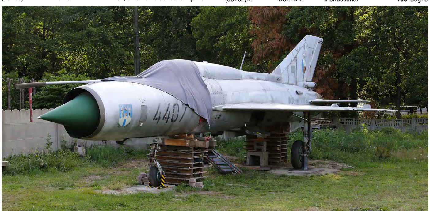
Former Czech MiG-21PFM 4407 is preserved in the garden of a private collector at Helchteren, Belgium. The aircraft used at Balen for several years. (4 July 2019, Toon Cox)