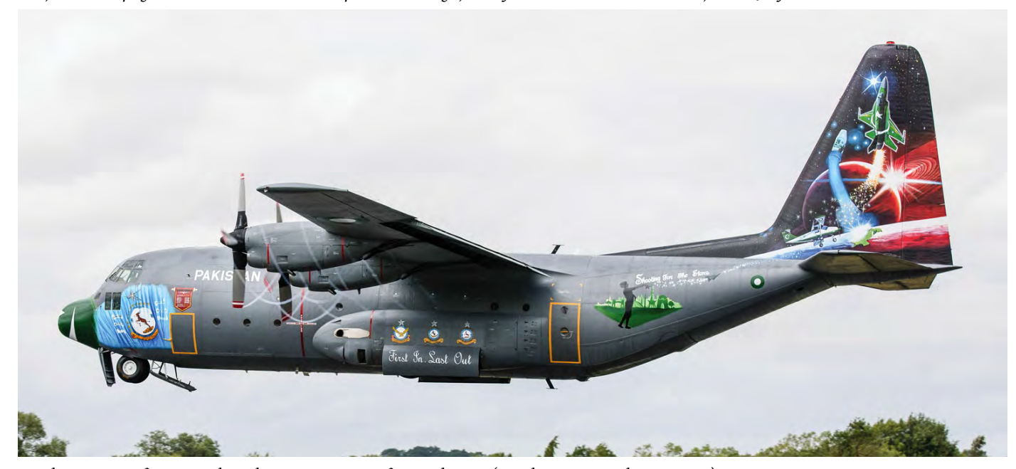
Final RIAT aircraft in special markings, C-130B 3766 from Pakistan. (22 July 2019, Manolito Jaarsma)