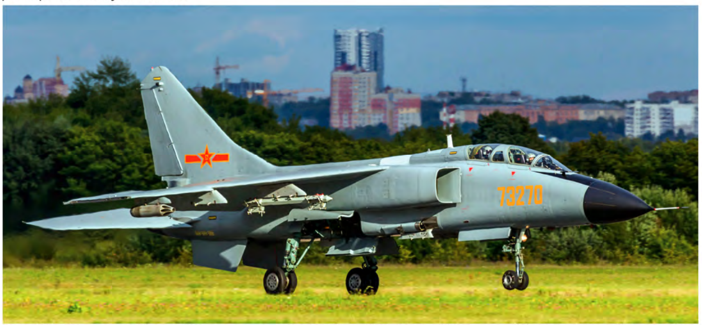
One of the latest manufactured JH-7As were sent to Aviadarts 2019. JH-7A 73270 is one of them and seen during landing. (Ryazan, 1 August 2019)