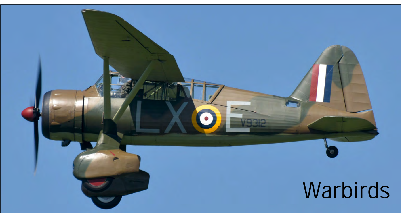
One of the highlights during the Wings of Freedom Airshow at Ede, the Netherlands, on 24 August was this Westland Lysander Mk.III V9312 (G-CCOM) which was restored by ARCO at Duxford. The aircraft made its first post-restoration flight almost one year before this photo was taken, on 28 August 2018. The Lysander has gained fame while delivering secret agents for the Special Operations Executive (SOE) to occupied Europe during WW II.