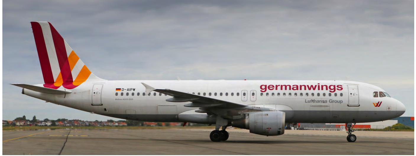
This Airbus was delivered to Lufthansa in December 1990. D-AIPW was transferred by the parent company to Germanwings in April 2015. On the day this photo was taken the A320 has been flown to Belgium for disposal. (Ostend, 9 July 2019, Nik Deblauwe)