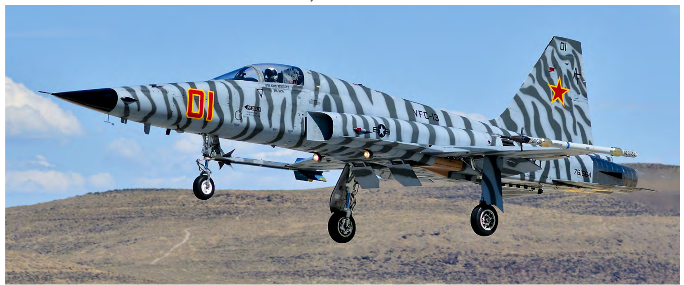
F-5N 761564 of VFC-13 was seen during landing at NAS Fallon after an sortie against CAW3 F-18s which were temporary based at NAS Fallon. (31 July 2019, Nico van der Steen)

FRCE = Fleet Readiness Center East, Cherry Point (NC) FRCSW = Fleet Readiness Center South West, North Island (CA) LMTAS = Lockheed Martin Tactical Aircraft Systems, Fort Worth (TX)