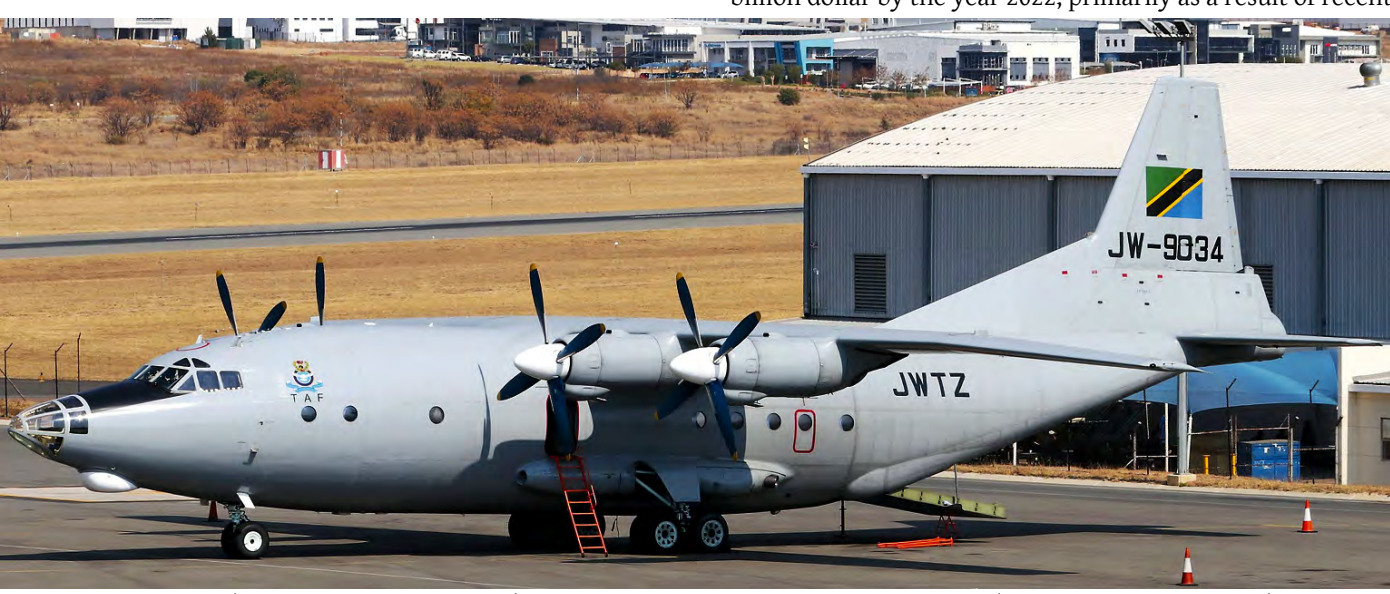
Y8F-200, serial JW9034 (construction number 110804), of the Jeshi la Anga la Wananchi wa Tanzania (JWTZ, Tanzanian Air Force) was caught at Lanseria (South Africa)on the 6th of August 2019. The Tanzanian Air Force operate two Y-8s and these aircraft are normally based at Dares-Salaan.

The Foreign Affairs Committee of US Congress was notified on 11 June 2019 by the Defense Security Cooperation Agency (DCSA) for a proposal to finance two former United States Air Force C-130Hs for the needs of the Moroccan Air Force. This donation of surplus devices is part of the Excess Defense Articles (EDA) Program. In the last ten years Morocco has received donations of several hundreds of millions of dollars from the United States. The Government of Morocco is planning to significantly increase its defense budget to US 3.9 billion dollar by the year 2022, primarily as a result of recent