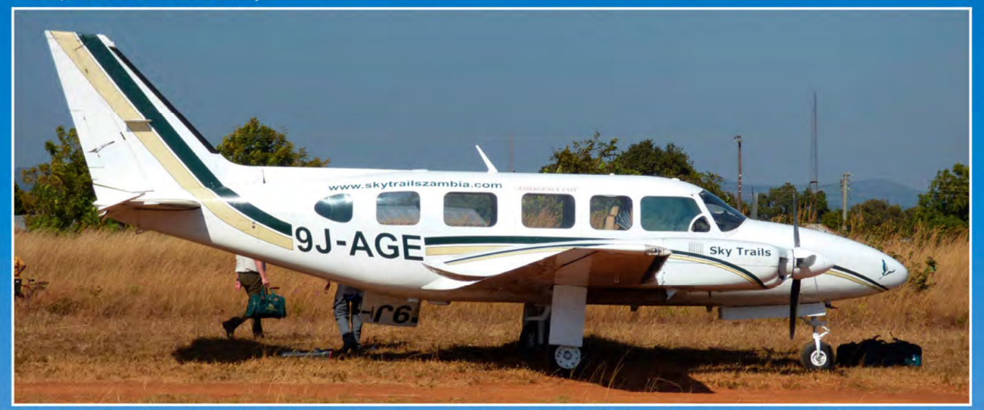
Another charter company in Zambia for bush flights is Sky Trails. They also have different aircraft types in their fleet like this Chieftain. On the same airstrip as above PA-31 9J-AGE was seen.