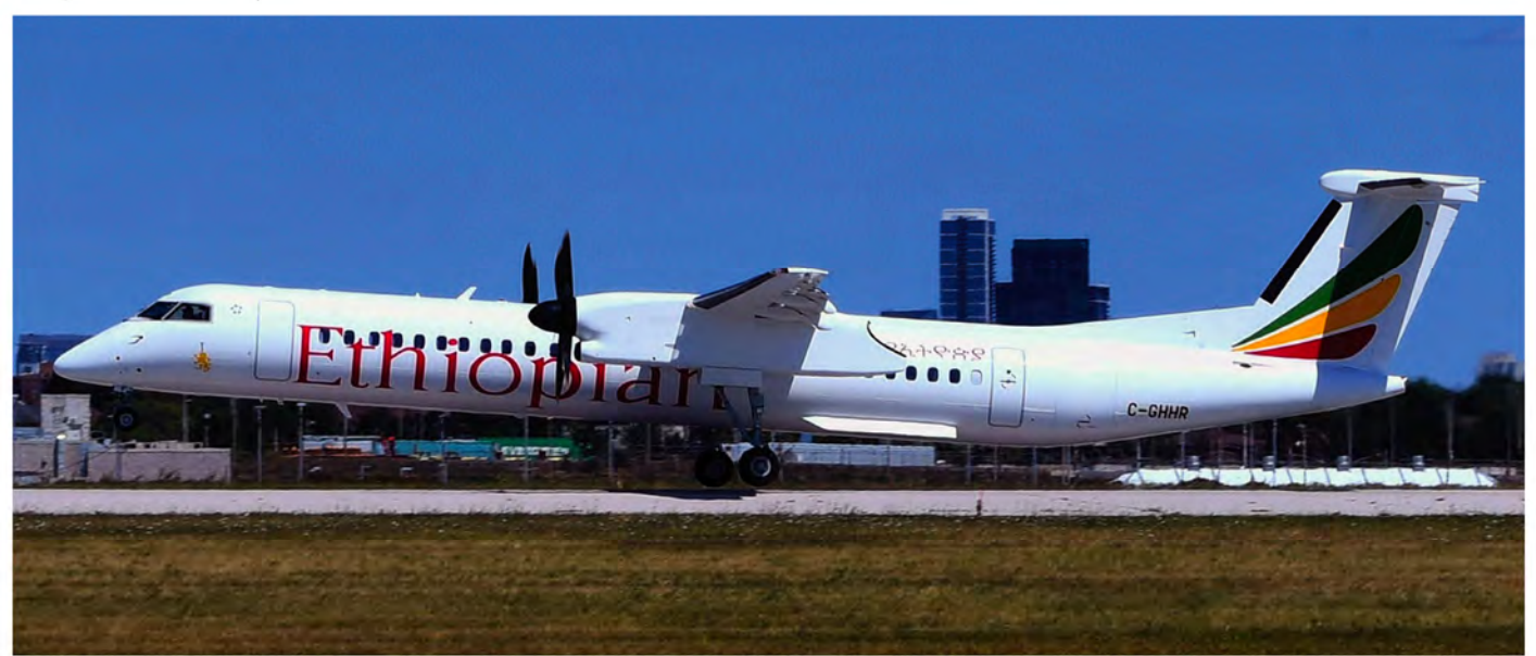
On 14 August at Downsview Airport DHC-8-400 C-GHHR took off for the first time. It was delivered on 25 August to Ethiopian Airlines as ET-AXF. (Frederick K. Larkin)