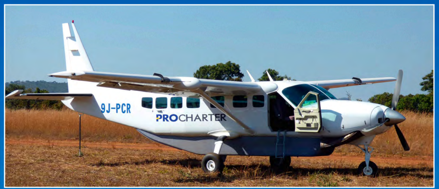
ProCharter is Zambia's largest air charter company. With a fleet existing of ten different aircraft types they can offer various types of flight. With the Cessna 208 for instance they fly to bush airstrips. 9J-PCR was seen at Kapamba Airstrip. (all pictures this page 20 July 2019, Werner Fischdick)