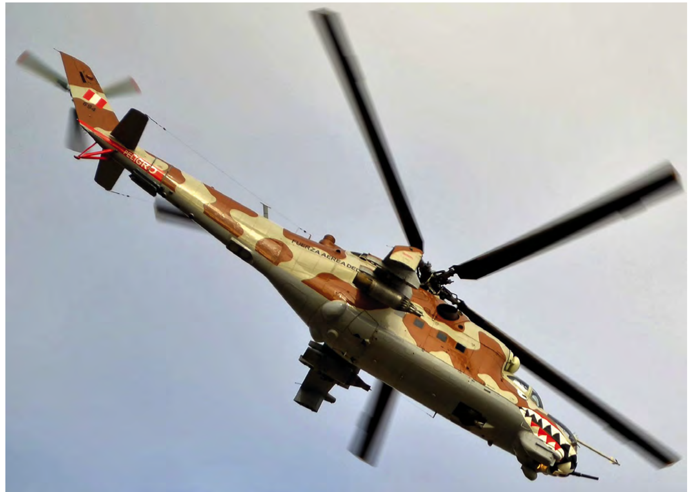
Just before turning green/grey, the first two freshly maintained Mi-25s were shortly clad in desert camo again. (Lima, 19 July 2012, Bryan Luna)