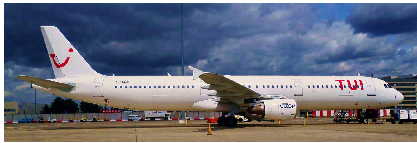
SmartLynx added this former Aeroflot/Small Planet Airlines Poland Airbus to its fleet early July 2019. YL-LDB was delivered from Erfurt to its summer base Charleroi on 20 July 2019 and operated its first service for TUI Belgium the next day. The A321 diverted to Brussels on 28 July 2019 with a technical issue. (Brussels, 31 July 2019, Yves Deliens)