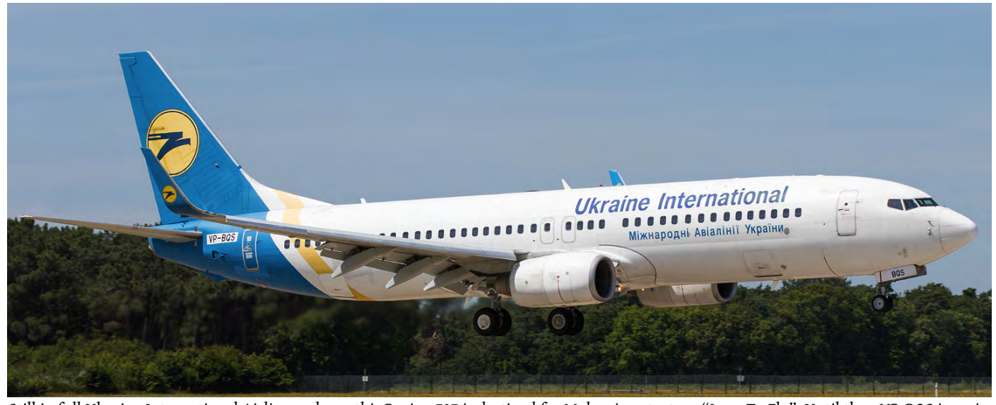
Still in full Ukraine International Airlines colours this Boeing 737 is destined for Malaysian start-up "Love To Fly". Until then VP-BQS is registered to its owner Aviation Capital Group. (Woensdrecht, 4 July 2019, Johan Havelaar)

Eindhoven based 336sq C-130H-30 visits due to an exercise. The new Netherlands Government B737-700 BBJ was finally delivered on 9 July. On the civil side the first exotic arrival started on the first of July, being a former Jet Airways VT-JTB, ending a 4.5 year duty in India following the demise of the airline. The airplane is currently stored at FAS, on behalf of its American lessor, awaiting a new lease contract. Three days later a former Ukraine International B737 arrived, this time ex UR-PSA, and this narrow body will follow the lead of UR-PSB, also heading for Malaysian start-up Love2Fly.