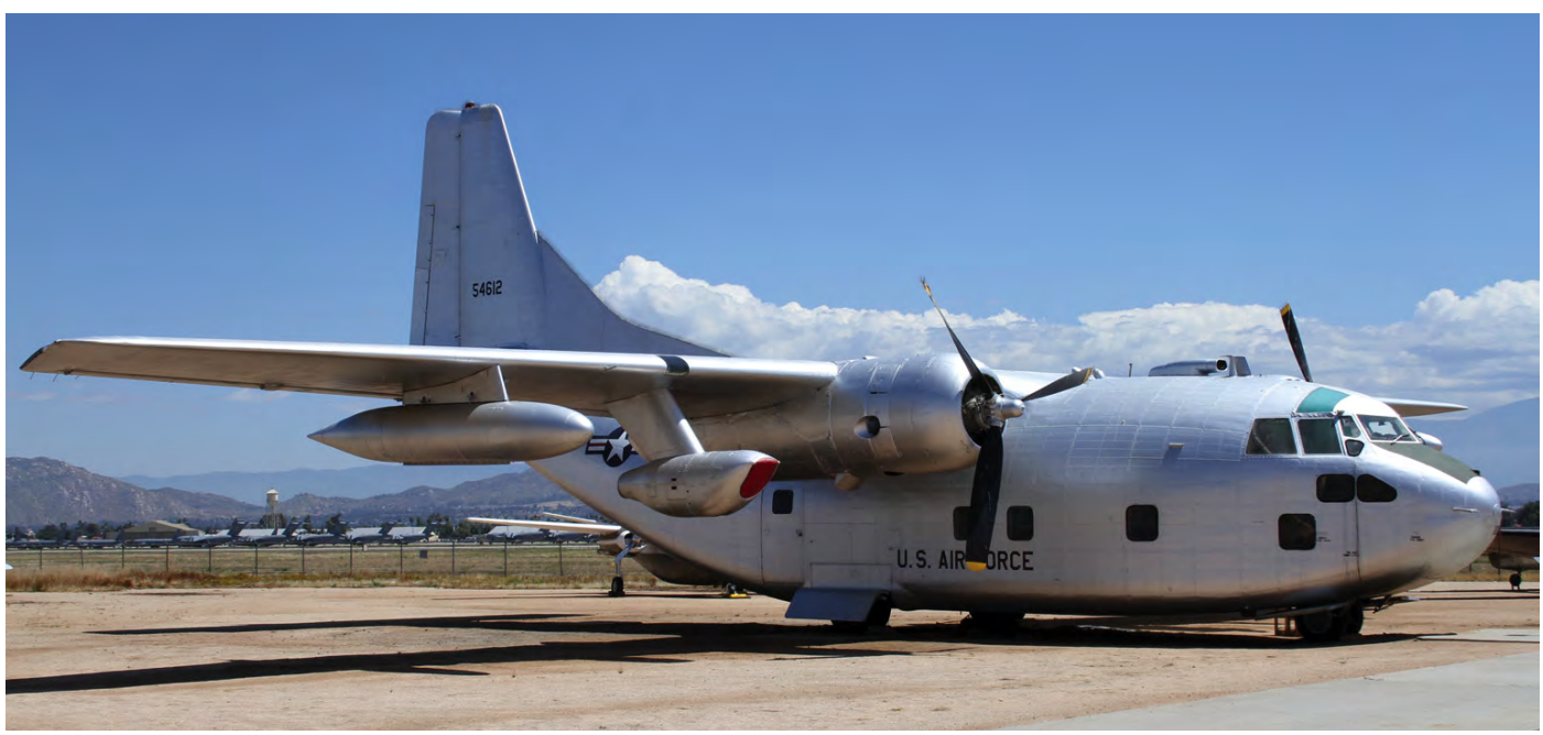
In the museum at March Field (CA) you can find outside this preserved USAF C-123K with serial 54-0612 still in an outstanding condition. (28 May 2019, Jeep Stoker)