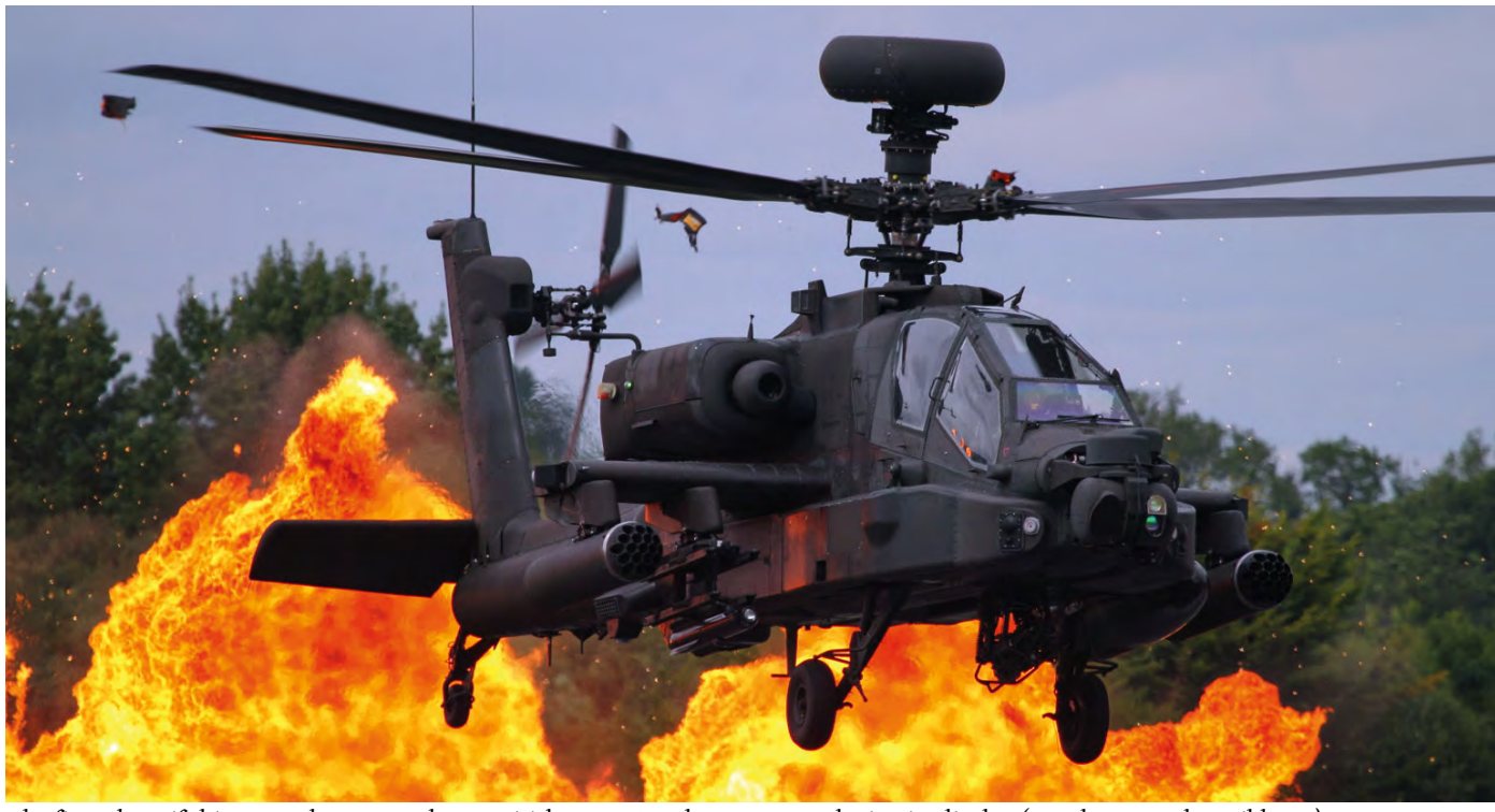
The first photo if this RIAT photo page shows British Army Apache AH1 ZJ181 during its display (21 July 2019, John Wildman)