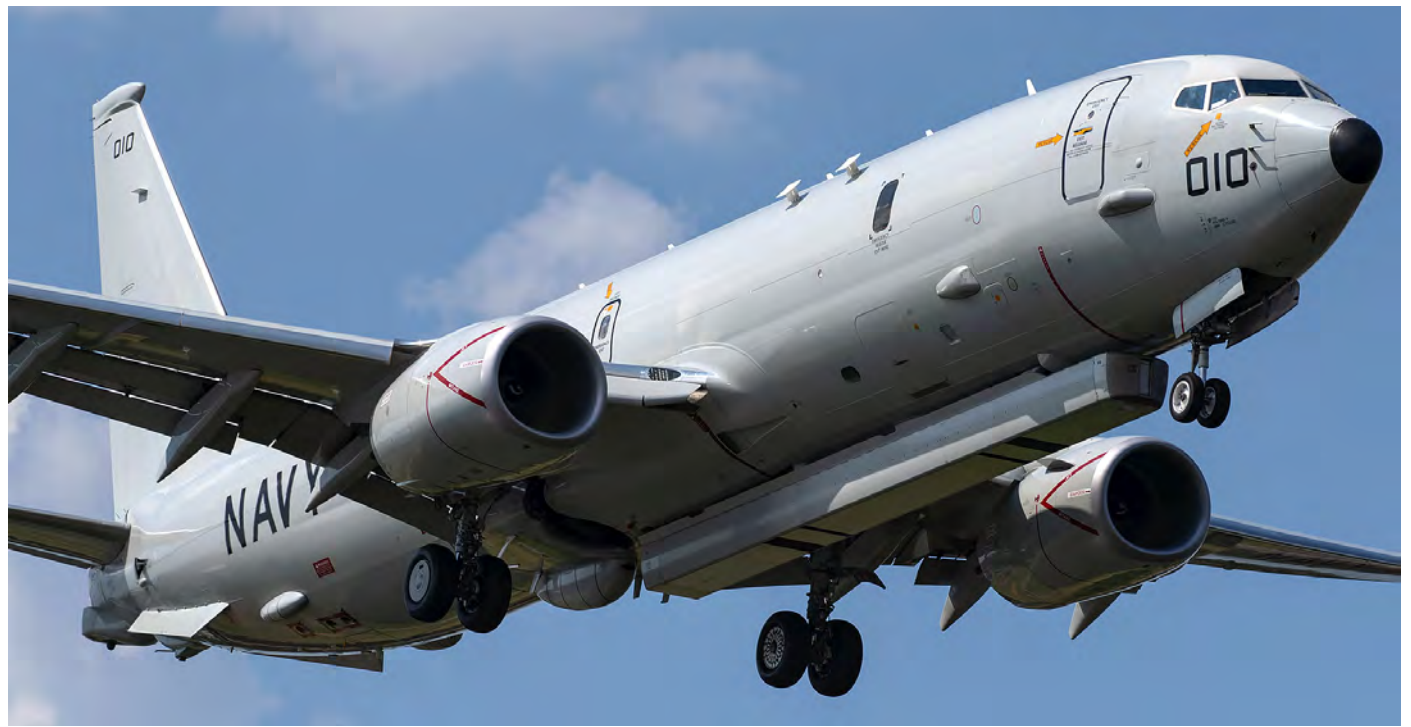
US Navy P-8A Poseidon BuNo 169010 of the Naval Air Systems Command-Flight Support Detachment is seen approaching runway 13R at Dallas-Love Field after a sortie over the Gulf of Mexico. Attached underneath the fuselage is a Raytheon Advanced Airborne Sensor (AAS). The unit's mission is shrouded in secrecy, but it has been rumoured as a (mainly) drug interdiction unit. (7 August 2019)