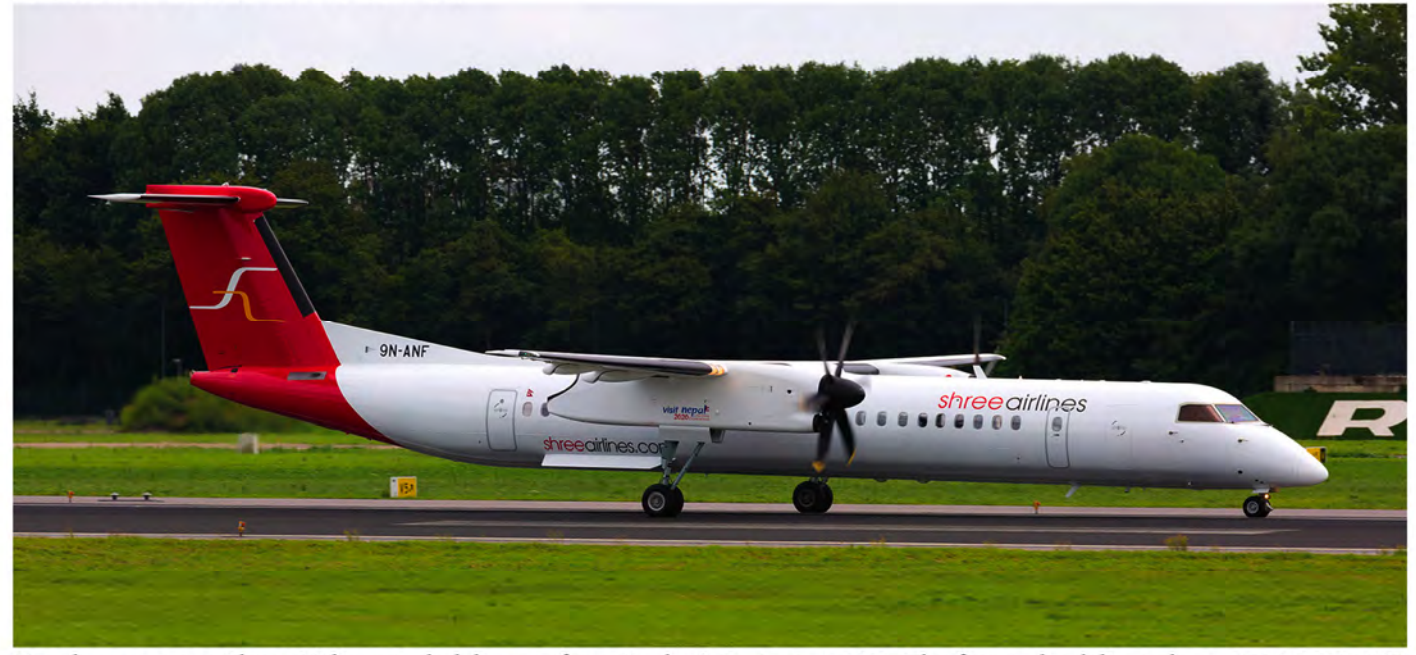
Nepalese operator Shree Airlines took delivery of two Dash 8's in August 2019. The first to be delivered was DHC-8 9N-ANF, which made a fuel stop at Rotterdam-The Hague on 16 August.