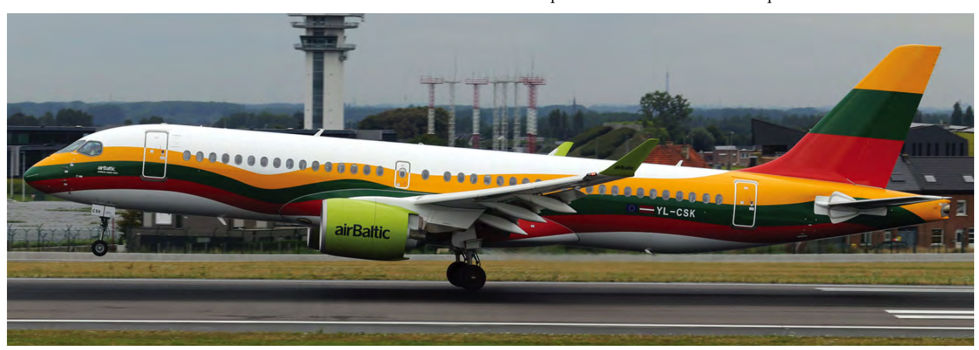
AirBaltic has painted three Airbus A220's in the colours of the Baltic state flags. YL-CSL carries the Latvian colours, YL-CSJ the Estonian ones and finally YL-CSK the Lithuanian flag colours. (Brussels, 9 August 2019, Paul Sanders)

With the B737MAX situation unchanged for its buyers and the upcoming high-season fast approaching, <u>GOL</u> will lease five B737-800s from the Dutch branch of Transavia for the last quarter of 2019 and the first quarter of 2020.