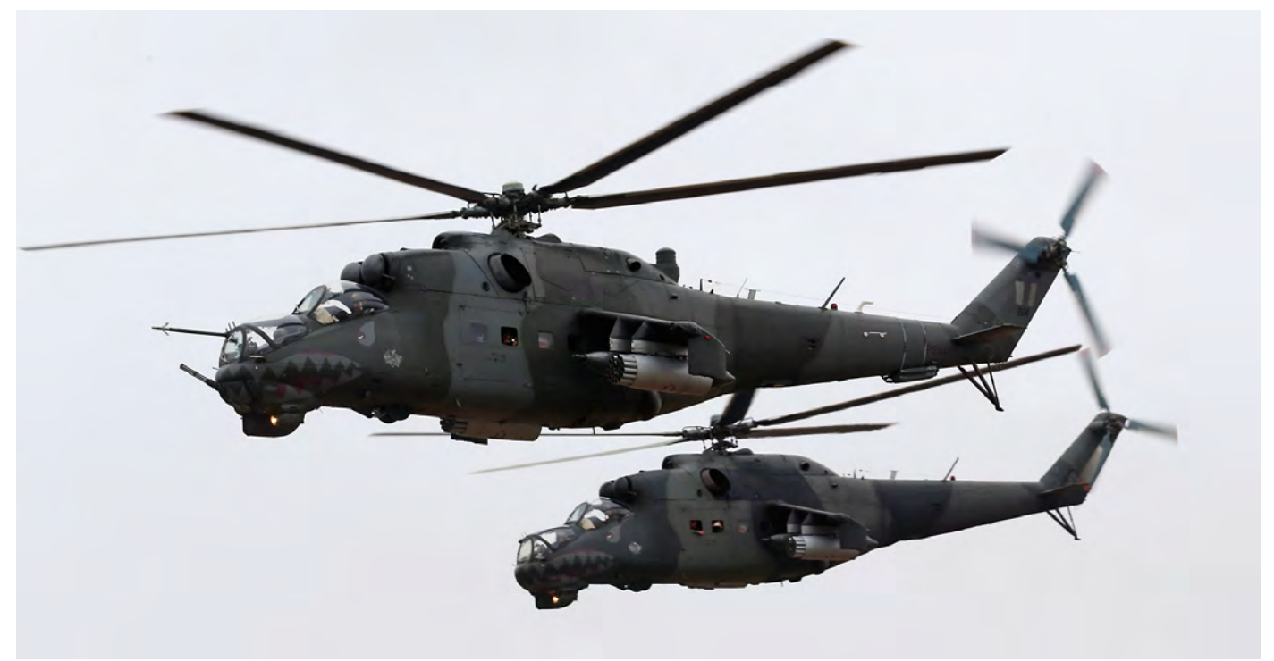
Mi-25 694 with Mi-25U (Mi-24DU) 698, a bit odd looking subtype without a gun, hot on its heels during an aerial display. Both feature the new toned down green/green/grey colour scheme but retain their trademark shark mouths; giving the another nickname, Los Tiburones del Aire (airborne sharks). Home base of Escuadrón Aéreo 211 is Vitor. (Las Palmas, 22 July 2015, MinDef/Luis Enrique Saldaña Alvarado)

On 22 July 2010, two Mi-35P were ordered as part of a larger strengthening program that also included three Mi-171Sh helicopters for Grupo 3. The twin-barrelled behemoths arrived at Lima in April 2011 in a bright green, olive and tan colour scheme. That was changed a couple of years later to a more subdued and business-like tactical green/green/grey scheme that is the current standard. At any one time around eight are maintained in active service with Escuadrón Aéreo 211. Although toned-down in colour, they still wear their shark mouths with pride after more than 35 years of active service. ¡Viva los Dragones del Aire!