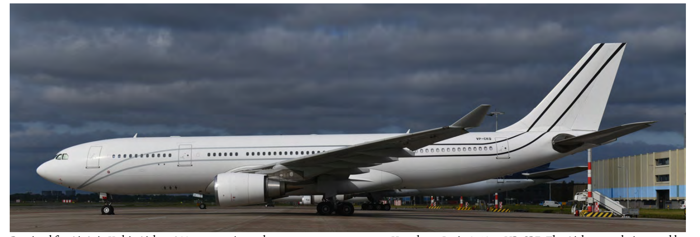
Destined for AirAsia X this Airbus A330 was registered to management company Hongkong Jet in 2012 as VP-CBE. The Airbus was being used by the leadership of the Iglesia ni Cristo (INC), a Philippine religious organisation. In May 2019 the aircraft was sold to a company called Skytrooper after usage of the aircraft by INC leaders was criticised by its followership, and subsequently registered VP-CKQ. It appears however that the aircraft is still being used by INC officials. (Amsterdam - Schiphol, 13 July 2019,)