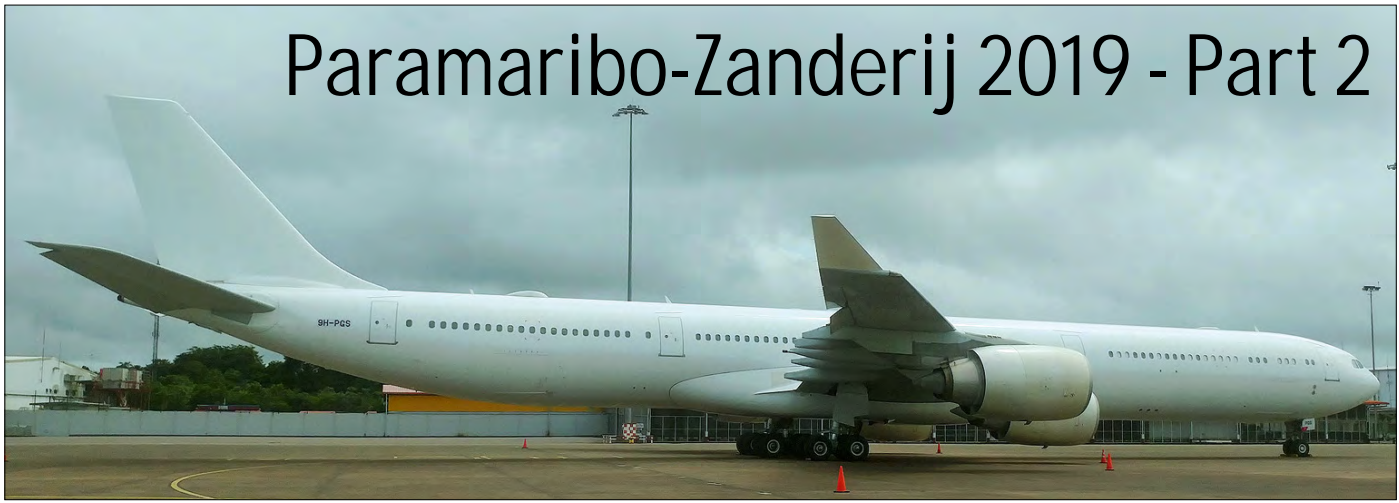
This former Etihad Airbus was flown to Bournemouth early January 2018. The aircraft was registered to European Aviation Group as 2-FIXP later that month. The A340-600 was registered to Maleth-Aero as 9H-PGS in March 2019. After a positioning flight to Stansted it operated its first charter on 28 May 2019. Although the company is legally based in Malta the aircraft still calls Bournemouth home. That is also were the Airbus departed to after having arrived from Amsterdam. (Paramaribo, 29 June 2019, Raoul de Miranda)