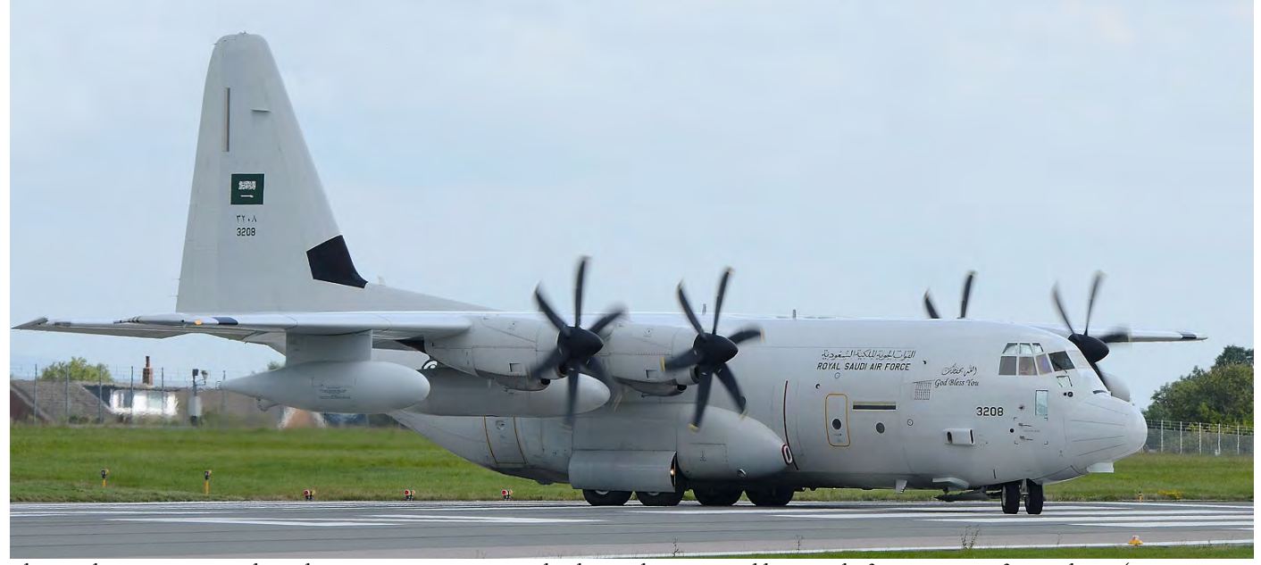
This Saudi KC-130J seems a logical visitor at Warton. Currently, the Saudis are assembling Hawks from pre-manufactured sets. (3208, 1 August 2019, Martin Greenman)

ADS-B, which consists of two different systems, 'ADS-B Out' and 'ADS-B In', could replace radar as the primary surveillance method for controlling aircraft worldwide. In the USA, ADS-B is an integral component of the Next Generation National Airspace Strategy for upgrading and enhancing aviation infrastructure and operations. Using 'ADS-B Out', each aircraft, helicopter or Unmanned Aerial System (UAS) periodically broadcasts information about itself, such as identification, current position, altitude and velocity, through an onboard transmitter. 'ADS-B Out' provides air