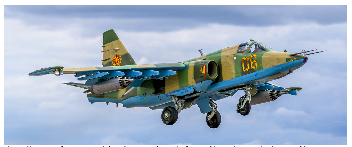
The Kazakhstan Air Defence Force attended Aviadarts 2019 with a couple of SU-25s of the 602nd Air Base Shymkent. One of them was SU-25 06 yellow which was photographed during landing at Ryazan. (1 August 2019, Alex Snow) traffic controllers with real-time position information. On 26 July 2019, US Senator for South Dakota Mike Rounds

Following the FAA-mandated deadline of 1 January 2020, 'ADS-B Out' will be equipped by roughly some 3,000 US Department of Defense aircraft, helicopters and UAS. Recently, it was reported by the USAF that by 2025, DoD plans to have about 62 percent of its aircraft and helicopters equipped with ADS-B Out, including 35 percent consisting of fighter aircraft, 67 percent of helicopters, and 100 percent of mobility, command and control/intelligence, surveillance, and reconnaissance, and trainer aircraft. It was also stated that the DoD will not equip aircraft and helicopters that are to retire by 2025 with ADS-B Out, as the Pentagon determined that the effort would not be worth the cost.