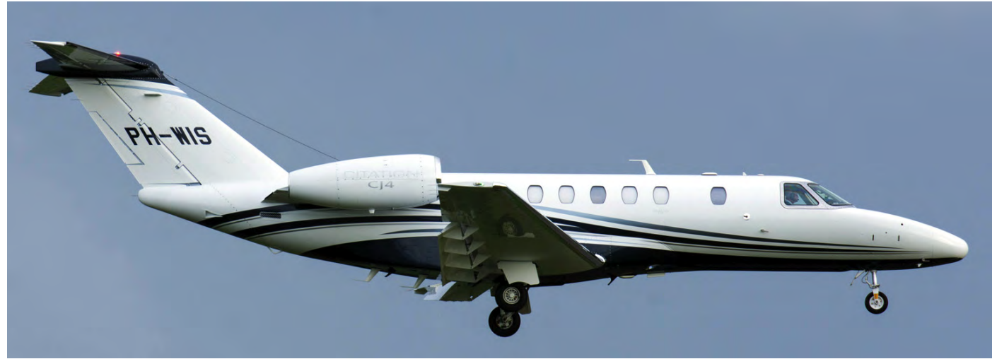
Brand new Cessna 525C PH-WIS (msn 525C-0297) was delivered to Rotterdam on 12 August. It is owned by KNSF Flight Services, who also own Cessna 525 PH-FIS. (Rotterdam The Hague Airport, 12 August 2019,)