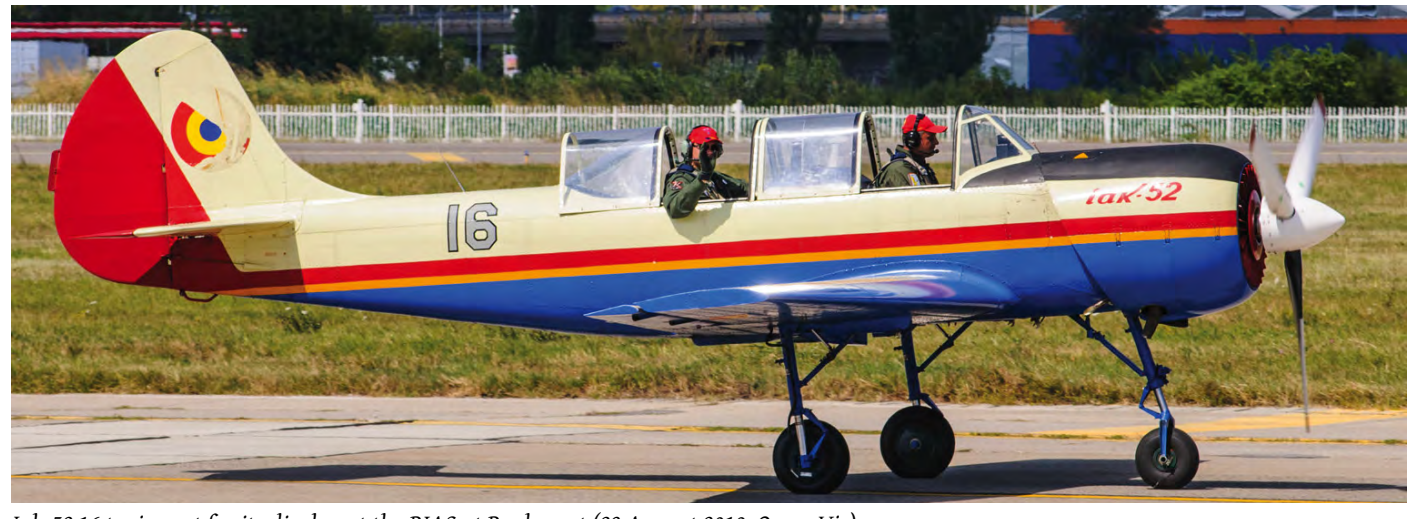
Iak-52 16 taxies out for its display at the BIAS at Bucharest (23 August 2019, Oscar Vis)