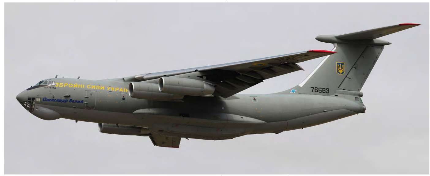
Il-76 76683 was the Ukranian Su-27 support aircraft at this years RIAT. (22 July 2019,)