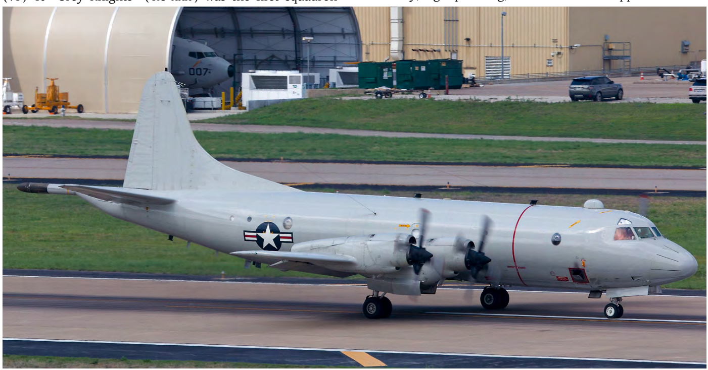
Without its external surveillance radar, only its anonimity and the small roof antennae and radar bulge give this P-3 Orion away as a special missions aircraft. We refer to the item on BUPERS for more information. (Dallas-Love Field, June 2019,)

The BUPERS aircraft have a lot of 'clout', they get top priority in security, flight planning, field services and support. It is their