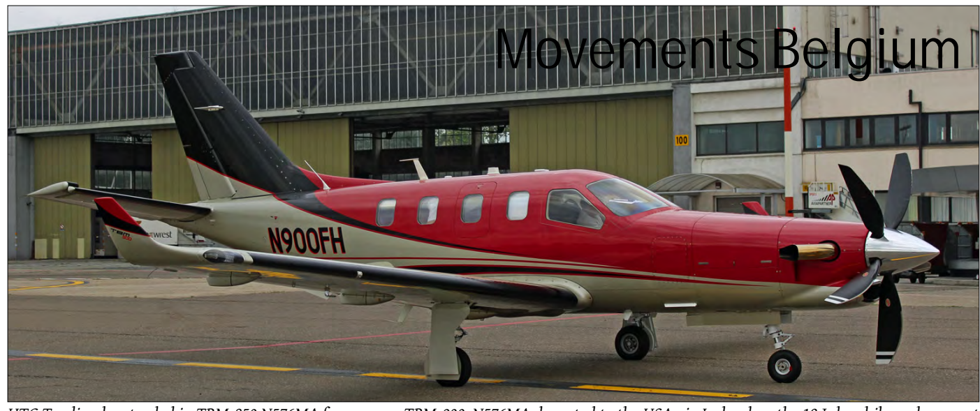
HTG Trading has traded in TBM-850 N576MA for a newer TBM-900. N576MA departed to the USA via Iceland on the 12 July while replacement N900FH arrived at its new home on 18 July. (Antwerp, 20 July 2019)