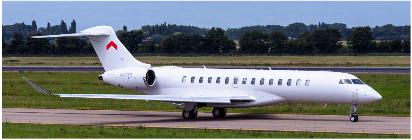
Although officially registered to a company called One Campus Drive Services this Global 7500 is actually owned by Standard Industries. N212WQ was caught on camera eleven days after it was delivered to that company. (Rotterdam - The Hague, 9 July 2019,)