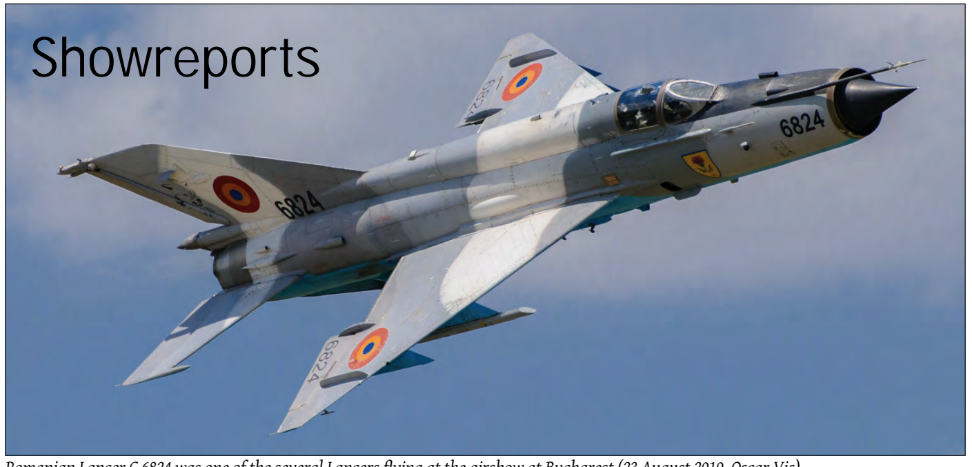
Romanian Lancer C 6824 was one of the several Lancers flying at the airshow at Bucharest (23 August 2019,)