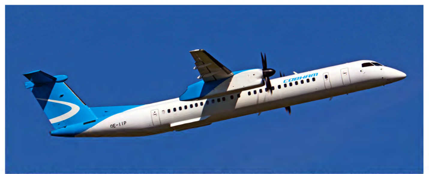
DHC-8 OE-IIP flew in the past for Air Berlin and Eurowings as D-ABQS. Since November 2018 it was stored at Saarbrucken. After this she ferried to Shannon for a paintjob. On 30 July it was delivered to Cobham Aviation as VH-IYJ. (Shannon 13 July 2019,)