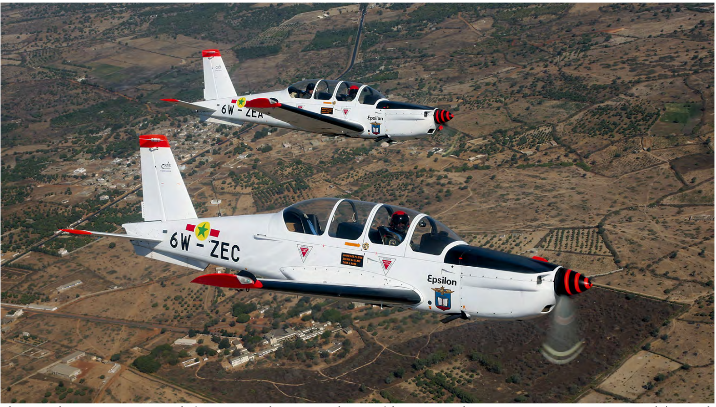
The Senegalese Air Force operate only four TB-30s in the training role. Two of them are seen during an Air-to-Air sortie over Senegal. (15 March 2019, Pascal Schwarz)

military procurement by Egypt. After the political changes in Egypt, Morocco has become the second-largest beneficiary of EDAs in the world after Israel.