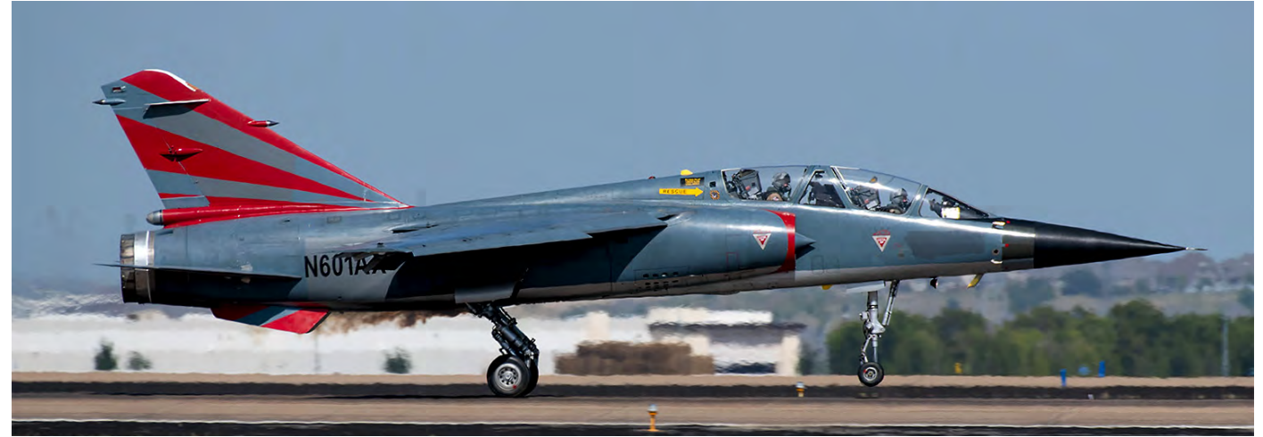
This former Armée de l'Air (AdlA, French Air Force) Mirage F-1B is one of 63 ATAC's newly acquired aircraft which were acquired for adversary/aggressor operations. (Fort Worth, 22 August 2019, Dylan Phelps)

Two KC-46A Pegasus arrived at Portsmouth/Pease Intl Tradeport (NH) on 8 August 2019 (one was serial 17-46029 34110/1137 ex N55141). The 157th Air Refuelling Wing of the New Hampshire Air National Guard at Pease (NH) was selected as the first Air National Guard Base to receive the new KC-46A tanker, which replaces the fleet of KC-135 Stratotankers. As reported by Scramble Facebook News (SFN) before, McConnell AFB (KS) received the first two KC-46As in late January. The last of eight KC-135Rs departed the 157th ARW, 133rd ARS "Live Free or Die" at Pease last March. In the