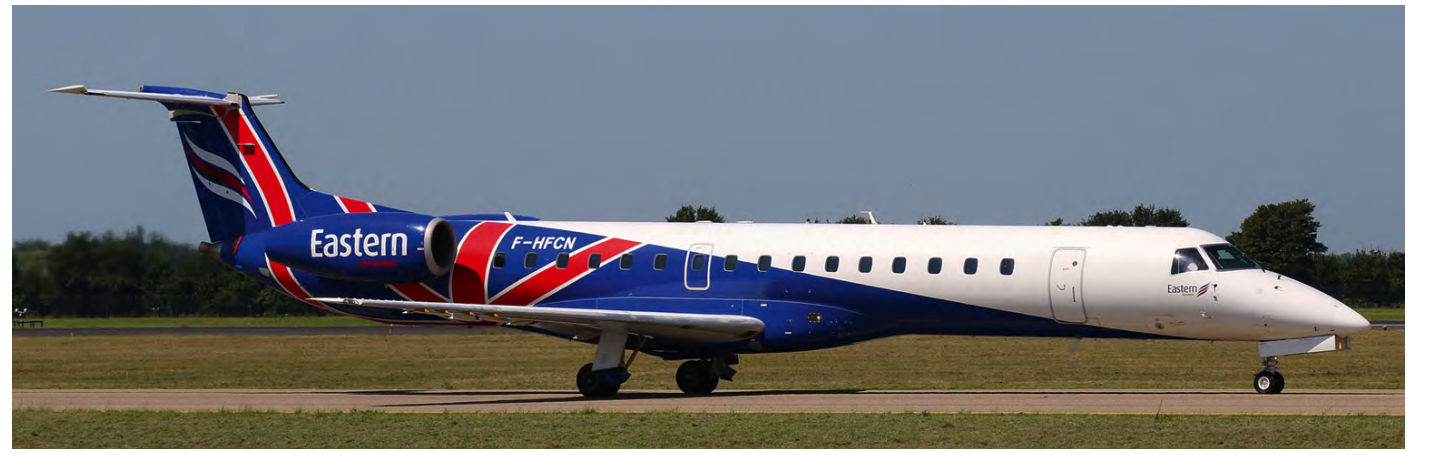
Eastern Airways operated this Embraer ERJ145MP from July 2011 till February 2019 registered as G-CGWV. It was tranferred to Valljet as F-HFCN that same month but it retained the full Eastern Airways colours for unknown reasons. (Rotterdam - The Hague, 23 July 2019,)