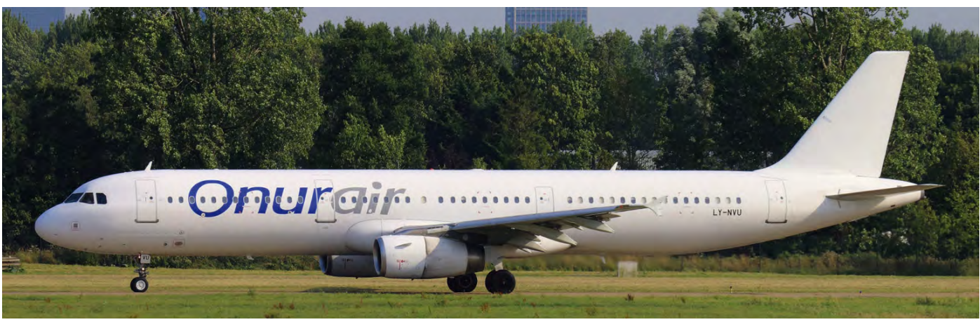
Avion Express added this Airbus to its fleet in April 2019. LY-NVU was leased to Thomas Cook for two weeks before it was leased to Onur Air, one of the previous operators of this A321. (Rotterdam - The Hague, 24 July 2019, Cor Mout)