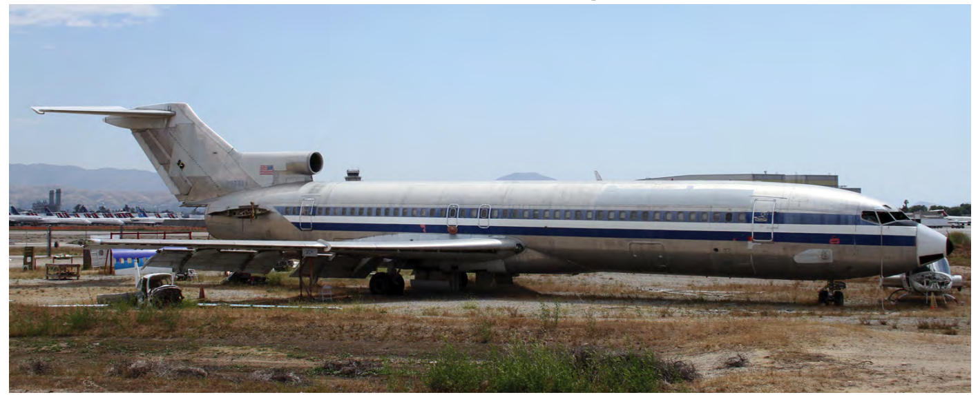
Since August 2013 the registration N869AA was cancelled for this Boeing 727. Built in 1977 the aircraft flew his total career for American Airlines and was withdrawn from use on 1 March 2002 and stored and San Bernardino (CA).