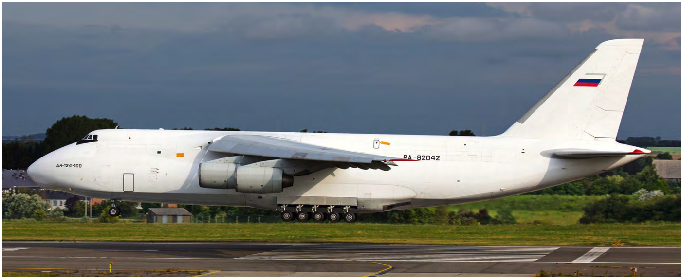
Legal steps made by a Ukranian law firm on behalf of Antonov now prevent Volga-Dnepr to operate their An-124 fleet outside their Russian home turf. To solve this some aircraft are now being operated by Aviacon Zitotrans in these attractive white colours. (Liège, 31 July 2019,)