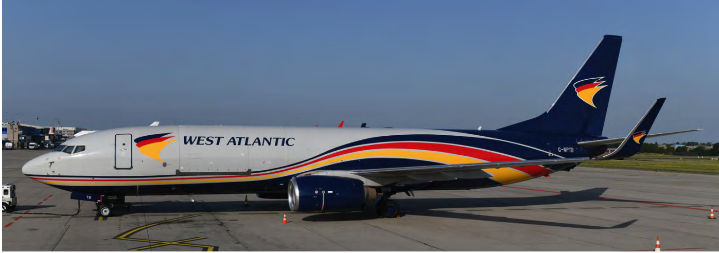
Originally delivered to American Trans Air in 2002 this Boeing 737 was added to the China Southern Airlines fleet in 2006. After being withdrawn from use the aircraft was converted to freighter and delivered to West Atlantic in these modern colours in August 2018 as G-NPTB. (Liège, 30 June 2019, Ton Jochems)