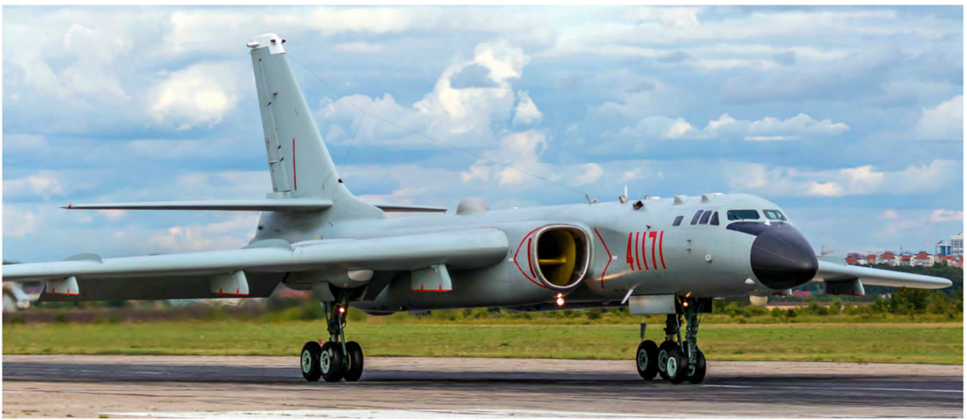
China sent a sizeable fleet to the Aviadarts 2019 exercise in Ryazan. Next to H-6K 41171, also J-10s, JH-7s, Mi-171s and Y-9s participated in this year's edition.