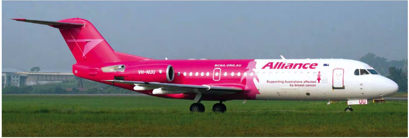
As you can read above, Alliance Airlines Fokker 70 VH-NUU was painted in a pink "Supporting Australians affected by breast cancer" colour scheme. It was captured at Sultan Abdul Aziz Shah Airport, Malaysia, on 16 August, while on delivery to Brisbane, where it arrived four days later.