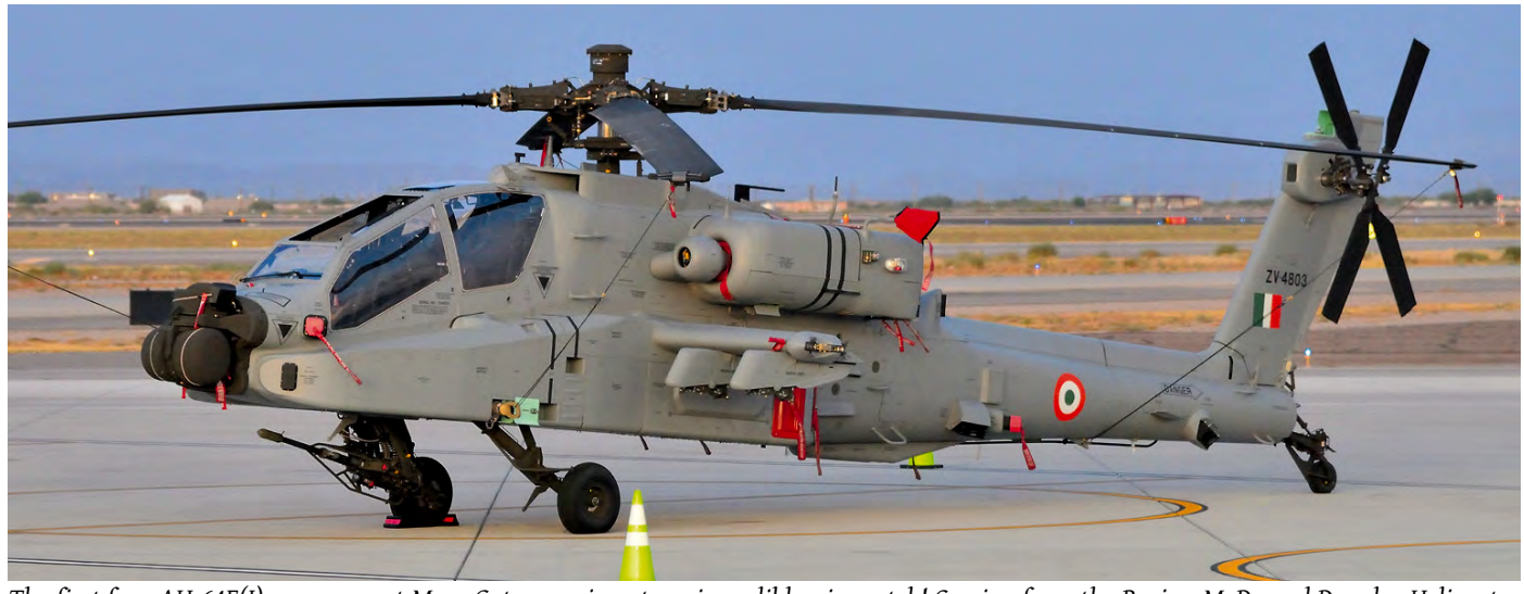
The first four AH-64E(I) were seen at Mesa Gateway airport, an incredibly nice catch! Coming from the Boeing-McDonnel Douglas Helicopter facility at Mesa, they were being readied for transport and delivery at Gateway.

Boeing has been awarded the contract to upgrade all four E-767s of the JASDF and already the first one (s/n 74-3503) has arrived at the Boeing facility at Lackland AFB/San Antonio, TX.