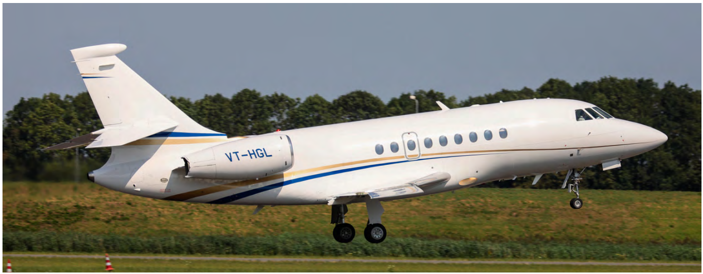
This Falcon 2000 was delivered to the Hinduja Group in 2007 as VT-HGL, and was later transferred to subsidiary Ashok Leyland in March 2012. The aircraft is being operated by Ashley Aviation, which is a subsidiary of Ashok Leyland. The jet was photographed after it had received a fresh coat of paint. (Lelystad, 27 July 2019,)