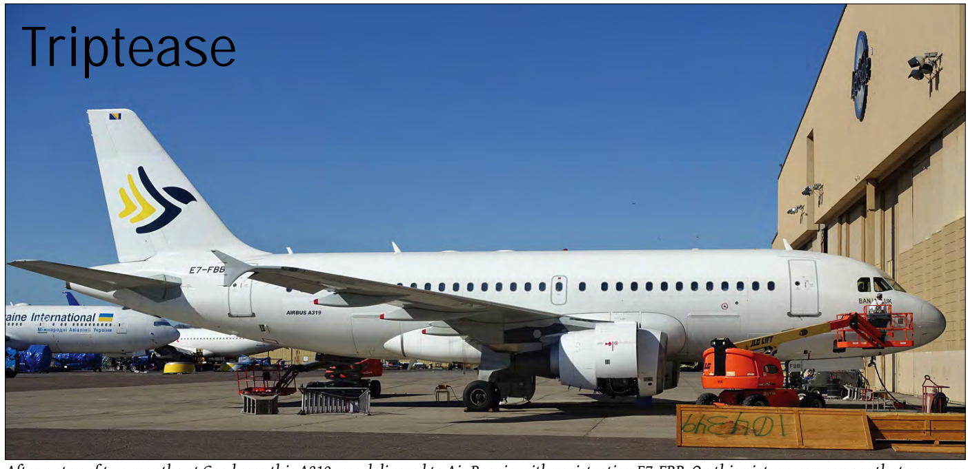
After a stay of two months at Goodyear this A319 was delivered to Air Bosnia with registration E7-FBB. On this picture you can see that someone is putting on or off the name Banja Luka. On several other pictures took after delivery the name is not noted anymore. (Phoenix-Goodyear (AZ), 27 April 2019, Anton van Ruiten)