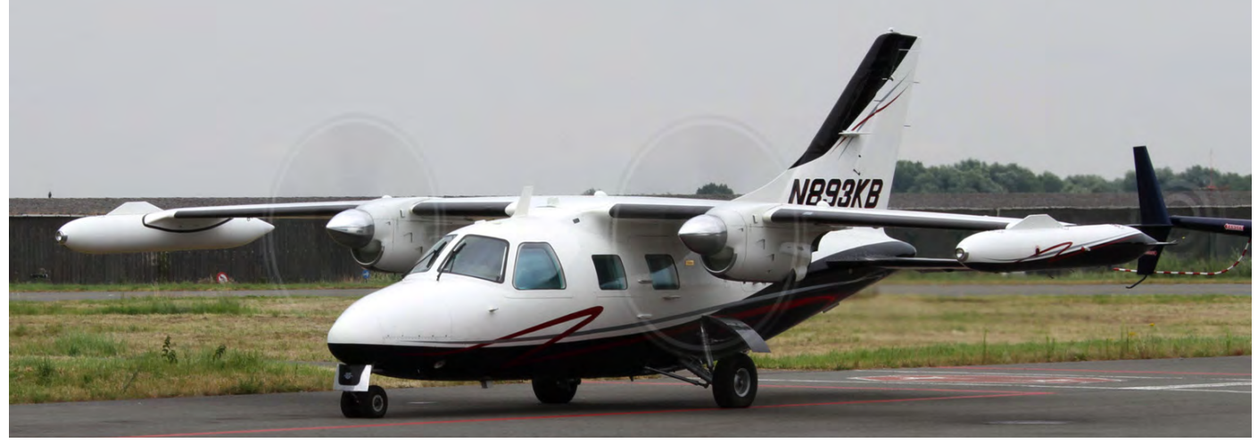
The \ Mitsubishi \ MU-2 \ is \ a \ rare \ breed \ within \ Europe. \ MU-2B-40 \ N893KB \ was \ recently \ listed \ for \ sale \ but \ in \ February \ 2019 \ the \ registered \ owner \ was changed to a trust. In May 2019 it was photographed in Finland, apparantly its new home. 57 Solitairs have been built between 1979 and 1985. (Antwerp, 11 July 2019,)