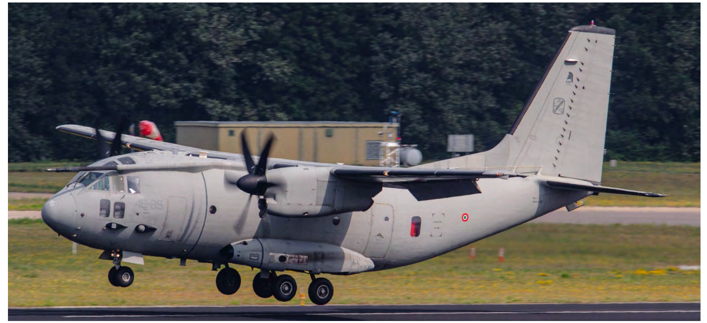
MM62221/46-85 is one of two EC-27J aircraft in service with 98° Gruppo TM. Both Spartans have been converted to EC-27J "Jedi" (= Jamming and Electronic Defence Instrumentation programme) for electronic warfare purposes. This is a modular system, that is why both aircraft are mostly used for passenger transport within Italy. (Eindhoven, 17 July 2019, Luca Neggers)