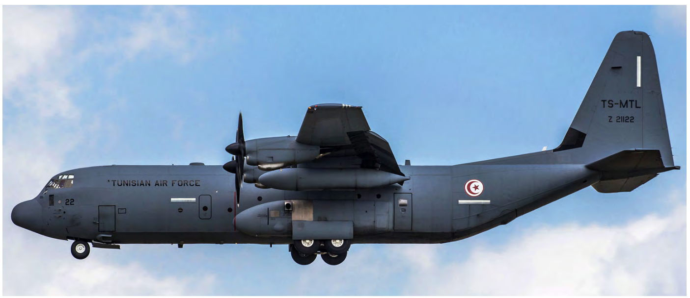
Active with the Tunesian Air Force since 2014, this Lockheed Martin C-130J-30 was caught on camera arriving at Brussels. The transporter is being operated by 21 squadron, based at Bizerte-Sidi Ahmed according to our Tunesian OrBat. Besides its civilian registration TS-MTL it also carries military serial Z21122 on its tail. (Brussels, 1 July 2019,)