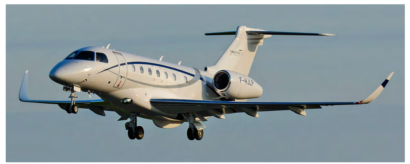
A first visit for the most northern civil airport in the Netherlands. EMB550 F-HJLP operated by Air TNB is the first Praetor 600 being delivered to a company on mainland Europe. (Groningen - Eelde, 9 July 2019, Simen Doorschman)