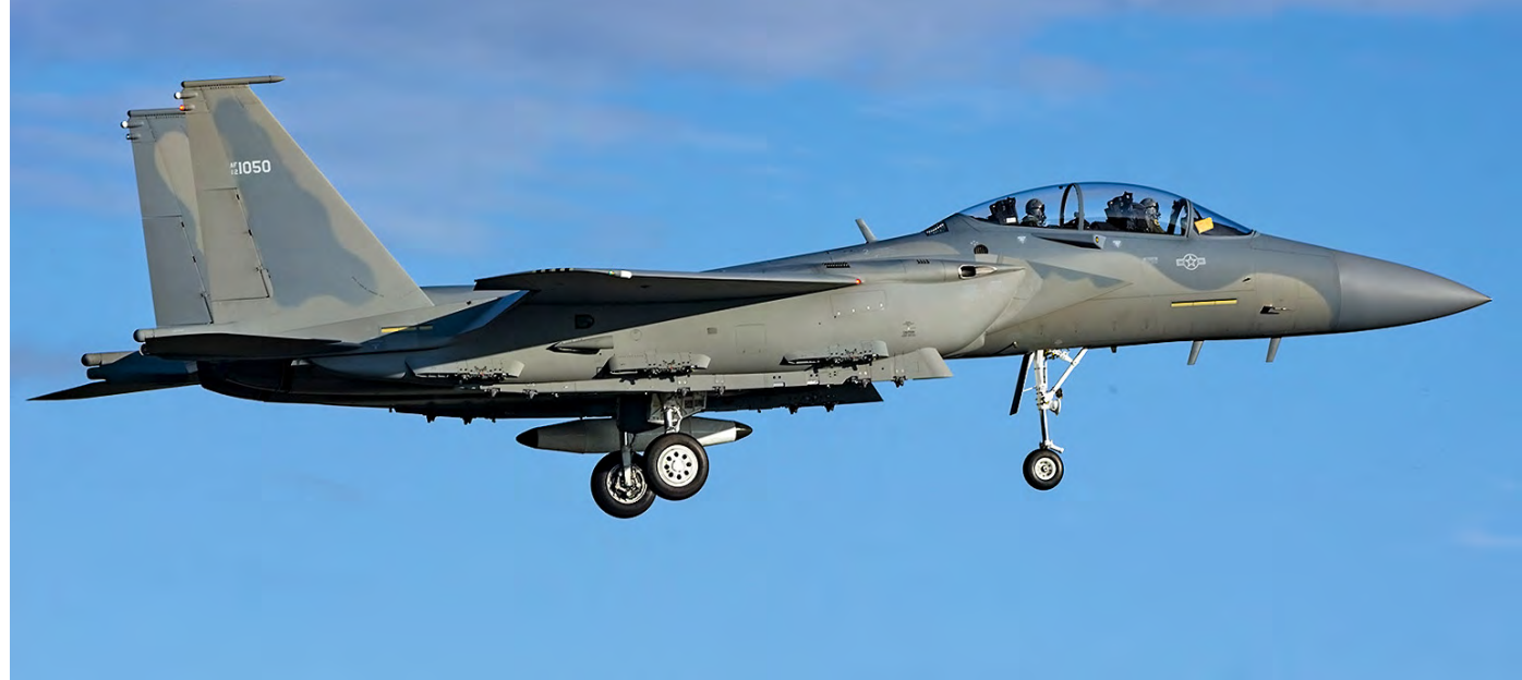
On 29 July 2019, six factory-new Boeing F-15SA Advanced Strike Eagles, destined for the Royal Saudi Air Force (RSAF), landed at RAF Lakenheath (UK). With call-sign Retro 66, this 12-1050 was the last of its flight to touch down. The six Advanced Strike Eagles continued their ferry flight to Saudi Arabia on 30 July 2019. (Rick Sleight)