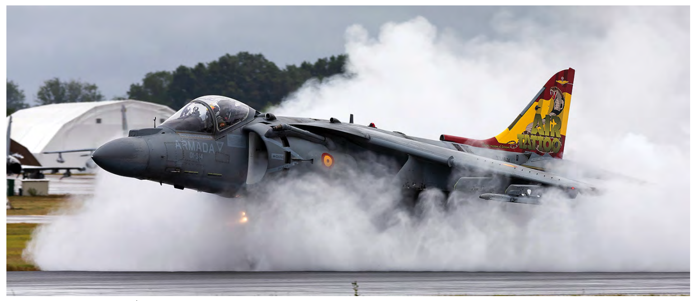
Spanish Harrier VA.1B-24/01-914 was one of the very few aircraft which did a flying display on the Friday at the RIAT. Rain was the big spoiler for the other displays, but for the Harrier it created some special effects (19 July 2019,)