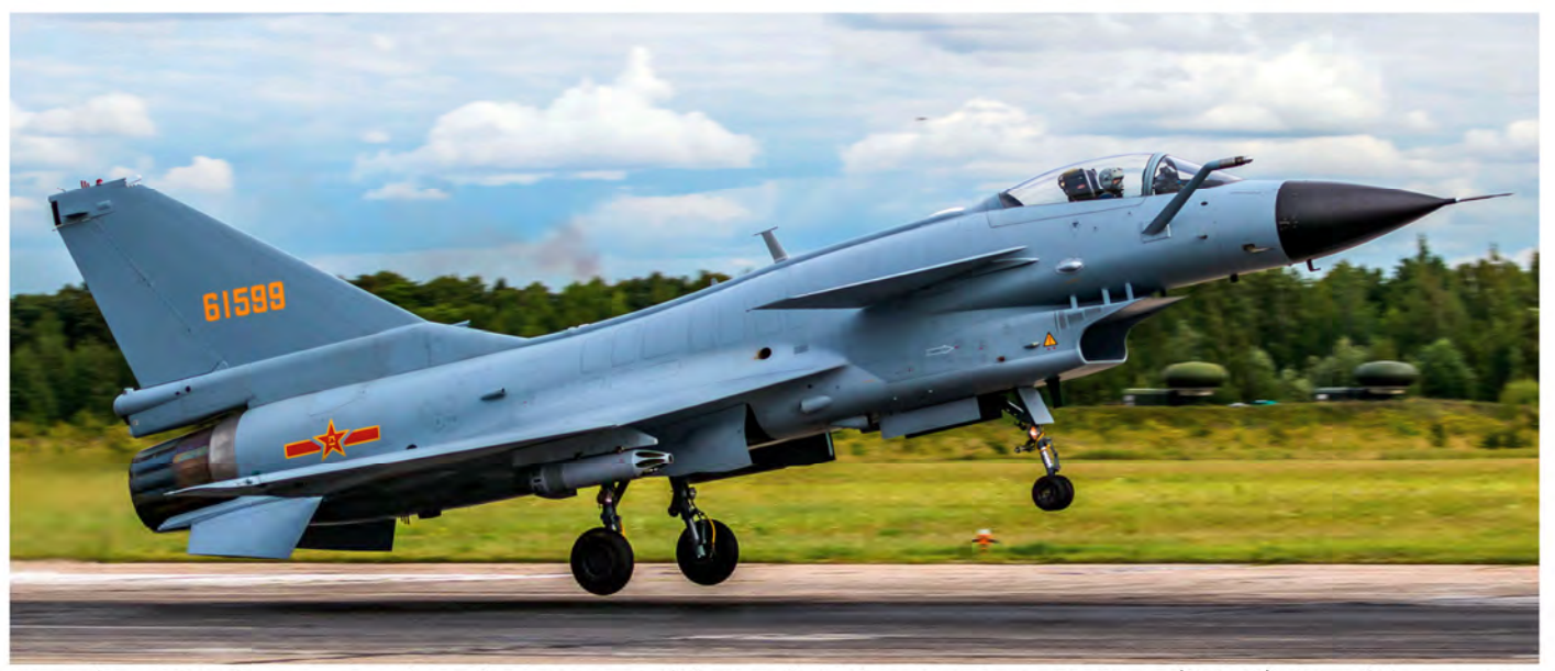
More than 300 J-10s are currently in the inventory of the People's Liberation Army Air Force (PLAAF). One of them is J-10A 61599 of the 8th Brigade, normally based at Changxing and now seen during landing at Ryazan. (1 August 2019, Alex Snow)