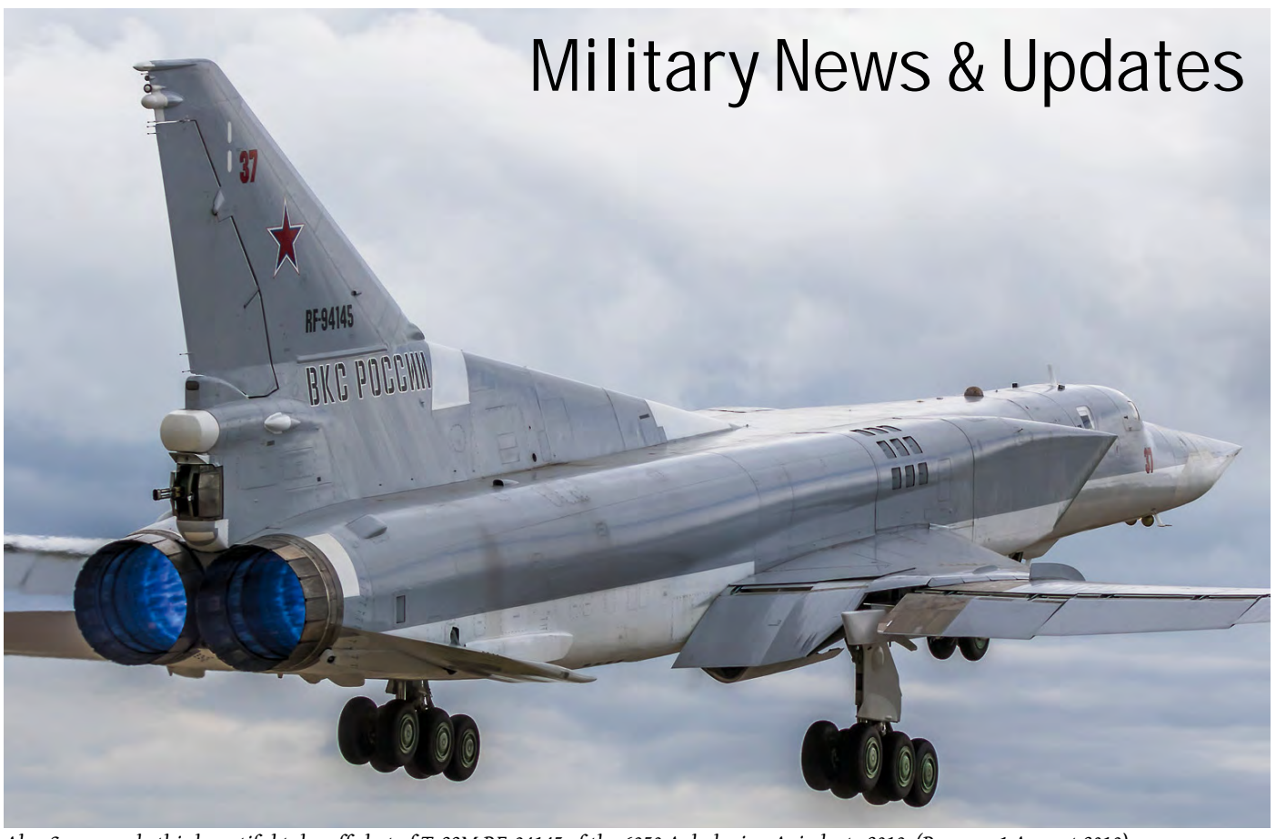
Alex Snow made this beautiful take-off shot of T-22M RF-94145 of the 6950 Avb during Aviadarts 2019. (Ryazan, 1 August 2019)

Because of our standardization we sometimes use type, unit and serial presentations that may strongly differ from those used by the manufacturer or user. It is therefore possible that the information sent by you can deviate from the information we publish.