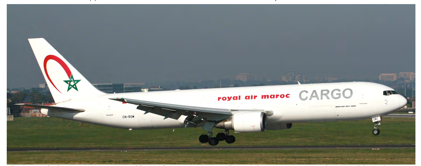
This former Alitalia Boeing 767 was acquired by Royal Air Maroc in 2009 and operated passenger service until it was withdrawn from use in 2017. At that time the carrier made an agreement with the Boeing to convert the 767 into a freighter. CN-ROW was re-delivered on 15 April 2018 after conversion. (Brussels, 2 September 2018,)