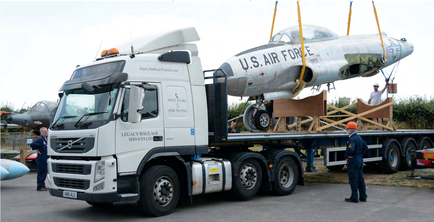
Illustrating last months update, French T-33A 19252 seen being loaded on a transporter at Tangmere for its move to the Cold War Museum at Bentwaters. (11 July 2018, Raymond van Dijkhuizen)

UH-1H HU.10B-76/ET-246 is one of the instructional Hueys at the Academia de Logística at Calatayud, Spain. (15 October 2018, Phil Adkin)