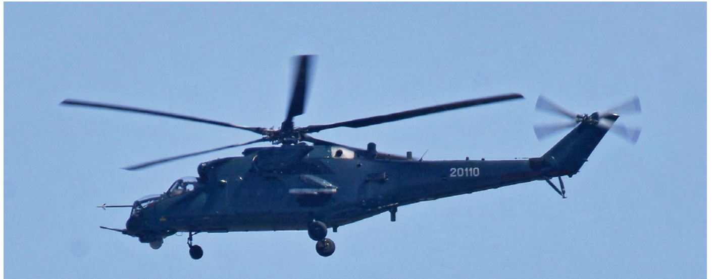
No less than 24 Mi-35M were delivered to the army, although some were later seen operating with the air force too. The DSX examples are very dark green with white serials, like this 20110 seen over Baku.