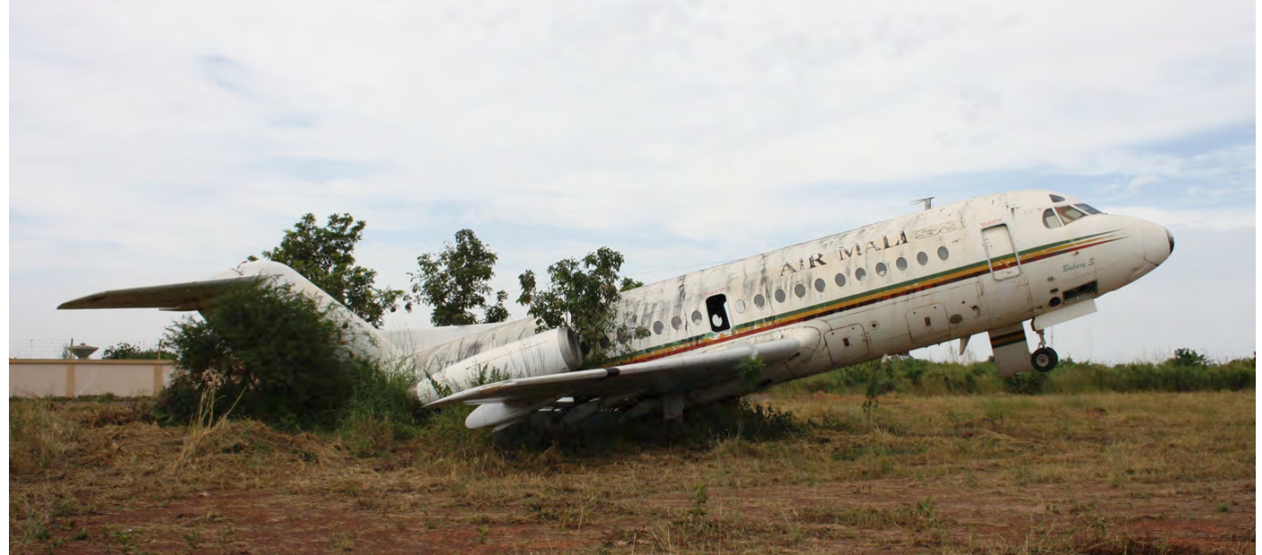
After a long life this 51 year old Fokker 28 Fellowship has found its resting place at Bamako. In its life it had operated for a lot of airlines all over the world, before it ended up with Air Mali and was registerd as TZ-ASH in 1998. Air Mali ceased operations on 7 April 2003 and the aircraft was parked at Bamako-Senou International and looking at this picture it is obvious the aircraft has never moved since that day. (30 September 2018,)