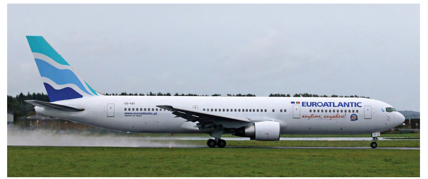
EuroAtlantic recently purchased three ex Hainan Airlines' Boeing 767-300ERs. Before being added to their fleet the aircraft will get some maintenance at Naples in Italy and Shannon in Ireland. One of these three 767s is this CS-TST registered aircraft which is former B-2490. It is seen here at Shannon in full euro Atlantic livery and already wearing its Portugese registration. It will be delivered to Lisbon in the course of November. (22 September 2018,)