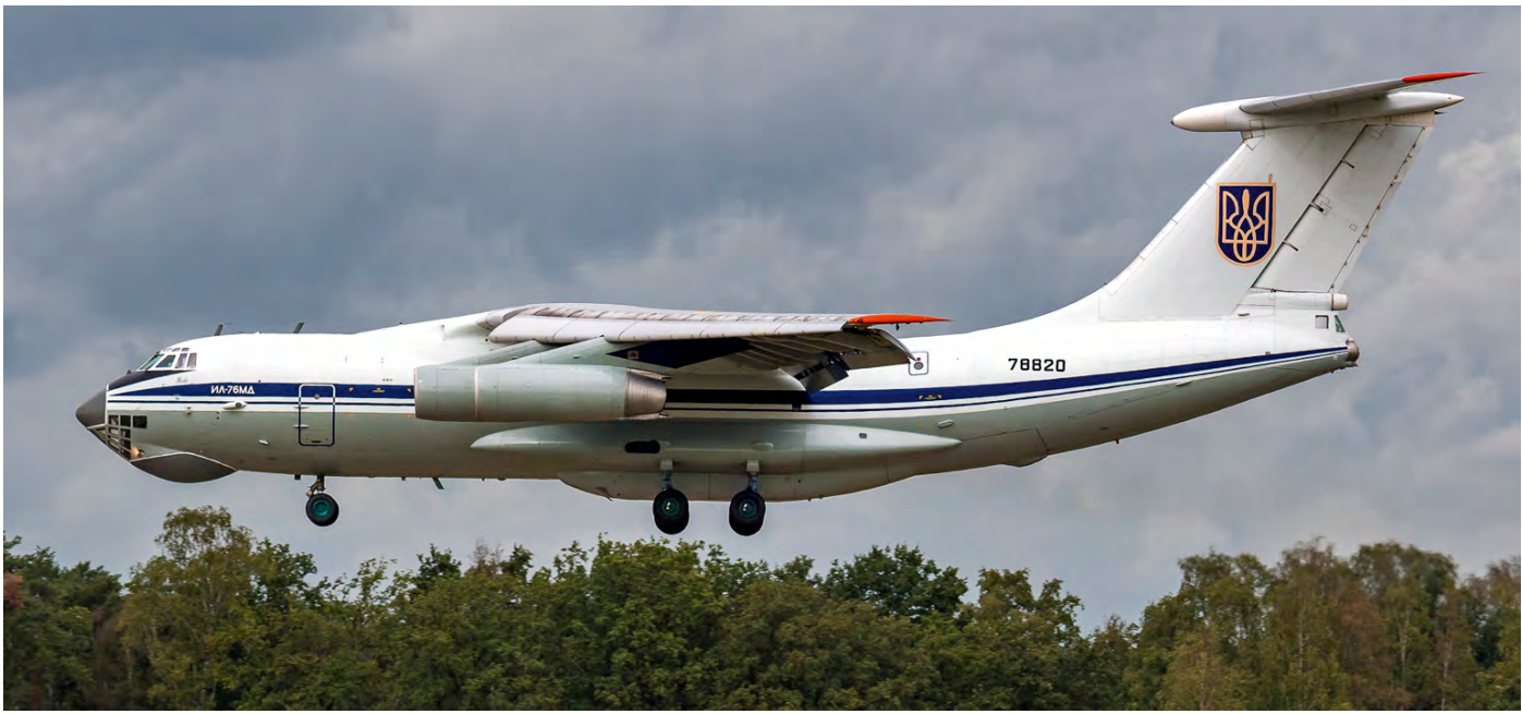
In October 1989 this Ilyushin Il-76MD was delivered to the Soviet Air Force as CCCP-78820. The cargoliner was photographed in the aftermath of the Belgian Air Force Days 2018 while being operated by the Ukraine Air Force with serial 78820. (Kleine Brogel, 10 September 2018)