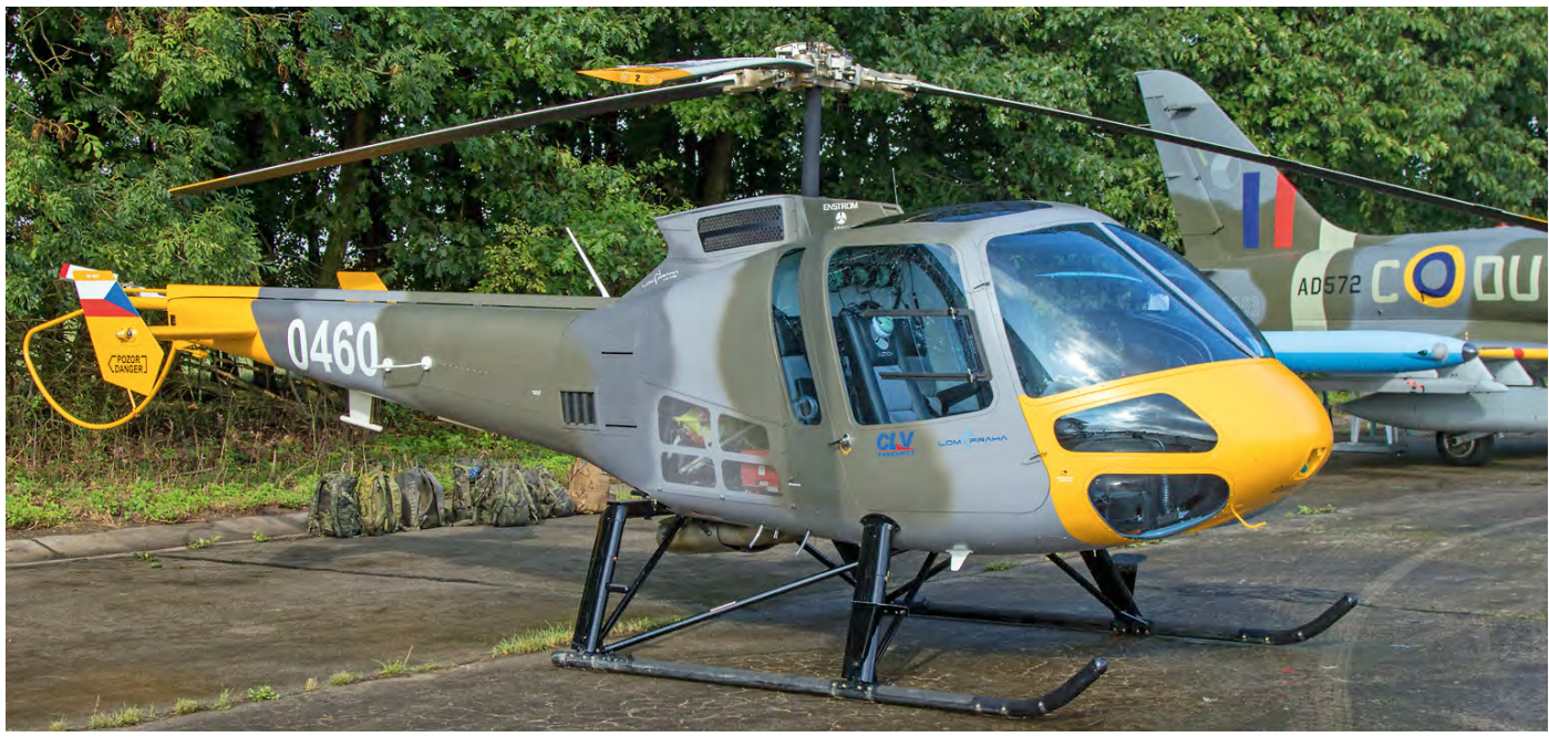
The first of six Enstrom 480B-Gs have been delivered to LOM PRAHA for use at their Flight Training Center (CLV) based at Pardubice, Czechia. The Enstroms are replacing the Mi-2s which CLV had been using for training their pilots since 2004. The 0460 was photographed by Robert Erenstein during the Ostrava NATO days held on 15 September 2018.

764 IAP at Perm-Bolshoye Savino. The third unit of the Division, 2 SAP at Chelyabinsk-Shagol, is currently upgrading from the Su-24 to the Su-34.