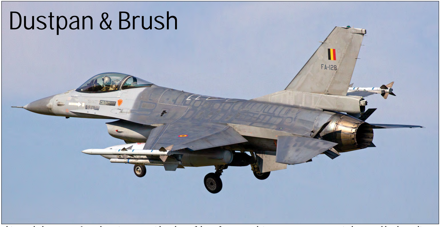
This month the Dustpan & Brush section opens with a photo of the unfortunate Belgian F-16AM FA128. Extensively covered by the media was the loss of this Falcon as a result of 'friendly fire'. It is seen here, still in all its glory, while on approach to Leeuwarden AB on 28 March 2017. (Dino van Doorn)