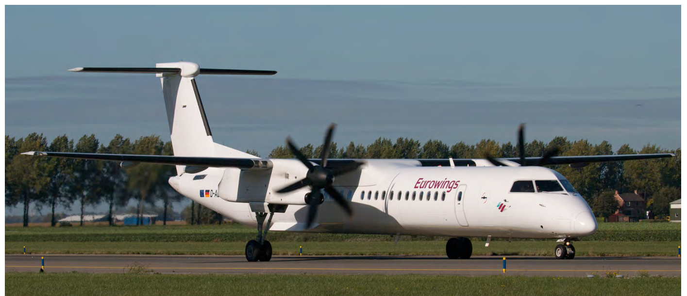
Delivered to Jeju Air in 2006 this DHC-8-400 was added to the fleet of Luftfahrtgesellschaft Walter and operated on behalf of Air Berlin in 2014. It is currently being operated for Eurowings in these stunning colours. (Amsterdam - Schiphol, 26 September 2018)