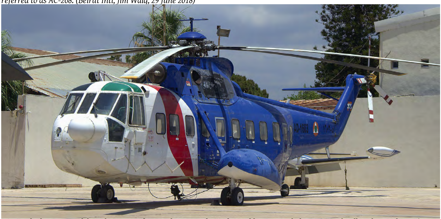
Strange looking asset of the Lebanese air force is this S-61N formerly used by Bristow helicopters and still in those colours. (Beirut Intl, Jim Walg, 29 June 2018)

Lebanon operates three Ce208s from Beirut International airport. They are equipped with sensors and can be armed, hence they are referred to as AC-208. (Beirut Intl, Jim Walq, 29 June 2018)