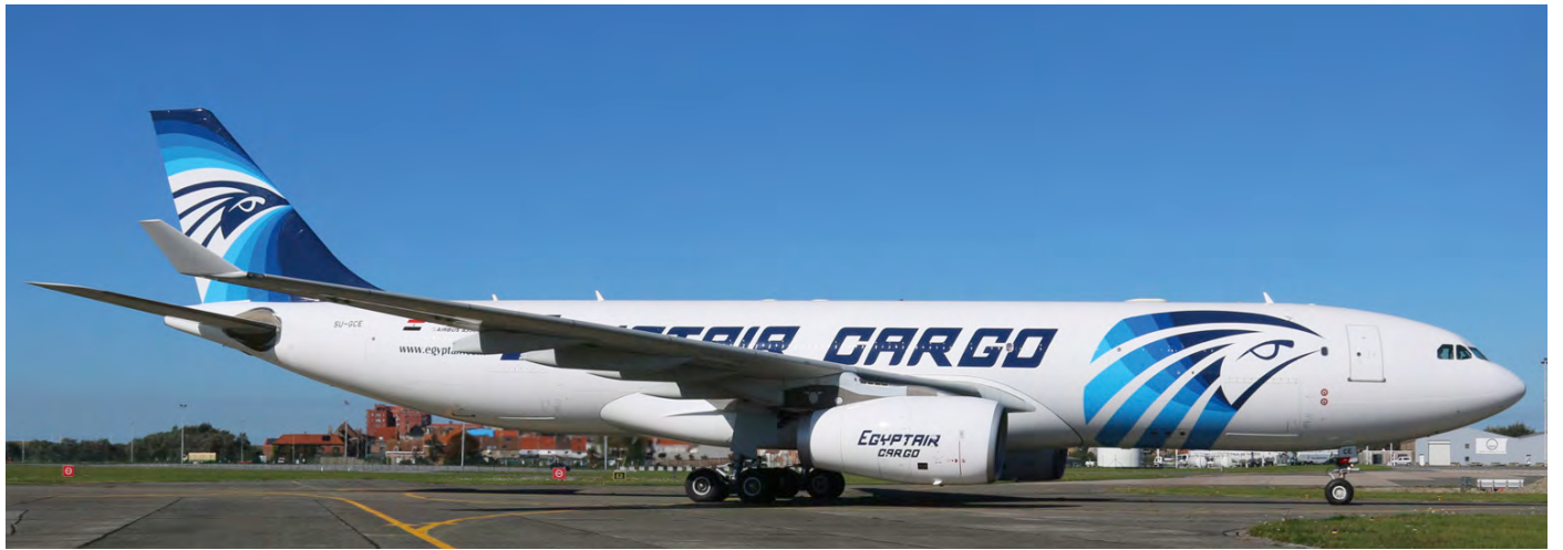
Airbus SU-GCE was delivered to EgyptAir as a passenger aircraft in 2004. Previously using the Airbus A300-600F for cargo flights the airline signed an agreement in December 2014 for the conversion of two A330-200s plus two options. SU-GCE was re-delivered to EgyptAir as A330-200(F) on 4 August 2018. Nik Deblauwe photographed the aircraft on its first visit to Ostend on 27 September 2018.