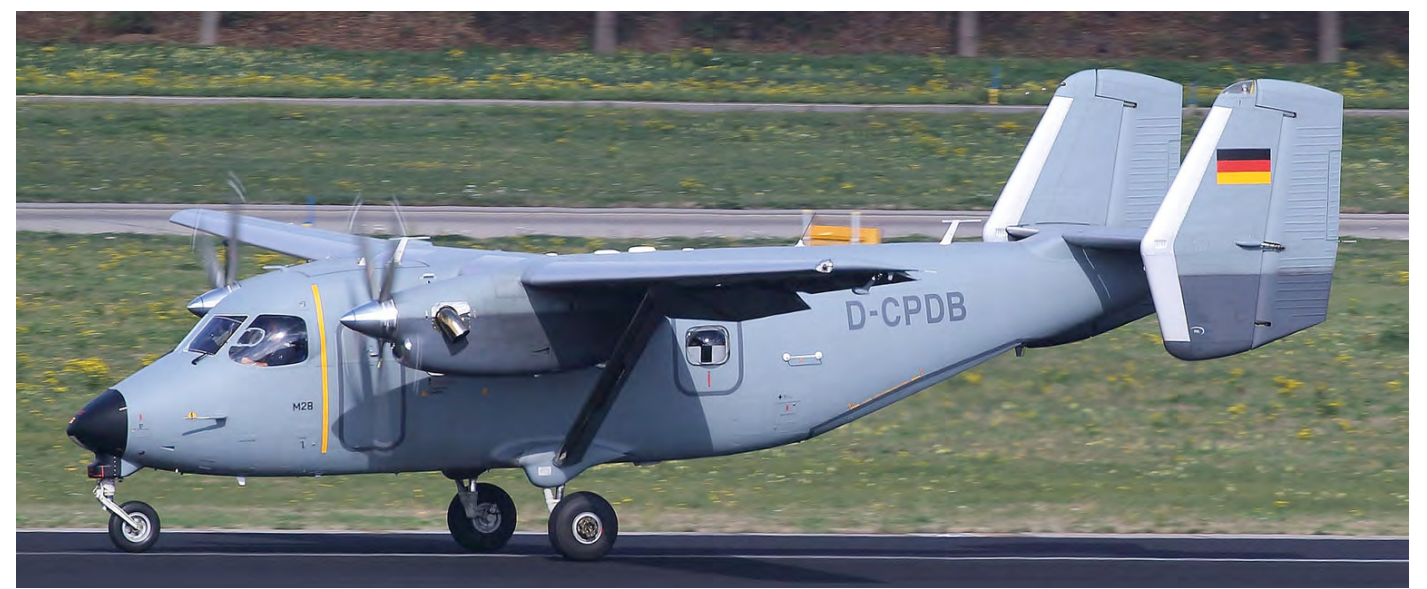
This M28 was constructed in 2015 and began flying for PD Air in 2017. In that same year the German Air Force revealed a lease deal for two M28 Skytrucks. Both are being used as a specialist paratroop training capability in Altenstadt. (Eindhoven, 19 September 2018, Michiel van Herten)