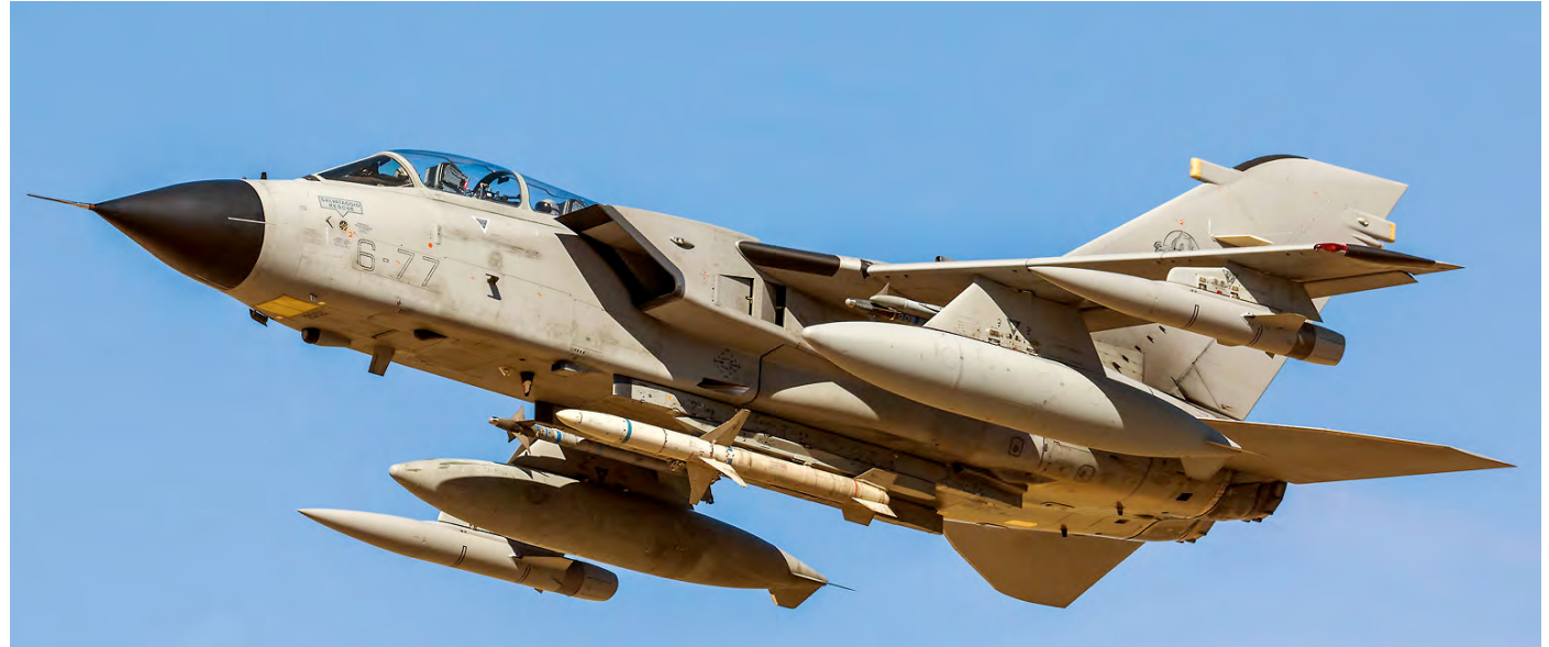
TLP18-3 saw Italian Tornadoes deployed to Albacete. Taking off here is Tornado ECR, no guns, MM7020/6-77, from 155°Gruppo. (28 September 2018,)