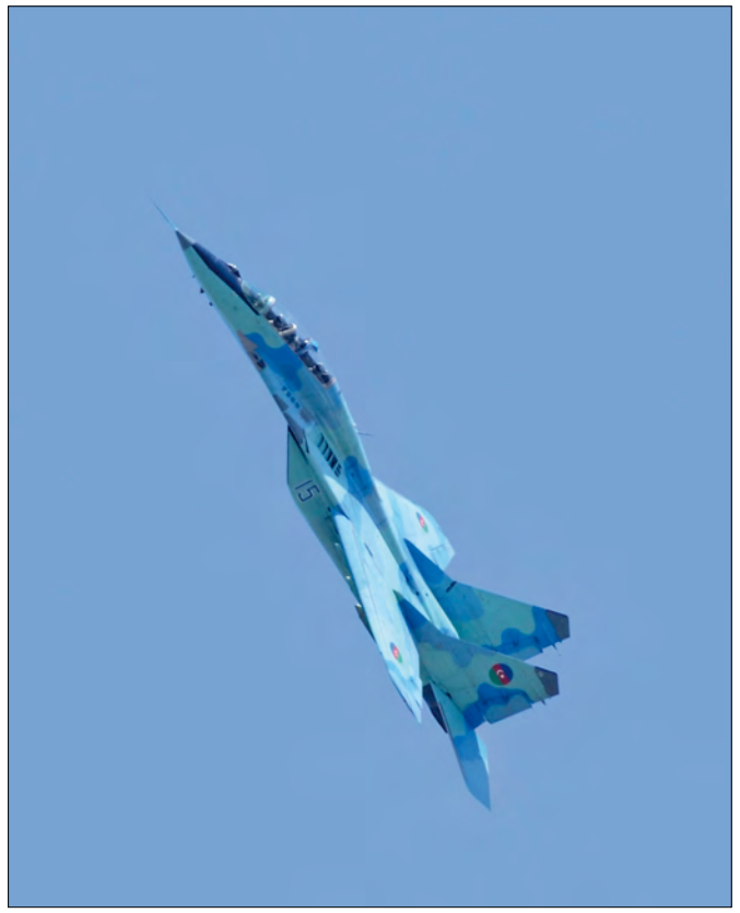
One of the HHQ's three "MiQ-29UB" performing aerobatics over Baku during the yearly Armed Forces Day.