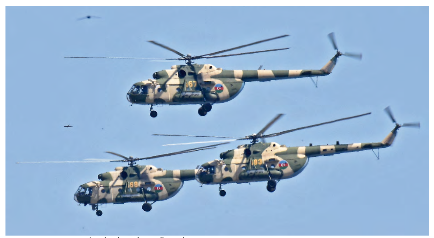
Air Force Mi-17s are camouflaged and most have yellow codes.