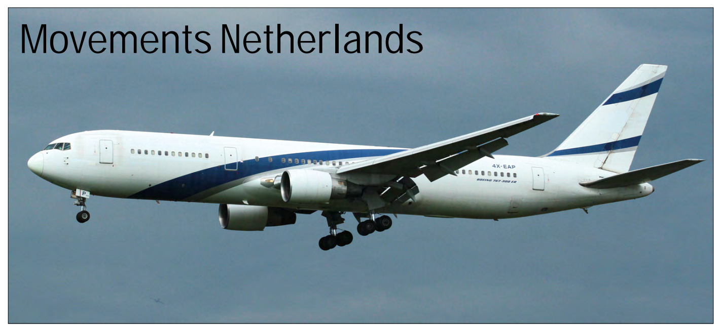
The final commercial flight for Boeing 767 4X-EAR took the aircraft to Amsterdam with the El Al titles and logo already removed, just before it was sent to the US for scrapping after 23 years of service for various airlines. (Amsterdam - Schiphol, 14 September 2018)