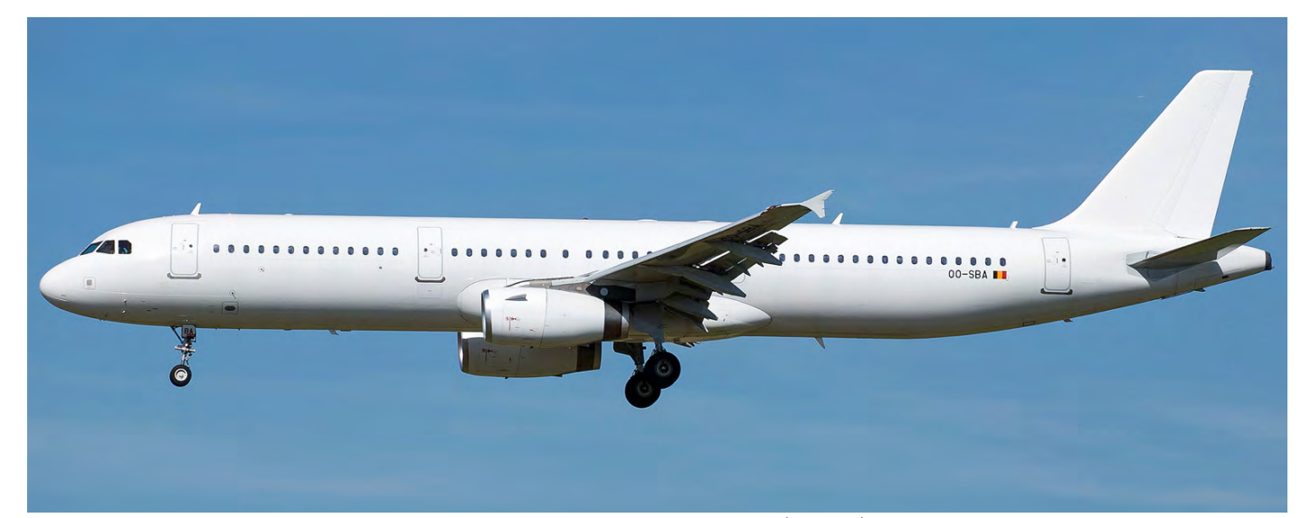
Delivered to Royal Jordanian in 2006 this Airbus A321 was acquired by VLM Airlines (Brussels) in July 2018. A company with the same trading name went into liquidation but this has no bearing on this company operating with Airbus A321 OO-SBA, most of the time using the ICAO code TCW and formerly known as Thomas Cook Airlines Belgium. (Brussels, 11 September 2018,)