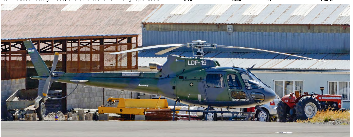
The Lesotho Defence Force Air Wing received the H125 LDF-19 as a replacement for the EC135 which crashed in April 2017. Helicopters of the LDF are traditionally always named after a mountain in Lesotho. This one is named Thaba Putsoa, which means Blue Mountain. (Maseru, 15 September 2018, Erwin van Dijkman)