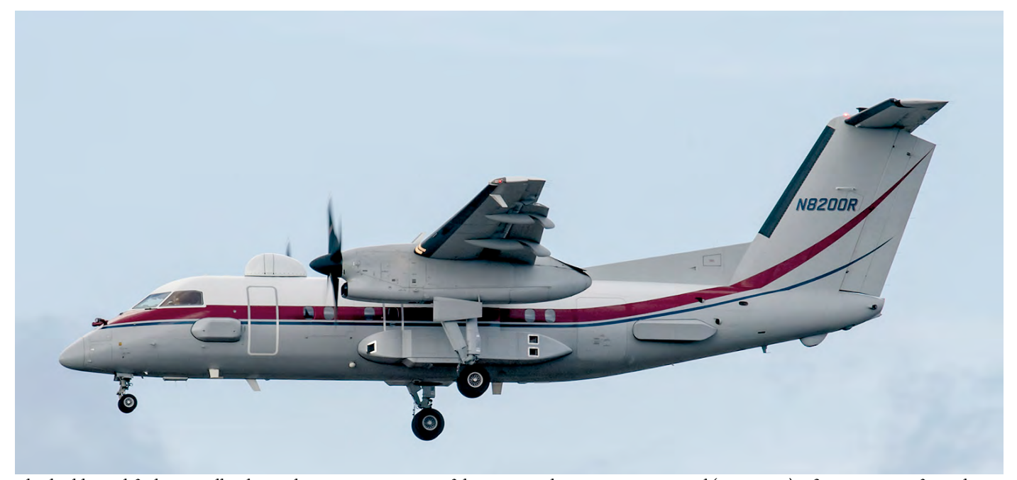
This highly modified De Havilland Canada DHC-8-200 N8200R of the US Special Operations Command (USSOCOM) is flying missions from Chania Ioannis Daskalogiannis (formerly known as Souda) to the southern areas of the Mediterranean Sea. (11 September 2018,)