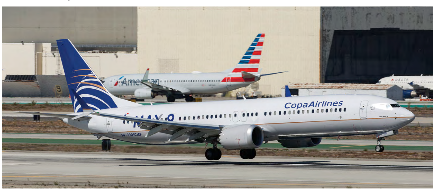
Copa Airlines is one of the first operators of the 737 Max 9. In total they have ordered thirteen 737 Max 9s, of which HP-9901CMP was the first aircraft delivered to the airline on 31 August 2018. It is seen here landing at Los Angeles-International (CA) on 15 October 2018.

<u>Kuwait Airways</u> has announced that they will change their orders it has with Airbus. The order is part of the airline's fleet renewal programme. Kuwait Airways are also planning to replace all their leased aircraft. Currently the airline leases four of their ten B777-300ERs, seven of their eleven A320s and five A330-200s. In December 2013 Kuwait Airways ordered ten A350-900s and fifteen A320neos and will now change that