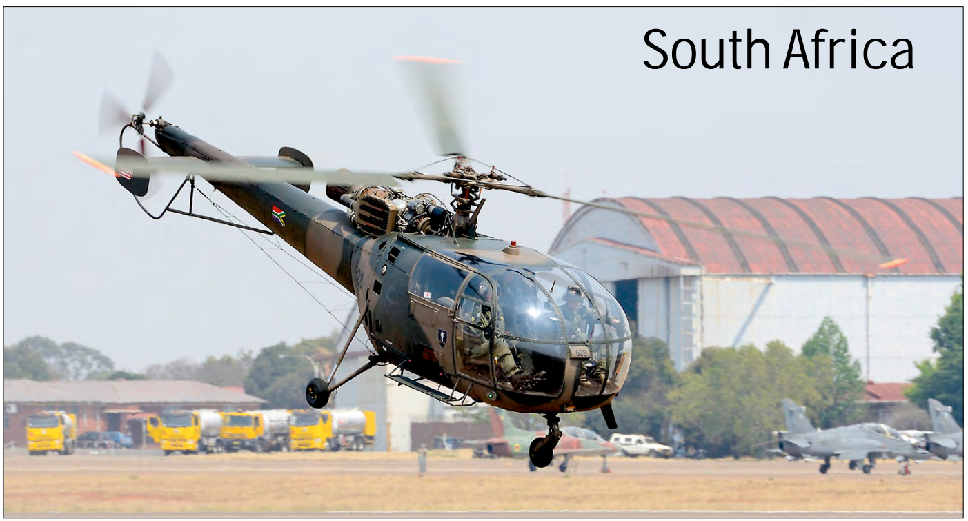
SAAF museum keeps a Historic Flight and this Alouette 3 628 was part of their 'mini-war' demonstration during AAD2018 at AFB Waterkloof. (AFB Waterkloof, 22 September 2018, Erwin van Dijkman)