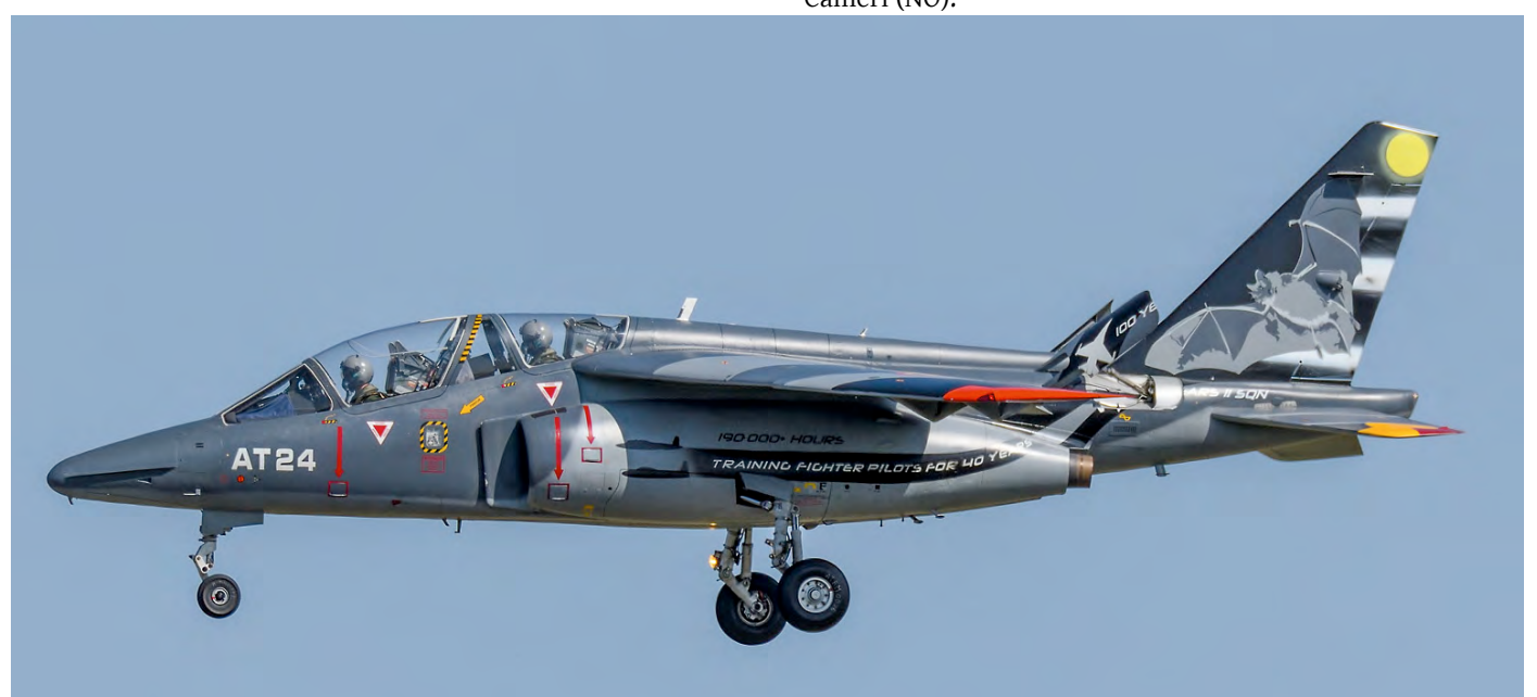
To celebrate the 100th anniversary of 11 Squadron of the Belgian Air Component, the unit gave the Alpha Jet AT24 a special colour scheme. The squadron operates the Alpha Jet since December 1978, so forty years with over 190.000 flight hours. (Orange-Caritat, 25 September 2018,)

MM7452/- FACO Cameri new BL-2 oct18 On 15 October 2018, F-35B MM7452 made its first flight at Cameri (NO).