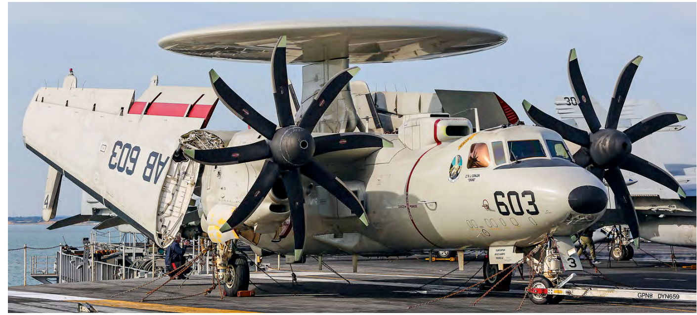
With its eight-bladed propellers in evidence, E-2D 168594/AB-603 from VAW-126 'Seahawks' enjoys the bleak sun. (onboard CVN-75, 7 October 2018)