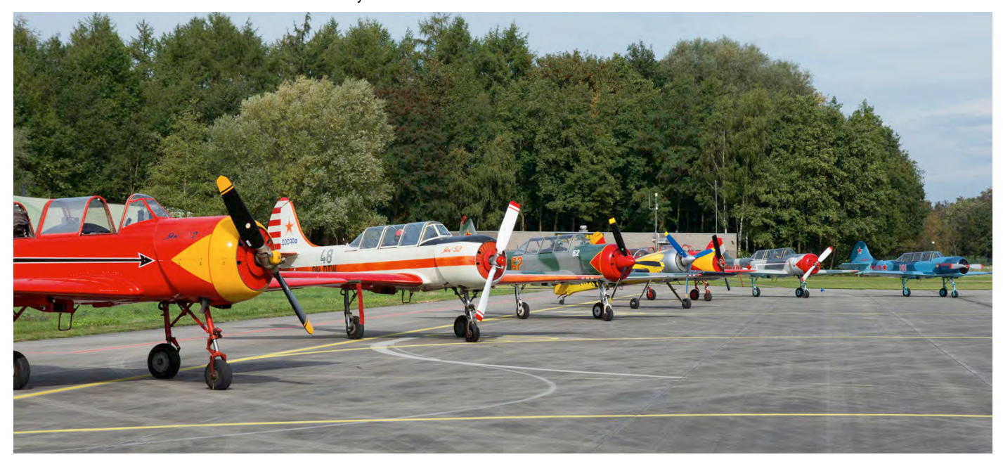
Remco de Wit took this photo while attending the airshow during the Technology Base open day. A line up of six Yak-52 aircraft (and one Sukoi 29) is something you do not see every day in The Netherlands. (Twente, 16 September 2018)