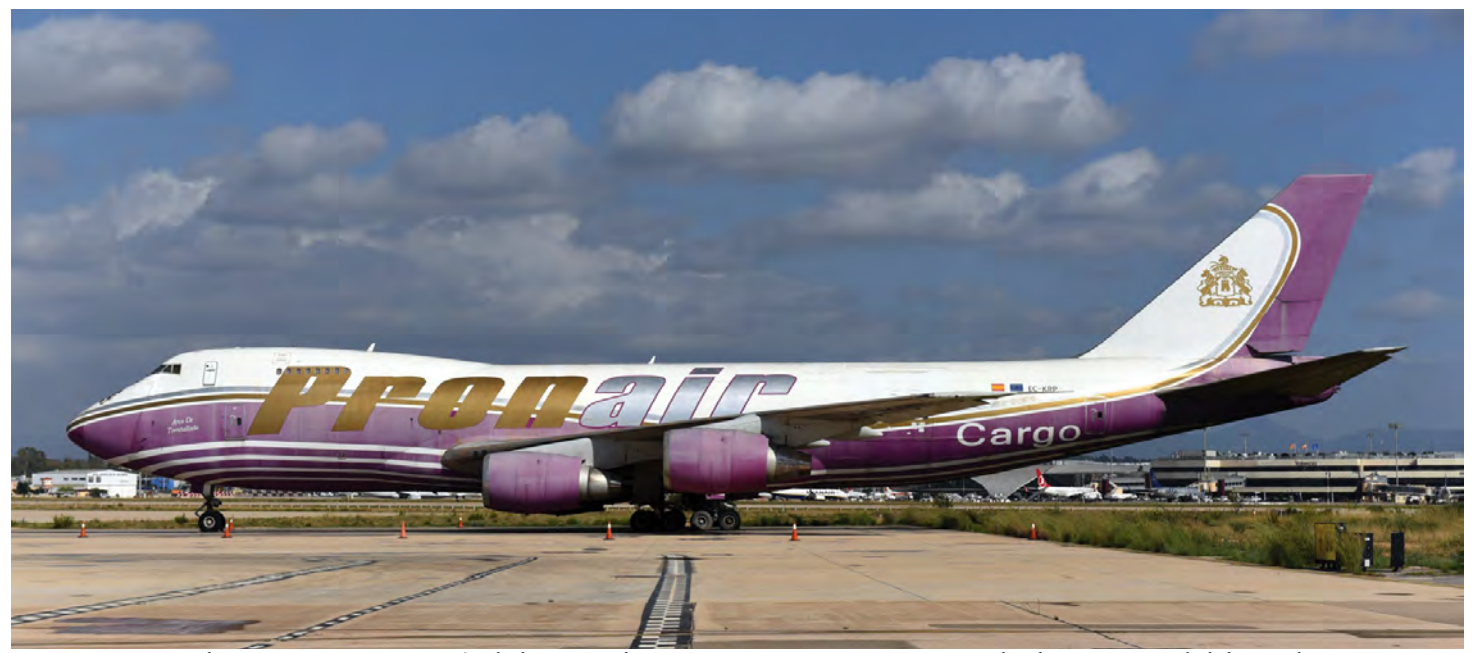
Since 2010, at Valencia, Spain you can find this stored Pronair B747-200F. EC-KRP was built in 1974 and delivered as N701SW to Seaboard World Airlines. After flying with SWA it was owned by four other operators. (27 September 2018)