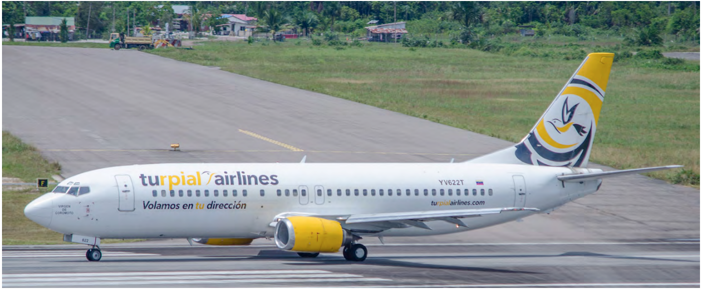
Delivered to Malaysia Airlines in 1994 this Boeing 737 was added to the fleet of Turpial Airlines in 2017. YV622T is the third aircraft that was added to the fleet. The airline is officially based at Valencia, Venezuela. (Paramaribo, 2 September 2018, Faragh Djoemai)