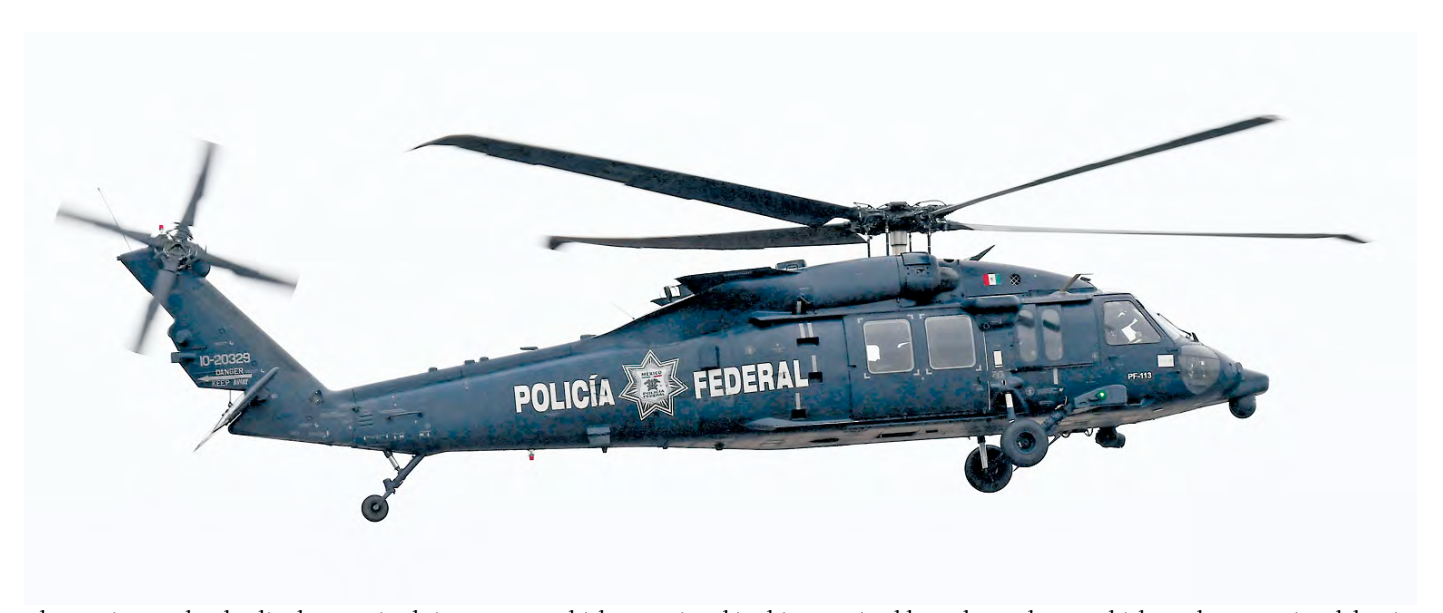
The Mexican Federal Police has received six UH-60Ms which are painted in this stunning blue colour scheme, which can be appreciated despite the rare gloomy weather encountered at Yuma (AZ). UH-60M PF-113, FMS serial 10-20329