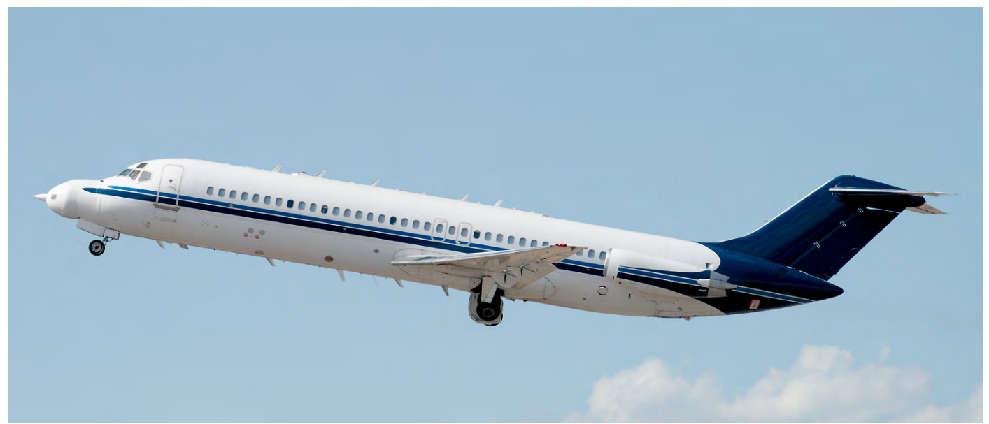
To read the BuNo (168277) of this shadowy testbed NC-9D you need very good eyes, it is located at the end of the tail section very small just above the cheatline. The aircraft belongs the Naval Air Weapons Station China Lake. (Tucson International (AZ), 24 September 2018, Ton van Bakel)

The US Navy announced plans to stop C-2A Greyhound operations already in 2024 instead of 2027. As known, the C-2A will be replaced by the CMV-22B Osprey tiltrotor as a Carrier Onboard Delivery aircraft. Due to a lot of similarities between the MV-22B and CMV-22B, the test programme can be further scaled down than initially thought. It is now planned that the first CMV-22B will be delivered in FY20 (which runs from 1 October 2019 to 30 September 2020) with first fleet deliveries in 2021. As earlier reported on Scramble Facebook News (SFN), in June 2018, the Naval Air Systems Command (NASC) awarded Boeing a contract to build the final Marine MV-22s as well as the first 39 CMV-22s. The US Navy already started crew training with VMMT-204 Raptors ('GX-') at MCAS New River (NC). The Philadelphia build aircraft will be delivered to the modified tiltrotor test programme at NAS Patuxent