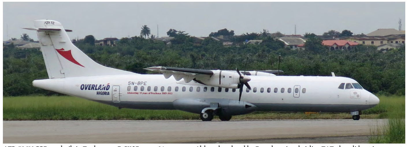
ATR-72 5N-BPE was built in Toulouse as F-GKOE, some 26 years ago. Although ordered by French regional airline TAT, they did not incorporate the ATR in its fleet, but it was leased to Air Gabon instead. Next lessors were Vietnam Airlines, Lao Airlines and Azul Linhas Aéreas Brasileiras. Since 2012, Overland Airways flew the ATR as 5N-BPE. But this company is where the story ends. (Lagos, 23 September 2013, Clive Hindmarch)

placed by 1,150 metres due to reconstruction, but the Russian built aircraft actually landed on runway 23L (the opposite runway). Preliminary information suggests the aircraft ran off the runway onto the area that was under reconstruction. Onboard were 87 passengers and five crew, and the Sukhoi could not stop ahead of the (displaced) runway end and went over an edge, causing the main gear to collapse. The aircraft came to a stop on the engines and tail on the closed section of the runway.