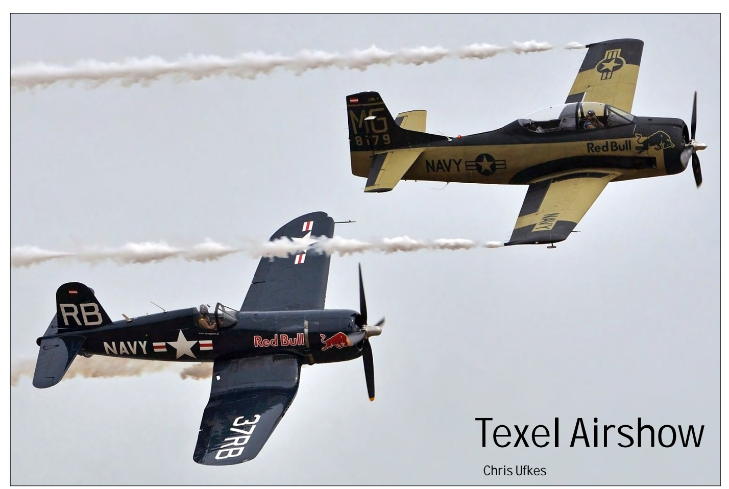
The Flying Bulls gave a flying display using Corsair OE-EAS and Trojan OE-ESA. The F4U-4 was delivered to the US Navy in 1945, but it did not see action. The T-28B was built in 1954 and used as a training aircraft by the US Navy in Washington until 1965. It has been completely restored for the past few years. In the summer of 2016 the aircraft was repainted. (Texel, 4 August 2018, Jaap Niemeijer)