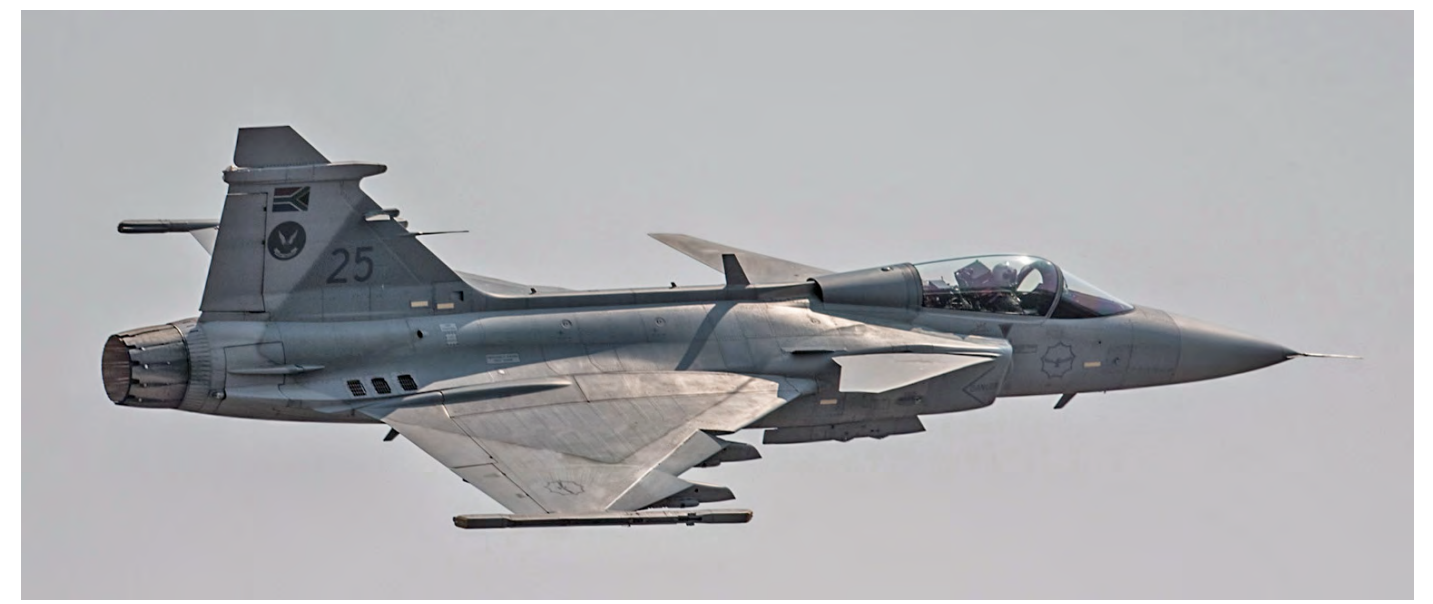
No less than seven JAS-39 Gripens were present at AAD2018. Six flew an opening formation with a couple of Hawks, two others went chasing for a single Hawk and of course there was also a solo display. (AFB Waterkloof, 22 September 2018)

128 SA330C stored Denel After this I headed to Waterkloof for the show and then onto Wonderboom. Again just my passport and destination was sufficient to gain access to the airfield. The hangar number that holds the Zimbabwean Dakotas was revealed to me by a travel companion (thanks Harry!) so my visit here was rather short and surgical.