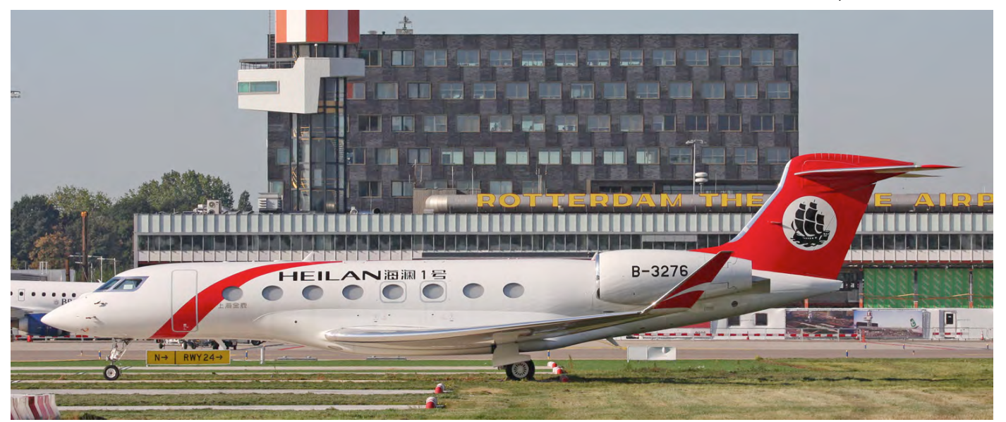
Deer Jet Shanghai took delivery of this Gulfstream G650ER in September 2017. B-3276 is being operated for the Heilan Group, a menswear manufacturer. (Rotterdam - The Hague, 26 September 2018,)