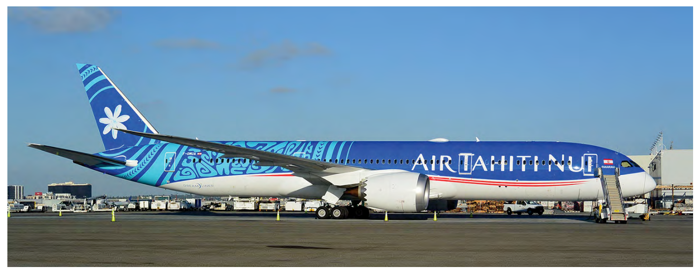
On 9 October 2018, Air Thaiti recieved the first of four ordered Boeing 787-9s. The aircraft wears registration F-OMUA and is named Fakarava. The second Dreamliner is scheduled to be delivered to the airline in December. The remaining two will be delivered in the first half of 2019. Air Tahiti Nui chose the General Electric GEnx engine, to power their dreamliners. The aircraft will be equipped with 294 seats across three classes: 30 business, 32 premium economy, and 232 in economy. The aircraft will operate to destinations such as Auckland, Los Angeles, Paris, and Tokyo and will replace the five Airbus A340-300s, currently in service with the airline. (Los Angeles-International (CA), 9 October 2018, Walter Heukensfeld)