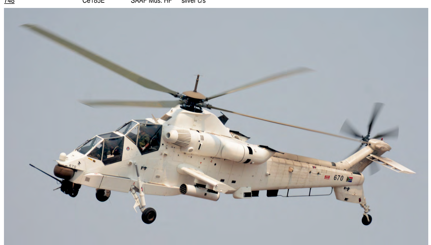
South Africa regularly deploys its Rooivalks to the Democratic Republic of Congo under the flag of UN's MONUSCO mission. Hence the white colour scheme of 670 that was at the show with camouflaged sister ship 677 that was on the static. (21 September 2018)

40V01 AM-3C ex Rwanda, dismantled 941 AM-3C Bosbok dismantled 2022