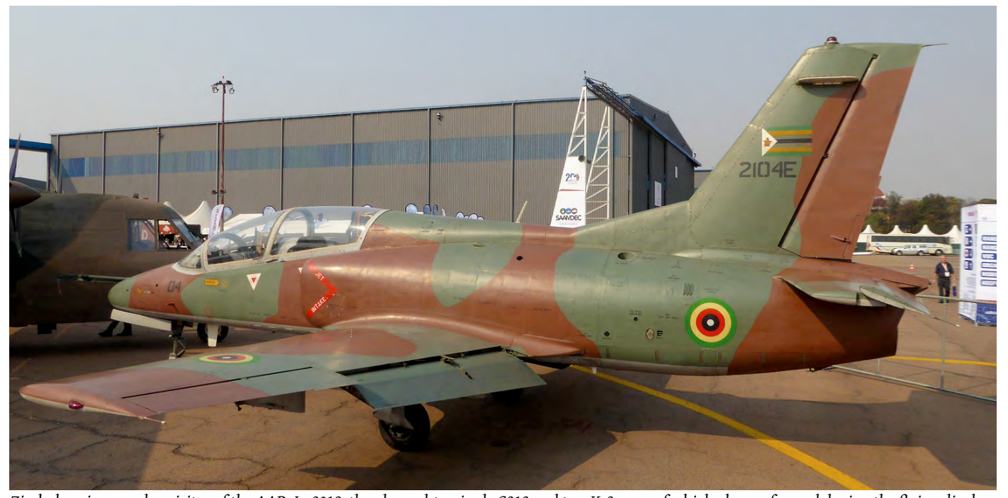
Zimbabwe is a regular visitor of the AAD. In 2018, they brought a single C212 and two K-8s, one of which also performed during the flying display. This 2104E was on the static, that was a bit difficult tho graph. (AFB Waterkloof, 20 September 2018)

Sunday 23 September was our last day and we had the option to go back again to Waterkloof for the air show or try to find some more wrecks and relics around Pretoria and Johannesburg. We chose the last option and first we drove to Kromdraai followed by the area of Wonderboom. After this very nice airfield we drove to Johannesburg to visit Lanseria and