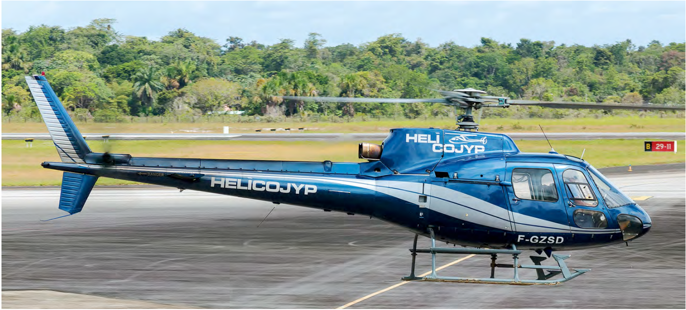
Heli-Cojyp is a Machdeal subsidiary and located in Cayenne, French Guyana. The company is operating since December 2003. In December 2017 they obtained their AOC. They currently operate 3 AS350 helicopters. AS350B1 F-GZSD was registered to the company in 2017 and caught on camera while dropping off some passengers for a connecting flight to Guyana. (Paramaribo, 23 July 2018,)