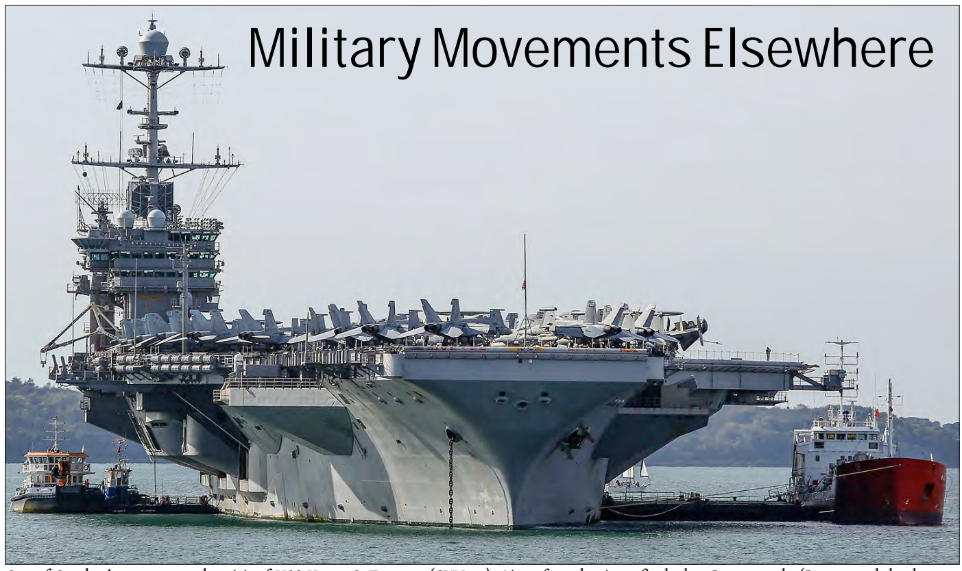
One of October's treats was the visit of USS Harry S. Truman (CVN-75). Aircraft enthusiasts flocked to Portsmouth. (Portsmouth harbour, 7 October 2018,)