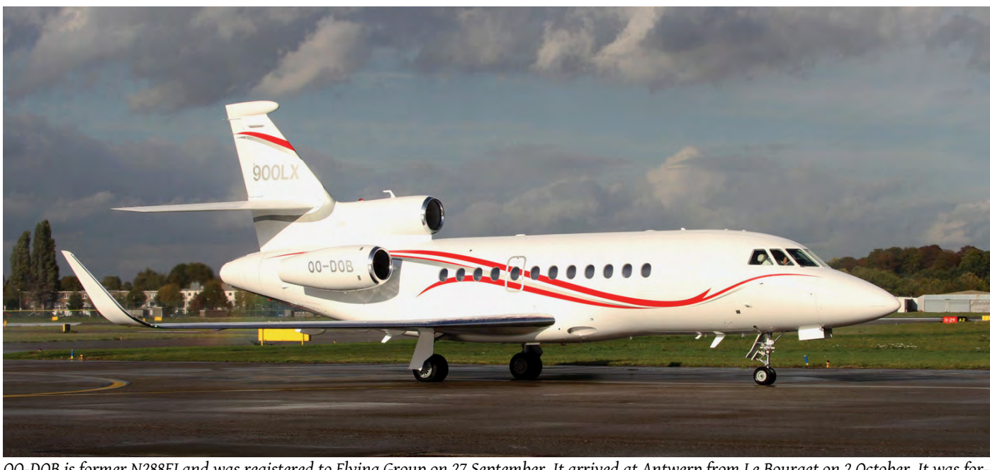
OO-DOB is former N288FJ and was registered to Flying Group on 27 September. It arrived at Antwerp from Le Bourget on 2 October. It was formerly used as a demontrator, hence the colour scheme and 900LX titles on the tail. (Walter Van Brempt)