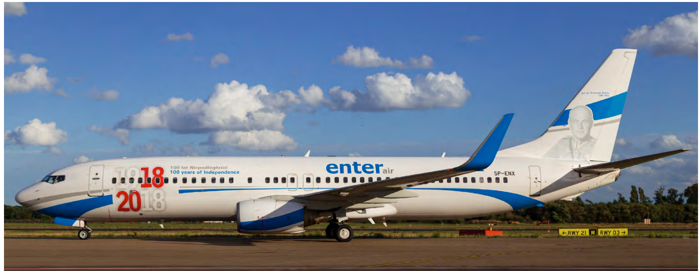
Boeing 737 SP-ENX was added to the Enter Air fleet in 2012. Since June 2018 it has 100 years of Independence stickers on its fuselage. (Maastricht - Aachen, 21 September 2018, Mark Remmel)