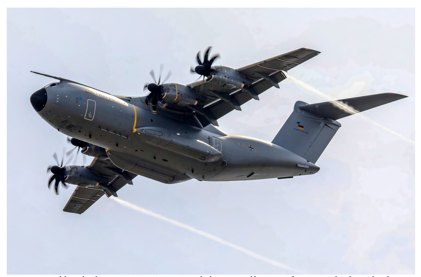
A400M 54+18 was delivered to the German Air Force in June 2018 and is being operated by LTG62. Lufttransportgeschwader 62 is based at Wunstorf Air Base. The first Airbus A400M entered service with Air Transport Wing 62 on 19 December 2014. The last C-160 Transall left Wunstorf in July 2015. 54+18 paid a first visit to the island on the 3rd on a recon flight for the show on the 4th. (Texel, 4 August 2018, Berend Jan Floor)