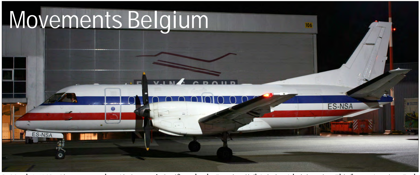
In March 2018 NyxAir was granted an Air Operator's Certificate by the Estonian Civil Aviation Administration. This former American Eagle Saab 340B was added to the fleet in August 2018 as ES-NSA. This aircraft is being used for cargo flights only according to the company. (Antwerp, 27 September 2018,)