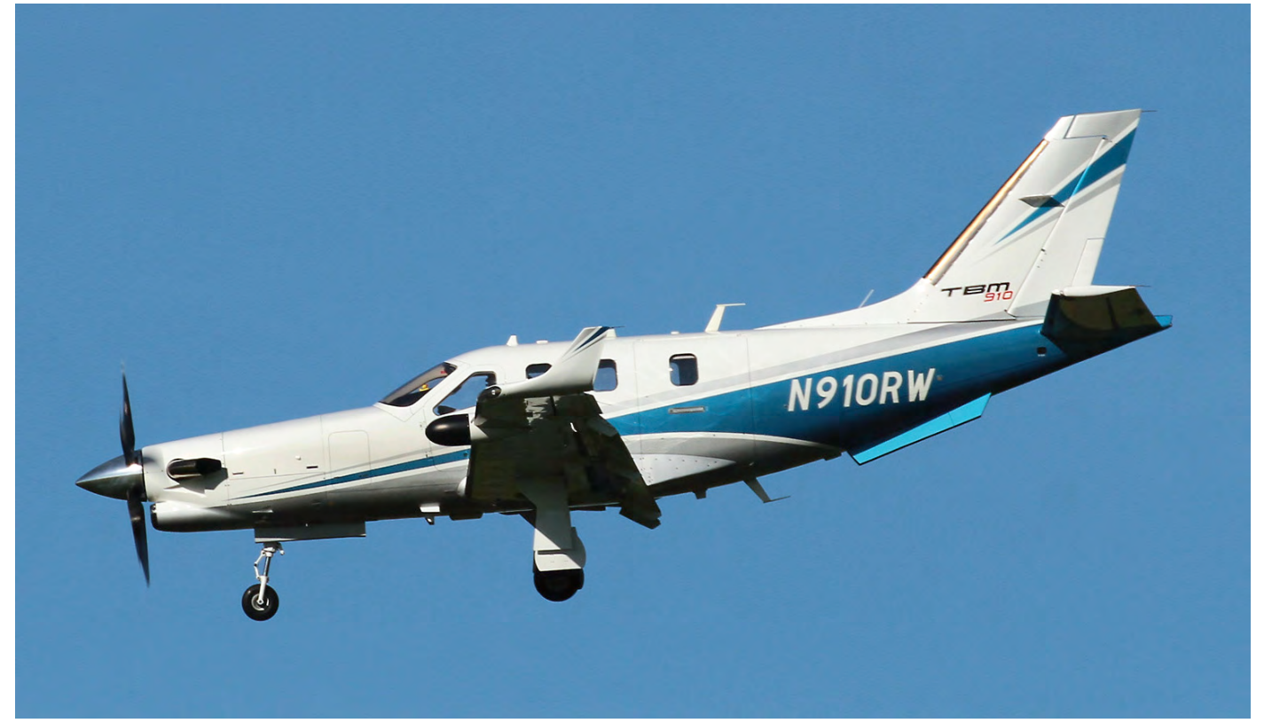
TBM-910 N910RW was registered to Redwood 850 on 1 May 2018, replacing a TBM-900 that was registered as N900FZ. The Redwood TBMs have been very frequent visitors to Schiphol in the last years. (Amsterdam - Schiphol, 25 September 2018)