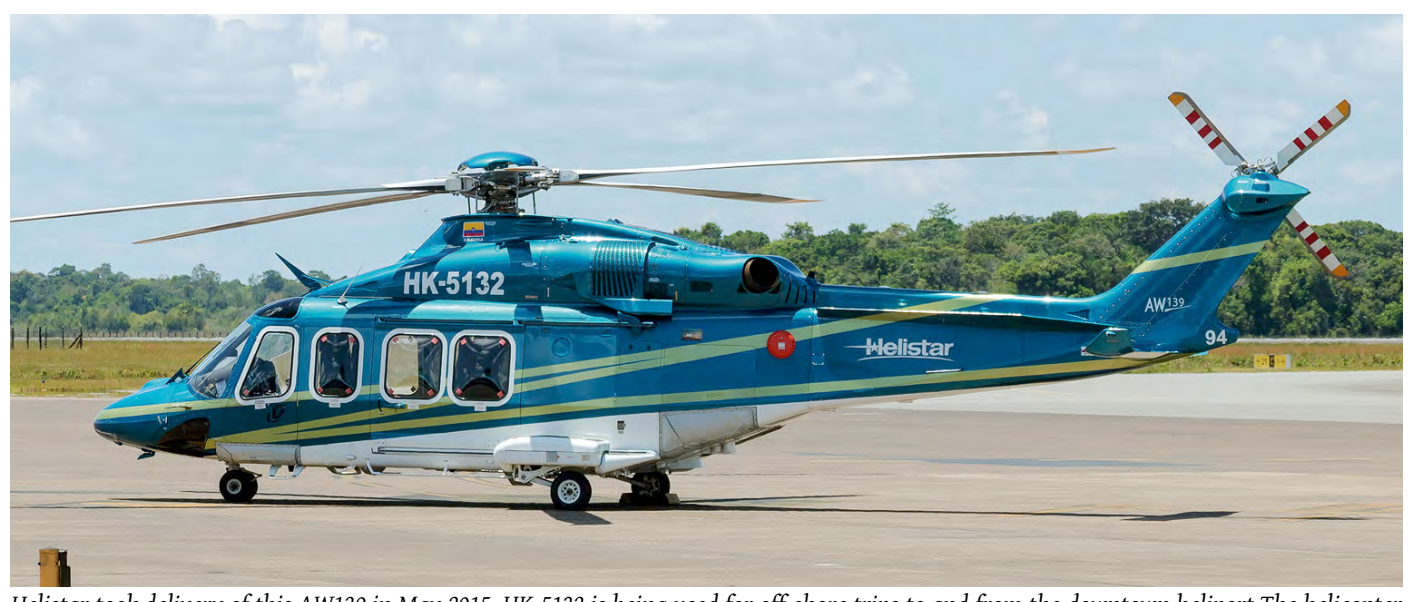
Helistar took delivery of this AW139 in May 2015. HK-5132 is being used for off-shore trips to and from the downtown heliport. The helicopter was caught on camera while it met up with the company Falcon 2000S. (Paramaribo, 16 August 2018,)