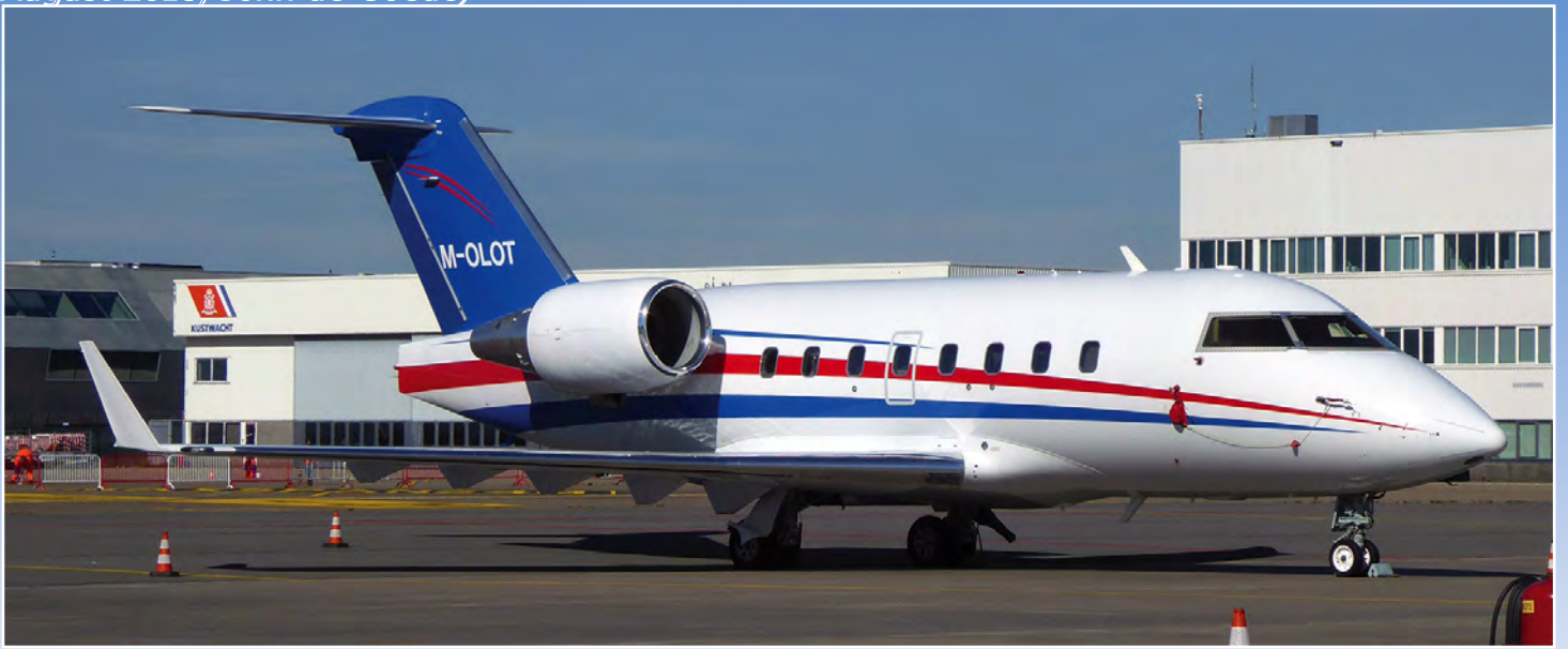
This 1998 built CL-604 was delivered in 2013 to Upalo Trading. They registered this aircraft at the Isle of Man as M-OLOT. (Amsterdam-Schiphol, 26 September 2018,)