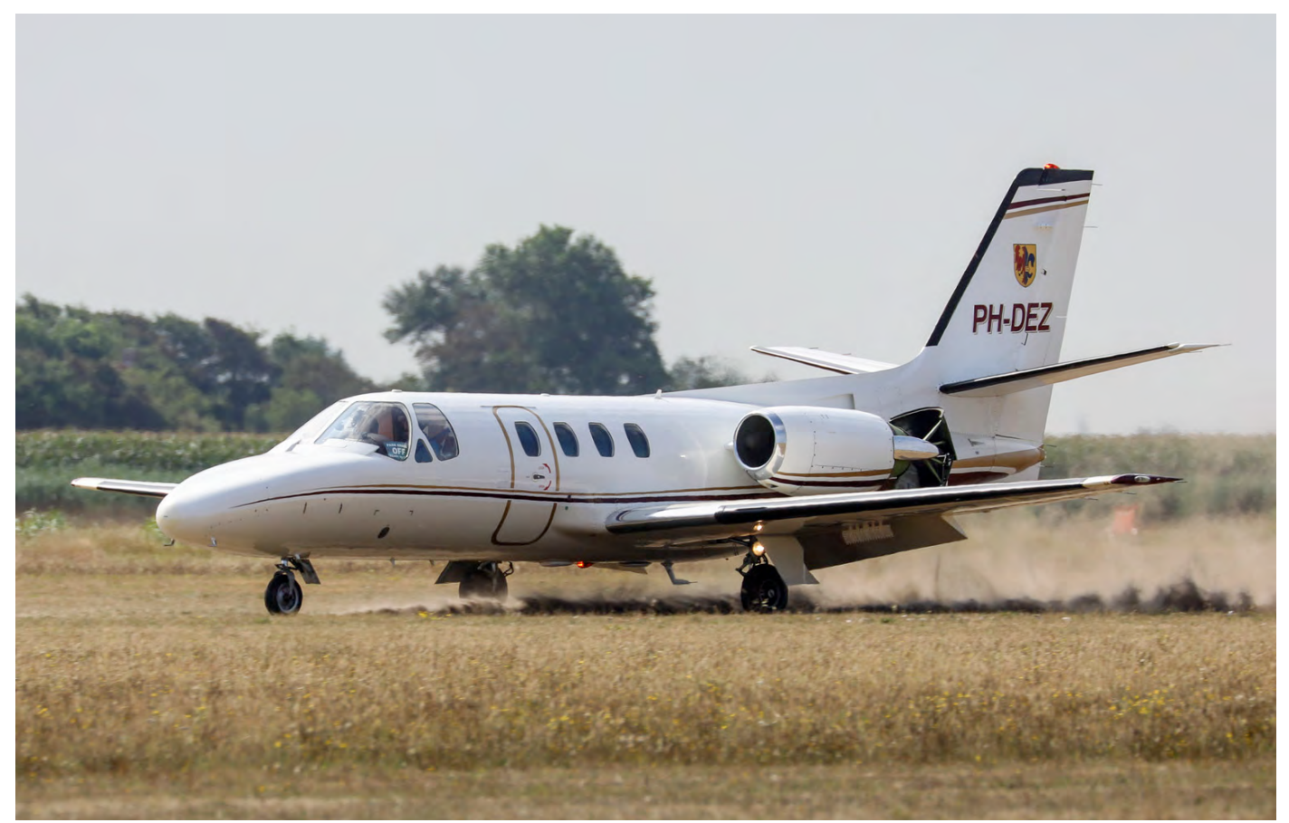
Cessna 501 PH-DEZ is based at Teuge airport but is rarely seen active. The last known operator for this bizjet is Stella Aviation International. Quite a rare sight to see a bizjet landing on a grass runway! (Texel, 4 August 2018, Berend Jan Floor)