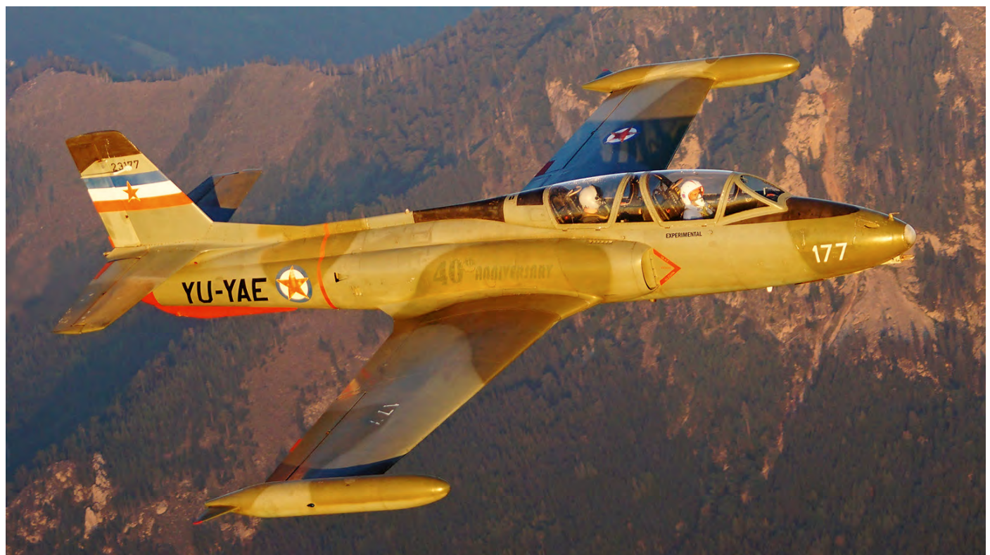
Operated by the Yugoslav Air Force as 23177, this Soko was retired in 2000. Aero Klub Galeb now operates the G-2 as YU-YAE. It previously carried '40th Anniversary' titles which are still vaguely visible.