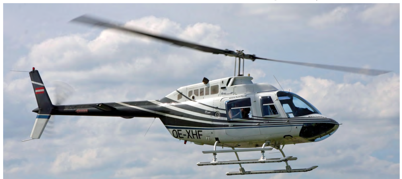
This Jet Ranger was constructed by Bell in 1995 and delivered to Canada, where the helo was flown as C-GFNP. Next operator was MOTORFLUG Baden-Baden GmbH where this Bell 206B-3 was flown as D-HMAS until December 2010. The Jet Ranger then moved to Austria and became OE-XHF. And in this country it is now bound to stay. It is seen here while taking off from its homebase Vöslau on 21 March 2016.

by this Sukhoi Superjet RRJ-95B, suffered a collapse of the main landing gear in a landing accident at Yakutsk Airport, Russia. Yakutsk Airport's runway 05R threshold was dis-