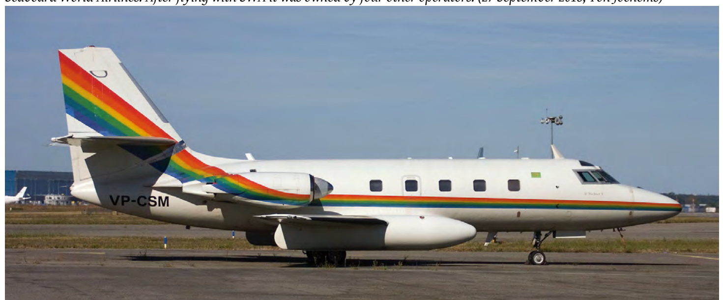
This is a real oldie because Jetstar L-1329 VP-CSM was built in 1966! Since 2015 it is stored at Toulouse and the registration was cancelled in 2016. Despite the long time in storage the livery still look great. (Toulouse-Blagnac, 2 October 2018)