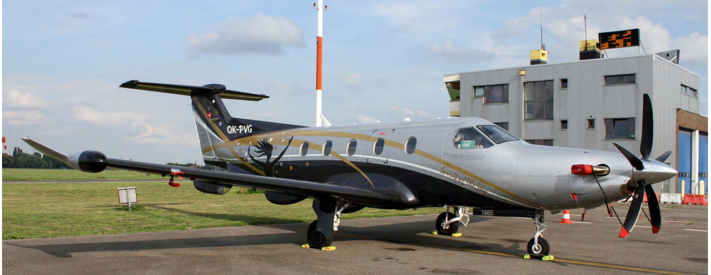
This Pilatus PC-12 was registered in November 2016. OK-PVG is owned and operated by Gumárny Zubří. The company focuses on development and production of technical rubber, thermoplastic and thermoplastic elastomer products. (Antwerp, 15 September 2018,)