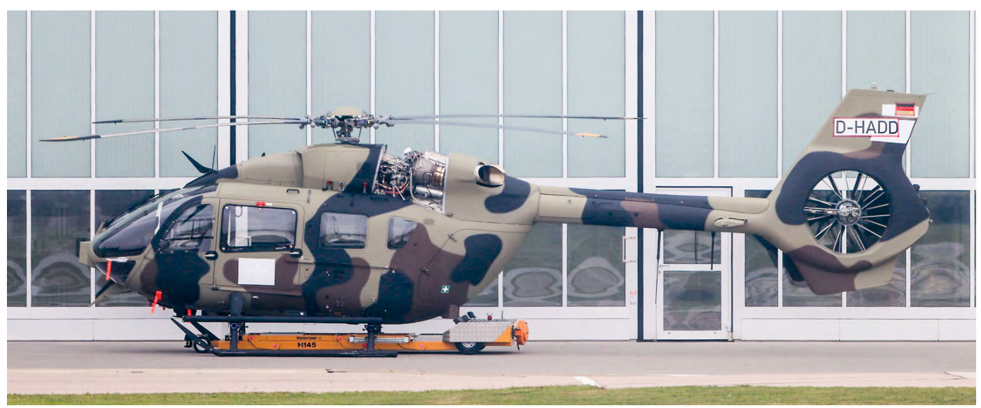
This very nice camouflaged H145M, D-HADD, for the Serbian Air Force and Air Defence was seen outside at the Airbus Helicopters facility in Donauwörth (Germany). The Serbian Government ordered six for Air Force and three for the Ministry of Interior/Police (9 October 2018)