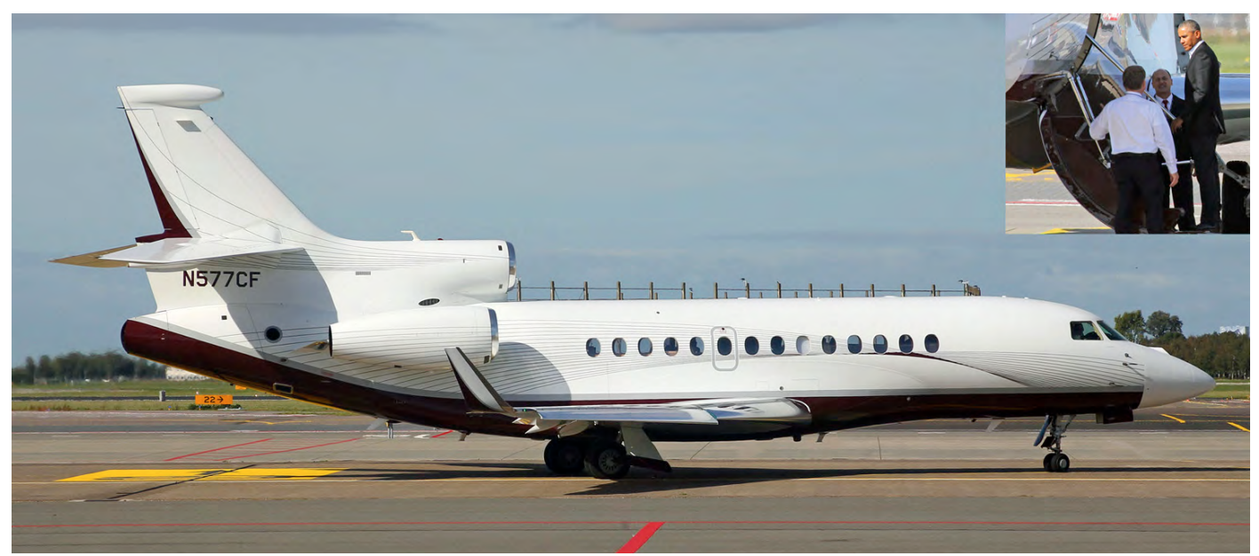
Former president Obama was the main attraction at the Forward Thinking Leadership-seminar in Amsterdam on 28 September 2018. The former leader departed the next day using this Falcon 7X owned by Calamos Asset Management. (Amsterdam - Schiphol, 29 September 2018,)