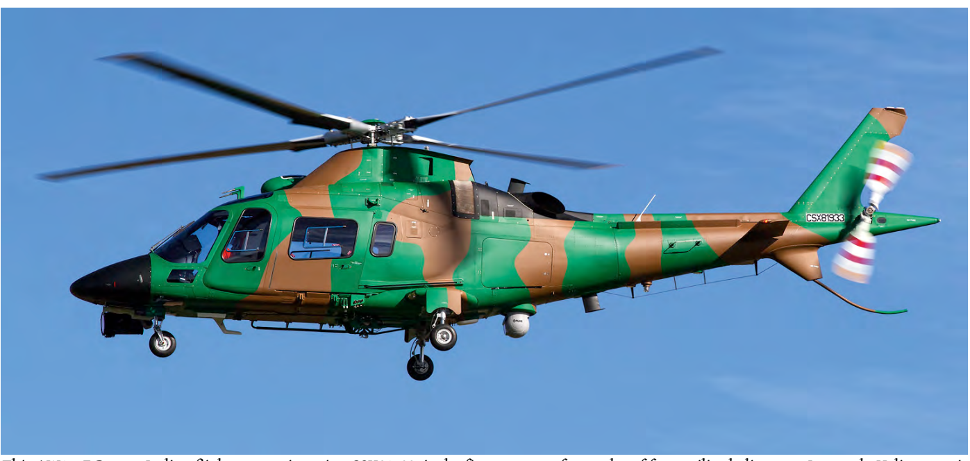
This AW109E Power, Italian flight test registration CSX81933, is the first one out of an order of four utility helicopters Leonardo Helicopters is building for the air force of Cameroon. (Varese-Venegono, 24 September 2018, Fabrizio Capenti)