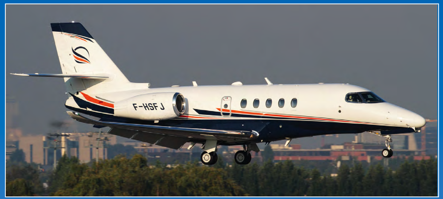
This one year old Cessna 680 Latitude is operated by Astonjet. The F-HSFJ was seen seconds before touch down at Brussels International Airport. (2 September 2018, Robert Eikelenboom)