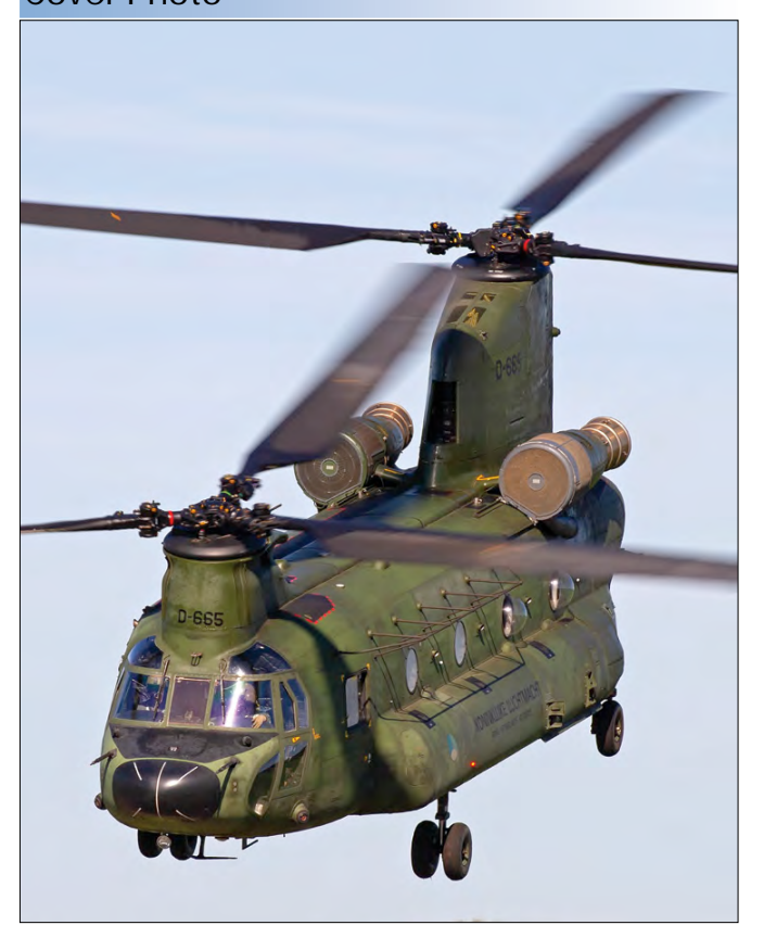
Dino van Doorn captured CH-47D D-665 during departure from Deelen during air assault training Falcon Autumn 2018, on 5 October 2018.