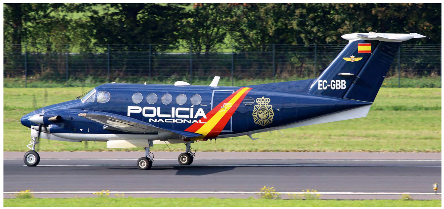
This Beech 200 entered the Spanish civil aviation register in 1995. Since at least 2004 EC-GBB is operated by the Spanish Police. (Rotterdam - The Hague, 25 September 2018,)