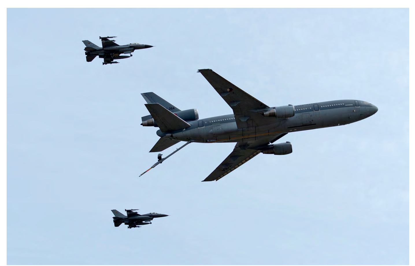
One of the highlights of the Leaseweb Texel Airshow was the flyby of Royal Netherlands Air Force KDC-10 T-264 flanked by Belgian Air Force F-16s FA84 and FA118. This flyby points to the close links between the two air forces. The KDC-10 is one of the tanker aircraft of the Royal Netherlands Air Force, which will be replaced in a few years by the state-of-the-art Airbus A330MRTT. (Texel, 4 August 2018, Harrie Kraaijeveld)