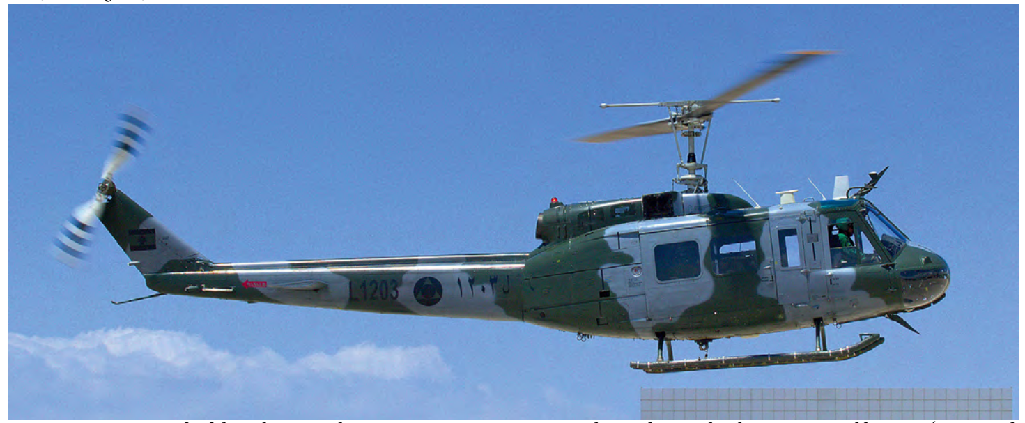
Most numerous aircraft of the Lebanon is the UH-1H Huey-II. L-1203 is seen here. The serial indicates it is used by 12sq. (Beirut Intl, Jim Walg, 29 June 2018)