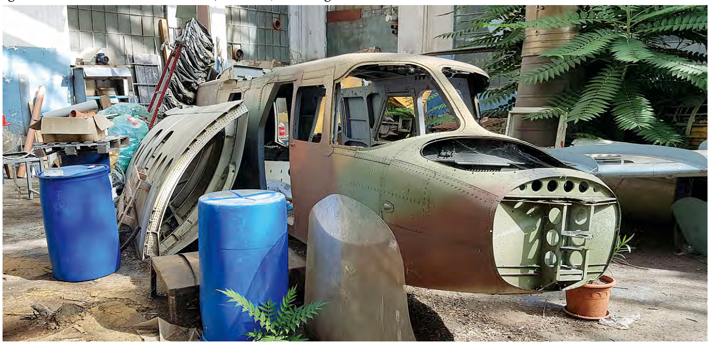
Angola Air Force Islander R-204 in dismantled state at the Muzeul Universitatii Politehnica in Bucharest (10 August 2018,)

(R-204) BN-2A-21 stored, dismantled 797 aug18 This ex Angola Islander is stored at the internal courtyard of the Muzeul Universitatii Politehnica. The Yak-52 has been identified, it has c/n 899615 . MiG-17PF 413 and MiG-21F-13 713 are also still here.