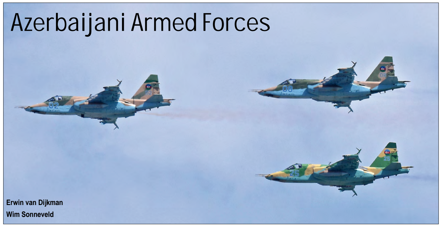
During the parade to commemorate 100 years of Armed Forces on 26 June 2018, twelve Su-25 participated.

In this article we present an overview of all branches of the Azerbaijani armed forces, Azərbaycan Yaraqly Qüvvələri.