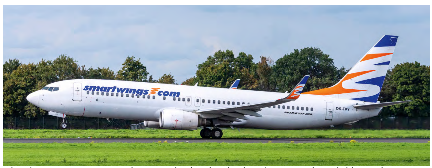
Delivered to XL Airways Germany in 2007 this Boeing 737 has always been the subject of various winter leases which began with CanJet in 2010. OK-TVY has been operated by SmartWings since May 2013. (Rotterdam - The Hague, 14 September 2018,)