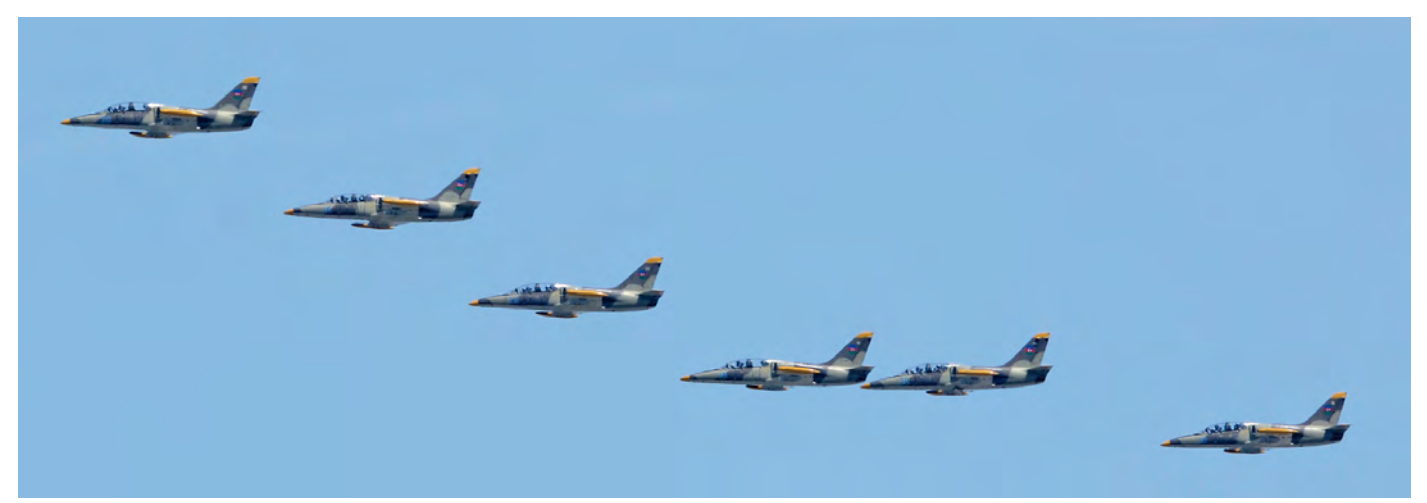
Like many other types, the number of L-39 is much higher than various export lists suggest.