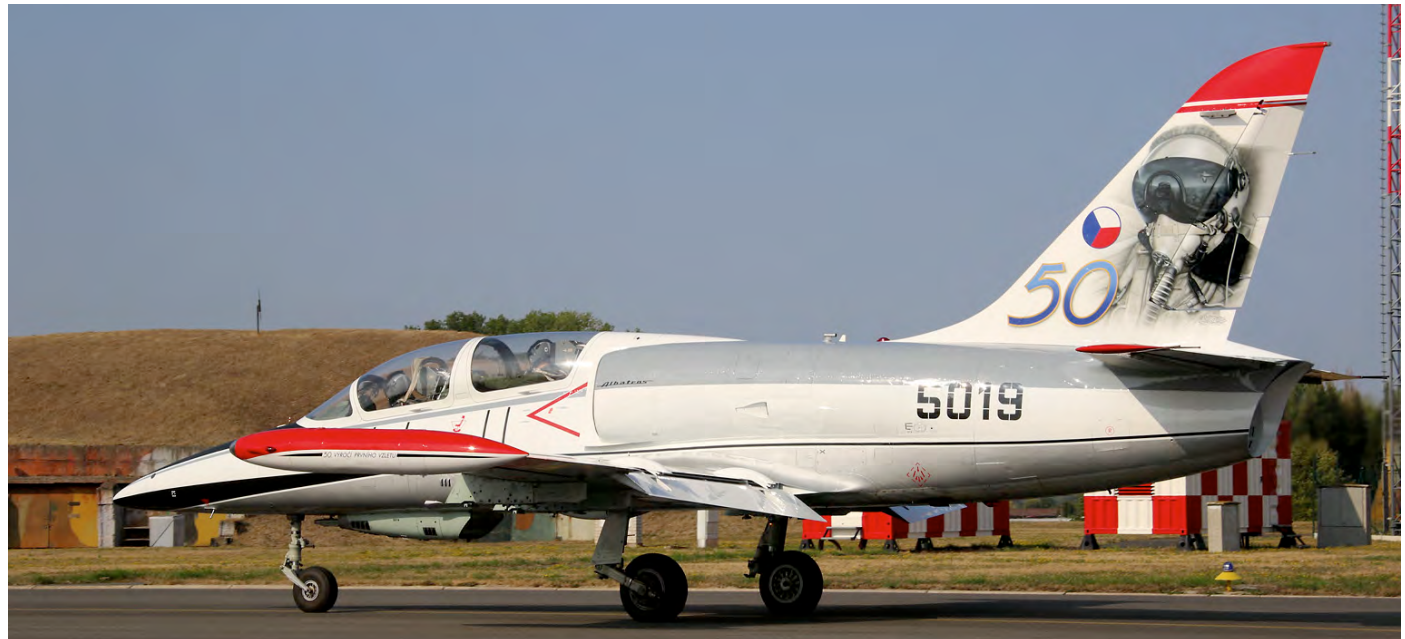
Czech Air Force 213.vlt L-39ZA 5019 has been painted in special markings to celebrate the L-39's 50th anniversary on 4 November. The aircraft, the last to be delivered to the CZAF, flew from Caslav for the first time in these marks on August 28. The image on this side of tail depicts Aero's factory pilot, Rudolf Duchoň with his visor down. He flew the prototype L-39, X-02, during its maiden flight on November 4, 1968. The other side of the tail shows the face of Duchoň himself. (Cáslav, 29 August 2018, Alan Warnes)