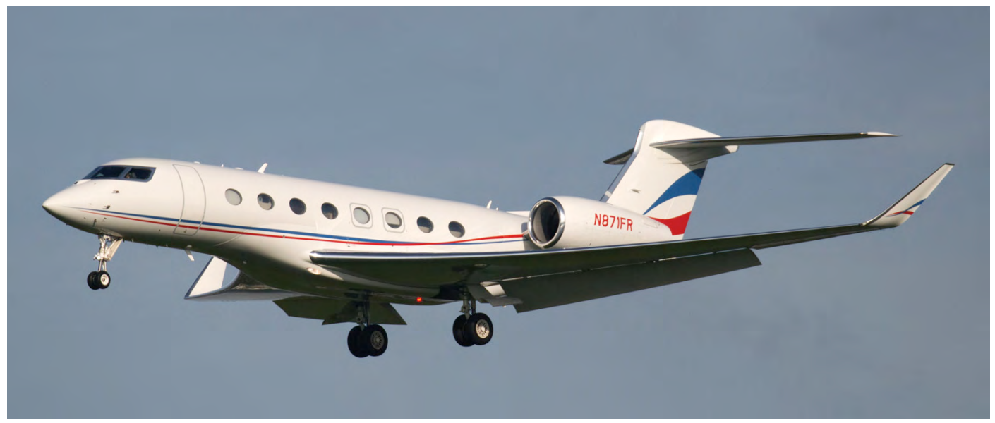
N871FR was delivered to Phenix Jet earlier this year to replace an older G650 with the same registration. Phenix was established in July last year and so far operates a fleet of around six G650s and a few Globals. (Amsterdam - Schiphol, 26 September 2018)