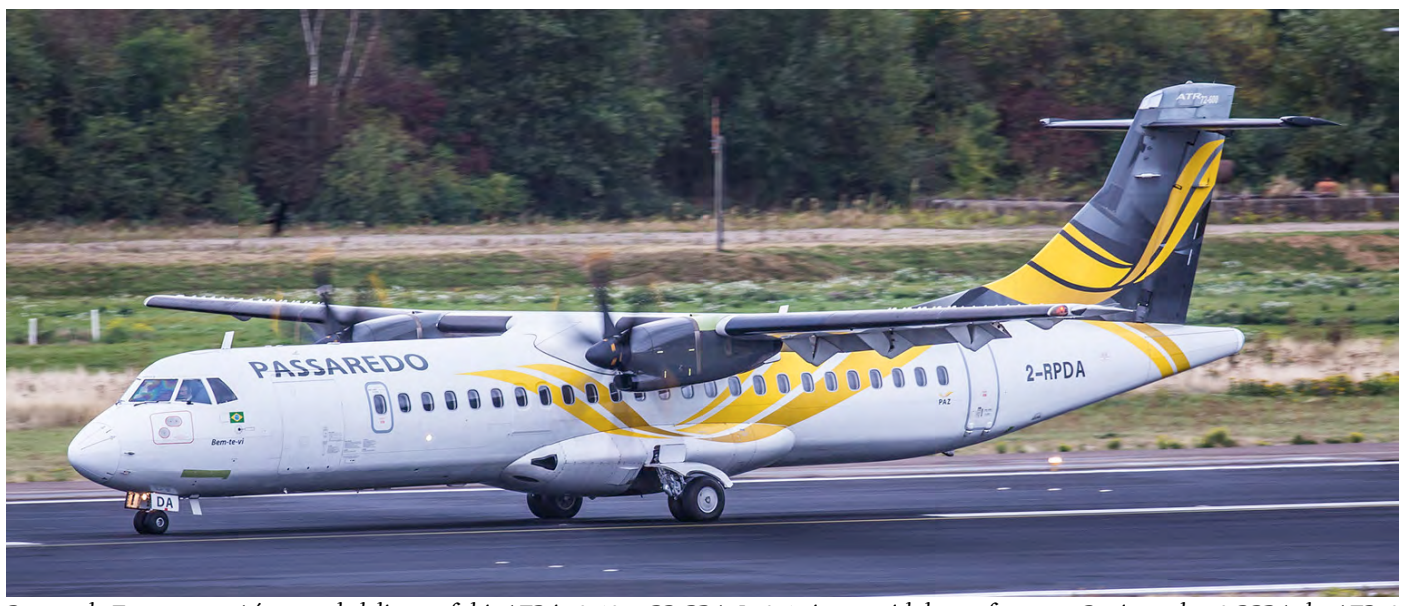
Passaredo Transportes Aéreos took delivery of this ATR in 2012 as PR-PDA. In 2017 it was withdrawn from use. Registered as 2-RPDA the ATR72 arrived at Maastricht for a repaint. (Maastricht - Aachen, 28 September 2018, Bjorn van der Velpen)