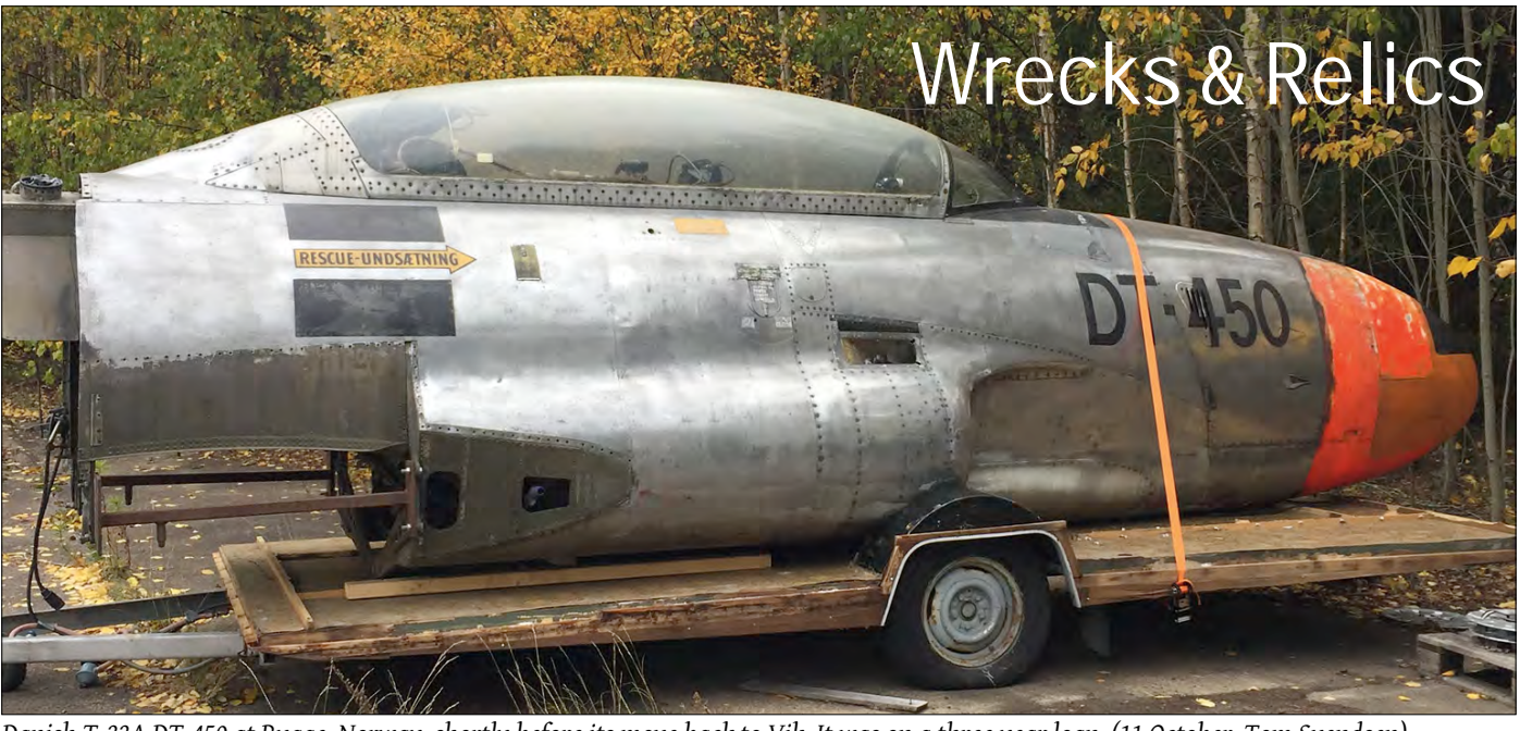
Danish T-33A DT-450 at Rygge, Norway, shortly before its move back to Vik. It was on a three year loan. (11 October,)