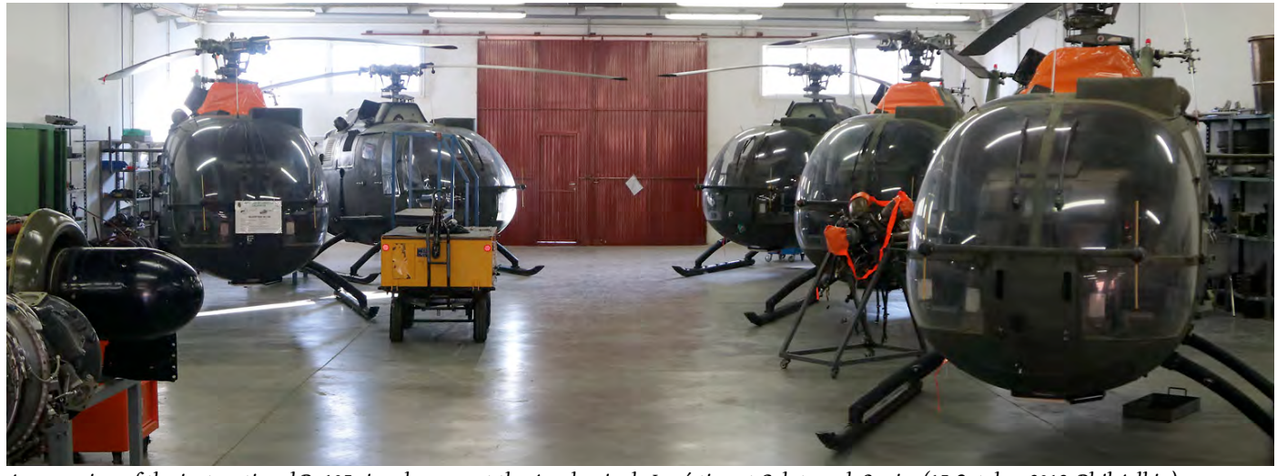
An overview of the instructional Bo105s in a hangar at the Academia de Logística at Calatayud, Spain. (15 October 2018,)