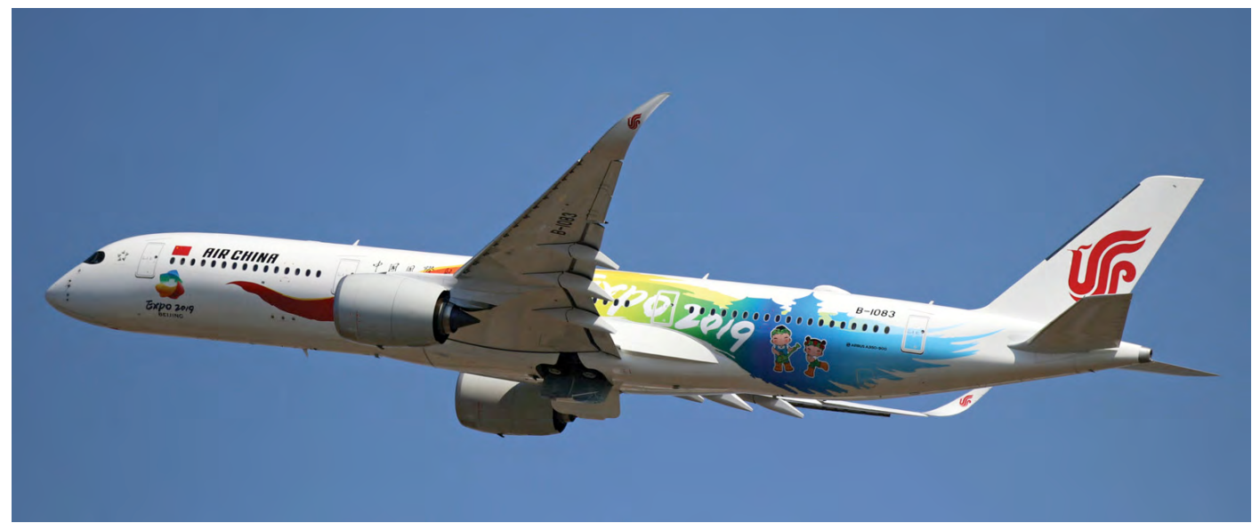
Besides the Boeing 787-9 Dreamliner, Air China also operates the Airbus A350-900. In total they have ordered ten A350-900s, off which four have been delivered so far at the end of October 2018. One of them is this B-1083, which was delivered on 19 September in a special "Expo 2019 Beijng" colour scheme. The aircraft was pictured after take-off for its delivery flight to China at Toulouse.

order into five A350-1000s, eight A330-800s, ten A321neos and five A320neos.