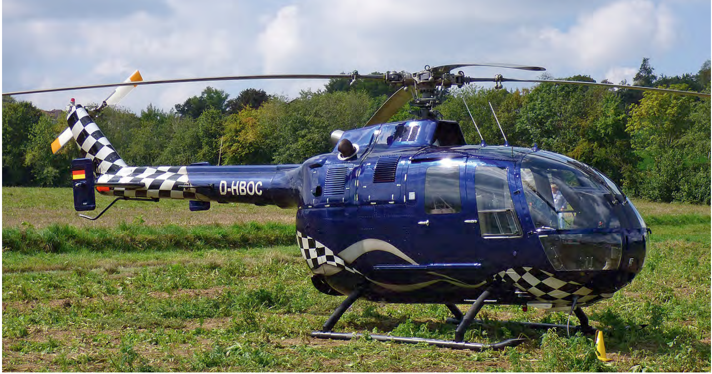
This Bo105CB2 was delivered to the German police in early 1983. D-HBOC currently has an unknown private operator. (Gmunden, 8 September 2018,)