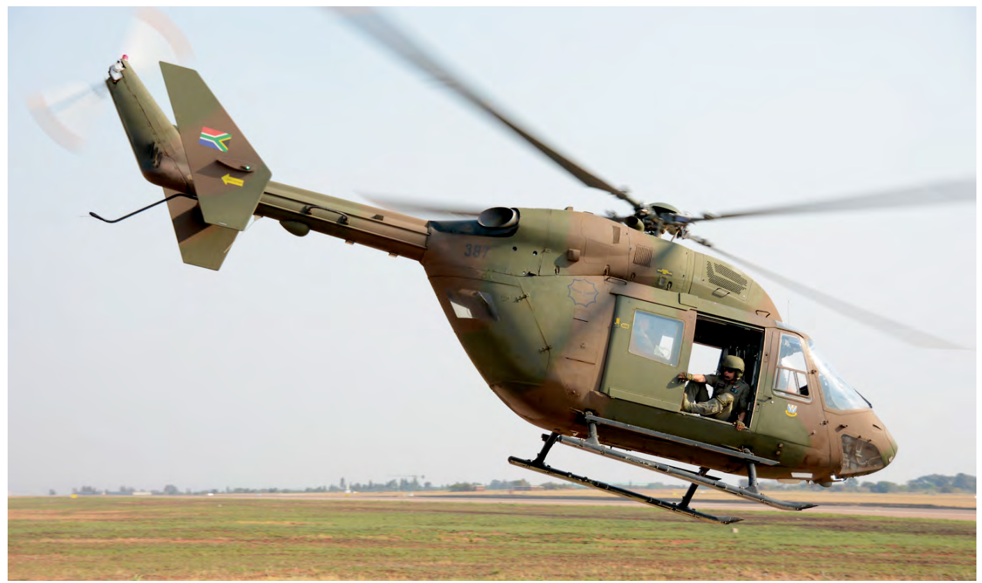
Only one unit, C-Flight from 15 squadron, operates the BK117. These are based at Port Elizabeth on the Southeast coast. This one, 387, was present at the AAD2018 airshow but was also seen at other locations during this period. (AFB Waterkloof, 19 September 2018, Raymond van Dijkhuizen)