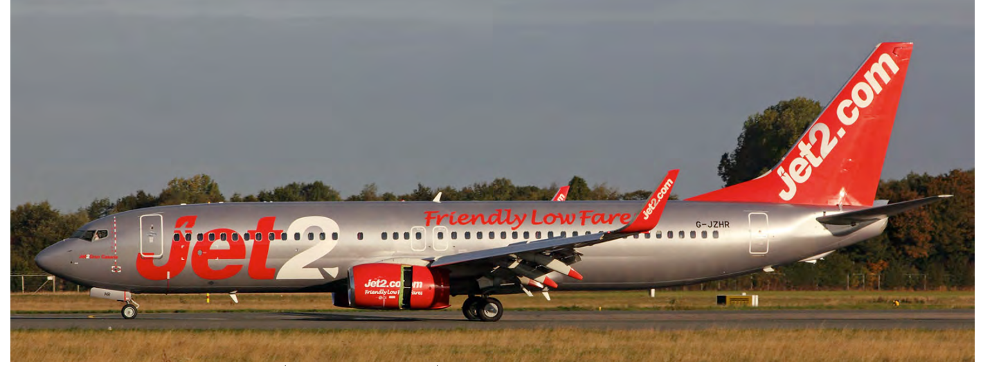
Jet2 took delivery of this Boeing 737-800 (note no custemer code) in December 2016. The aircraft was captured while operating a flight from and to Birmingham. (Groningen - Eelde, 30 September 2018, Menno Molenaar)