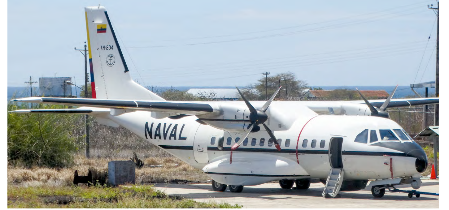
Photographed at Galapagos, an archipelago famous for its tortoises, Danny de Kiewit saw CN235M AN-204 of the Ecuadorian Navy. The detachment here draws aircraft from both naval air stations on the mainland. The Navy presence is for maritime patrol and the prevention of smuggling activities. (San Cristóbal, 3 August 2018)