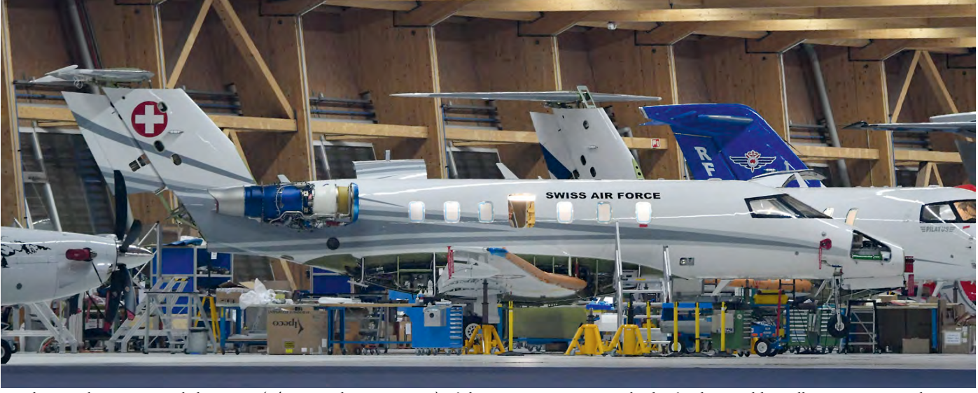
Stephan Widmer captured the PC-24 (c/n 121 to become T-786) of the Swiss Air Force inside the final assembly Hall 9 at Stans-Buochs on 19 October 2018. On 15 October the aircraft was noted outside in full colour scheme for the first time, as the aircraft came out of the production hall 25.

We did not mention the prefix change of the KT-1 fleet yet. During 2017, they changed from LD- to LL-. That may have