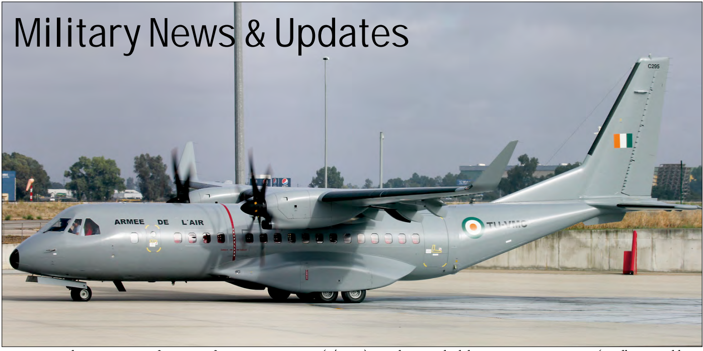
Ivory Coast is latest customer of CASA in Africa. C295W TU-VMC (c/n 175) was photographed during an engine test-run. (Sevilla-San Pablo, 16 October 2018, Gordon Wimmer)

Because of our standardization we sometimes use type, unit and serial presentations that may strongly differ from those used by the manufacturer or user. It is therefore possible that the information sent by you can deviate from the information we publish.