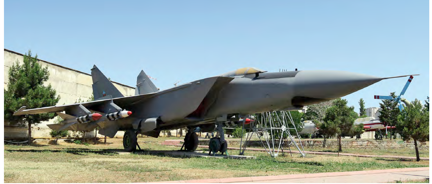
The mighty MiG-25 has been withdrawn from use. Persistent rumours notwithstanding, they do not have a stack stored for a possible future update and return to service. Although that was indeed a plan that was seriously considered. Now, the air force is looking to types as the Pakistani JF-17 and Italian M346 as a future combat aircraft. Most MiG-25s were axed, luckily a few remain preserved and stored. Personal copy Distribution to a third party is not allowed 109