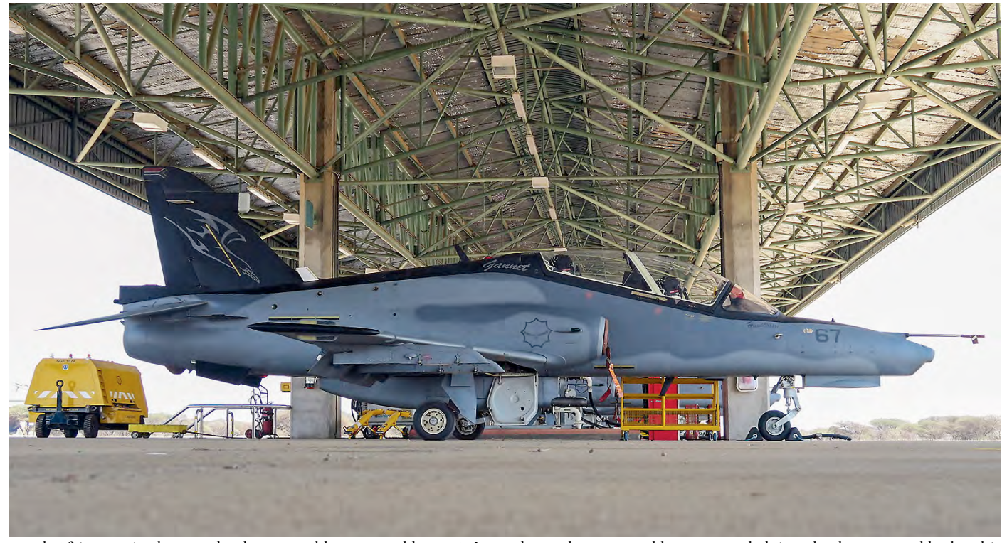
South Africa received 24 Hawk Mk120, roughly comparable to RAF's Hawk T2. They are used by 85 Central Flying Shool at AFB Makhado. This special coloured aircraft 267 is dubbed 'Gannet' after the bird in the unit's badge. (AFB Makhado, 18 September 2018, Erwin van Dijkman)

Johannesburg-0.R.Tambo Intl 22 September 2018 855 Cheetah R preserved Denel gate