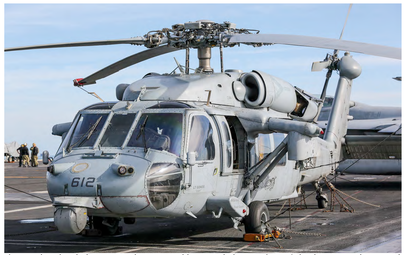
The Dragonslayers brought their MH-60S on this cruise. One of these HSC-11 birds is 167844/AB-612. (onboard CVN-75, 7 October 2018,)