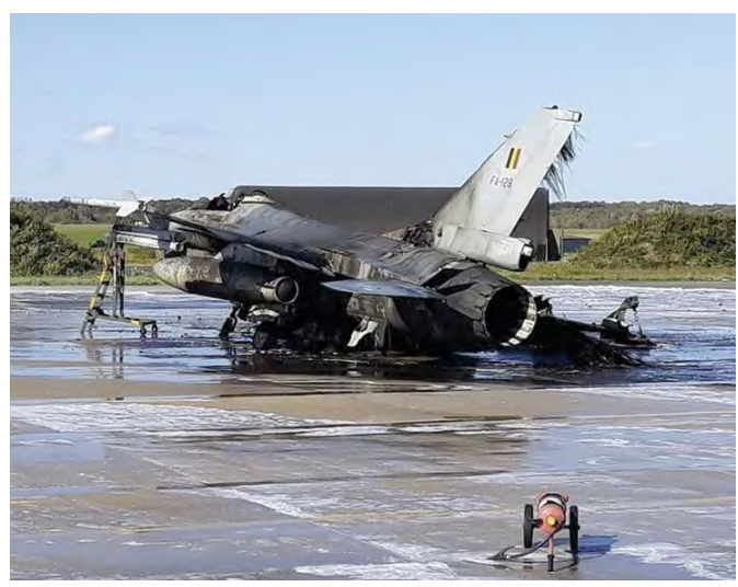
We end up with the same aircraft with which we opened this section. At least what is left of it, after it was shot by one of its colleagues. (Florennes, 11 October 2018)