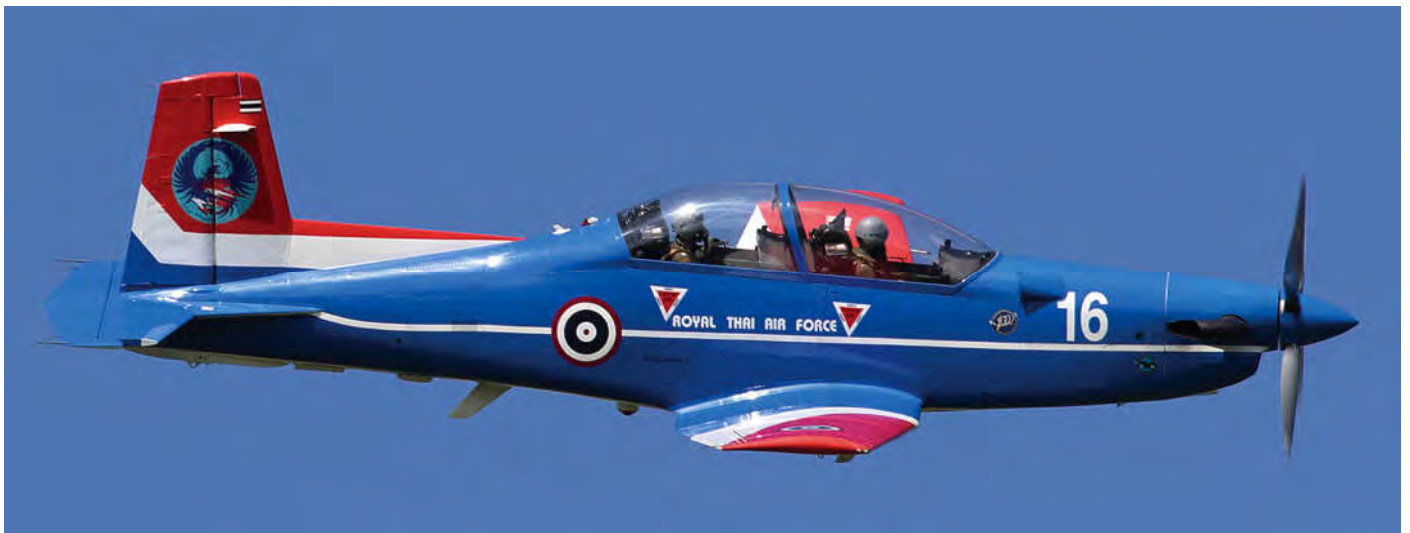
Advanced flight training is provided by the PC-9. Some of the locally known F19's like this F19-16/35 are used by the Blue Phoenix demonstration team (Don Muang, 8 January 2018, Jurgen van Toor)