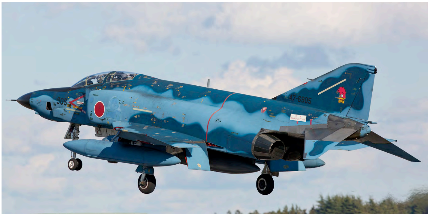
One of three blue camouflaged RF-4E Kais Japan's 501 Hikotai is operating from Hyakuri in the recce role, photographed at its homebase. Another ten are still operational in a more standard military camo pattern, however at any one time, three recce Phantoms are at Nagoya for overhaul. The unit is rumoured to become a fighter squadron after March 2020. (6 December 2017, Robert A.M. van Zon)

Nellis AFB (LSV/KLSV) 16 oktober 2017 01-7053/SW F-16CM 55th FS 04-4068/OT F-22A 422nd TES 06-4120/OT F-22A 422nd TES 08-3178 C-130J-30 40th AS 82-0022/OT F-15C 422nd TES 83-0014/WA F-15C 433rd WPS 83-0019/WA F-15C 433rd WPS 83-1159/WA-59 F-16C 64th AGRS 84-0024/WA F-15C 433rd WPS 84-0045/WA F-15C 433rd WPS 84-1244/WA-44 F-16C 64th AGRS 86-0272/WA-72 F-16C 64th AGRS 86-0299/WA F-16C 64th AGRS 87-0362/OT F-16CM 422nd TES 88-0436/HL F-16CM 24th TASS 90-0245/MO F-15E 391st FS 90-0740 F-16CM 422nd TES 90-0750/WA F-16CM 16th WPS 90-0757/WA F-16CM 16th WPS 90-0842/SW F-16DM 55th FS 90-0845/SW F-16DM 55th FS 91-0381/SW F-16CM 55th FS 91-0470/WA F-16DM 16th WPS 91-0473/WA F-16DM 16th WPS 91-0478/WA F-16DM 16th WPS