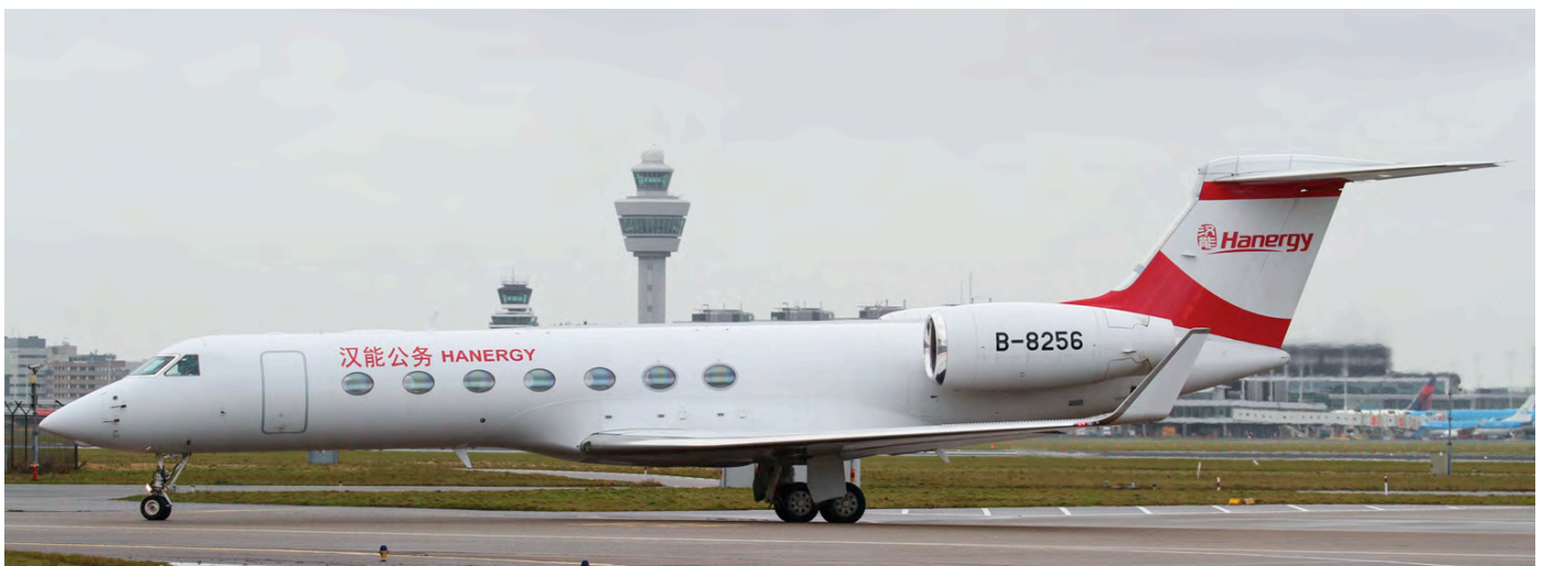
In October 2012 this Gulfstream G550 was delivered to Hanergy Jet. Hanergy is a privately held Chinese renewable energy company. B-8256 visits Europe frequently. (Amsterdam - Schiphol, 2 January 2018,)