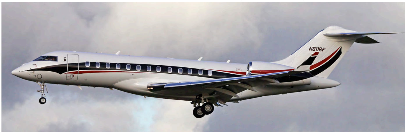
Global 6000 N611BF was delivered in June 2017 and carries c/n 9774. It is registered to 927 Holdings LLC. (Rotterdam, 21 January 2018,)