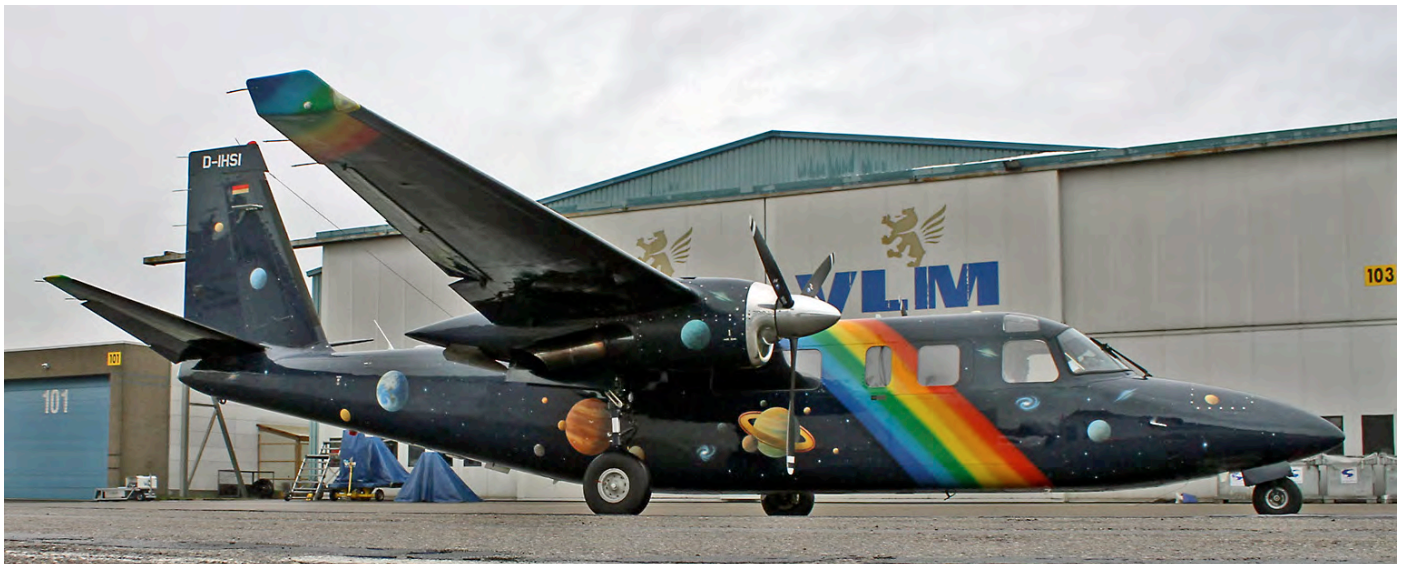
This Aero Commander 695 has been resident in Germany since 1980 and is a regular fixture at the European airports. D-IHSI probably wins the prize for funkiest colourscheme on any Aero Commander! (Antwerp, 13 December 2017,)