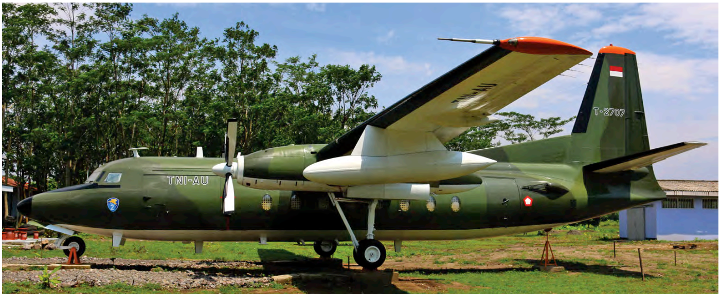
Preserved in the same museum as T-1301 is F27-400M T-2707. T-2707 is actually the old serial of A-2707, which was withdrawn from use in 2013, along with the other remaining Fokker 27s. (Yogyakarta, 28 January 2018, Robbert Snijders)