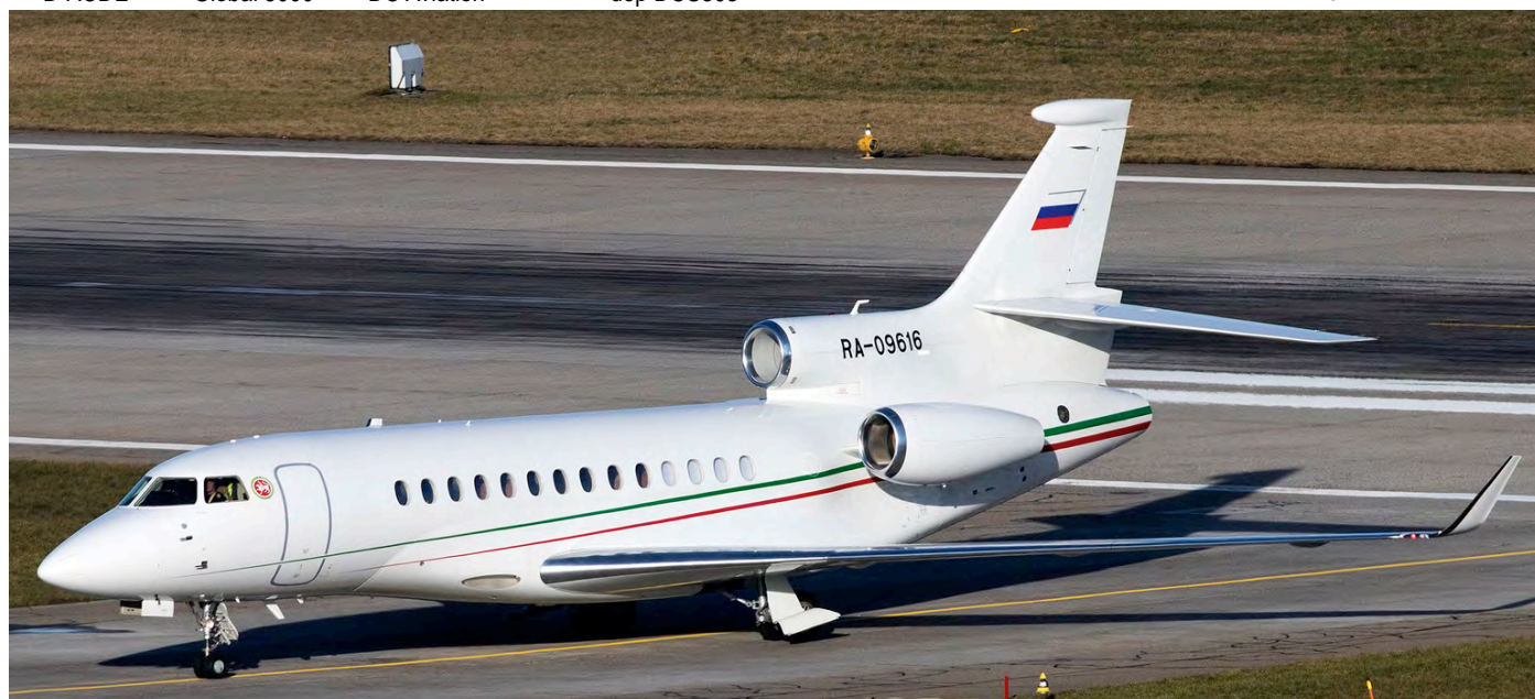
This Falcon 7X was delivered to Ak Bars Aero in 2013 as RA-09616. Due to financial difficulties that company ceased operations on 12 January 2015. Aviaservice Air Company is the current operator. (Zurich, 24 January 2018,)