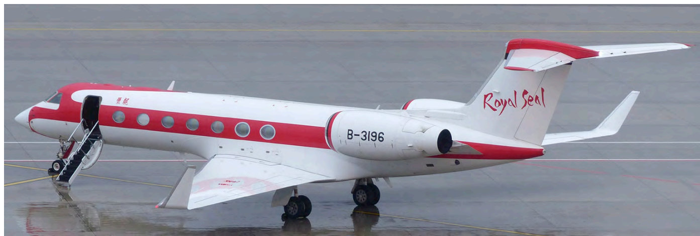
Hina Business Aviation operates Gulfstream G550 B-3196 since December 2015 for Royal Seal, which is a Chinese investment company. (Zurich, 22 January 2018,)