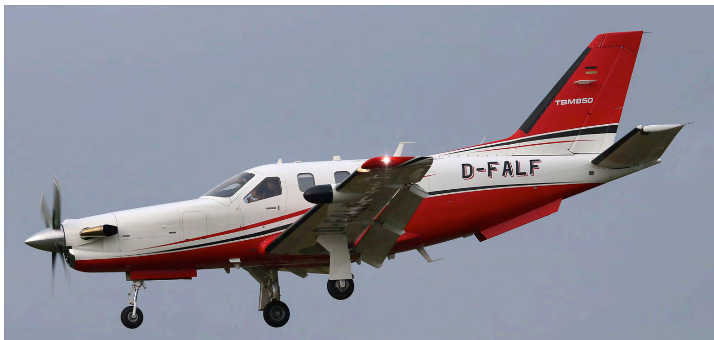
The TBM-850 is a higher-performance version of the TBM-700. The TBM-850 was introduced in 2006. This D-FALF is the second TBM with this registration. It was caught on camera arriving at Budel airfield for maintenance. (6 January 2018, Toon Cox)