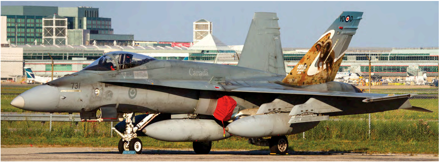
Canadian Hornets regularly visit Toronto. Seen basking here in some nice sunshine is 188731, wearing special tail colours celebrating the contribution of 401 TFS to Operation Impact in 2016. 401 TFS was actually only re-activated in 2016, and the activation ceremony took place in Kuwait while the unit was on deployment.

AFB (FL), the 50th ARS, named the Red Devils, was reactivated in October 2017 to fly KC-135R tanker aircraft.