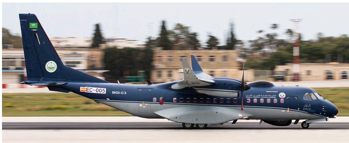
Noted on delivery to Saudi Arabia is C295W MOI-C3. It will be the third C295W operated by the MOI's General Aviation Security Command, that operates them in patrol and transport roles. (Malta, 2 February 2018, Shaun Psaila)

On 16 January 2018, three months after being relocated and re-designated, the 50th Air Refuelling Squadron completed its first refuelling mission with a KC-135 Stratotanker. The 50th ARS is a former Little Rock AFB (AR) based C-130H Hercules squadron and was inactivated at the beginning of 2016. Assigned to the 6th Air Mobility Wing, based at MacDill