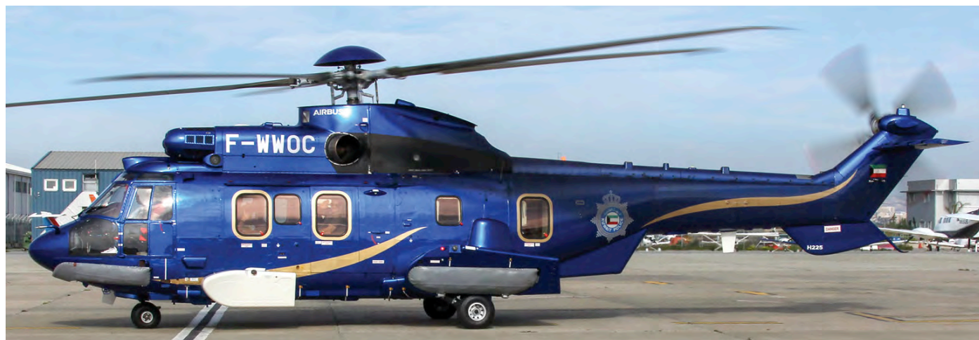
Part two of the Kuwaiti delivery flight was H225 F-WWOC, destined to become KMOI-05. It appears the passengers are enjoying themselves! (Larnaca, 19 February 2018,)

467 (OB-2113) EDACI ex N638AB 172S-11638 jul17