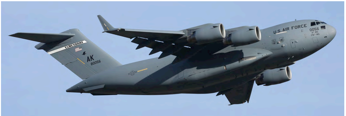
C-17A 98-0056 is part the 517th Airlift Squadron, which is part of the 3rd Wing at Joint Base Elmendorf-Richardson (AK). It visited Basel in relation to President Trump attending the WEF event. (Basel, 24 January 2018,)