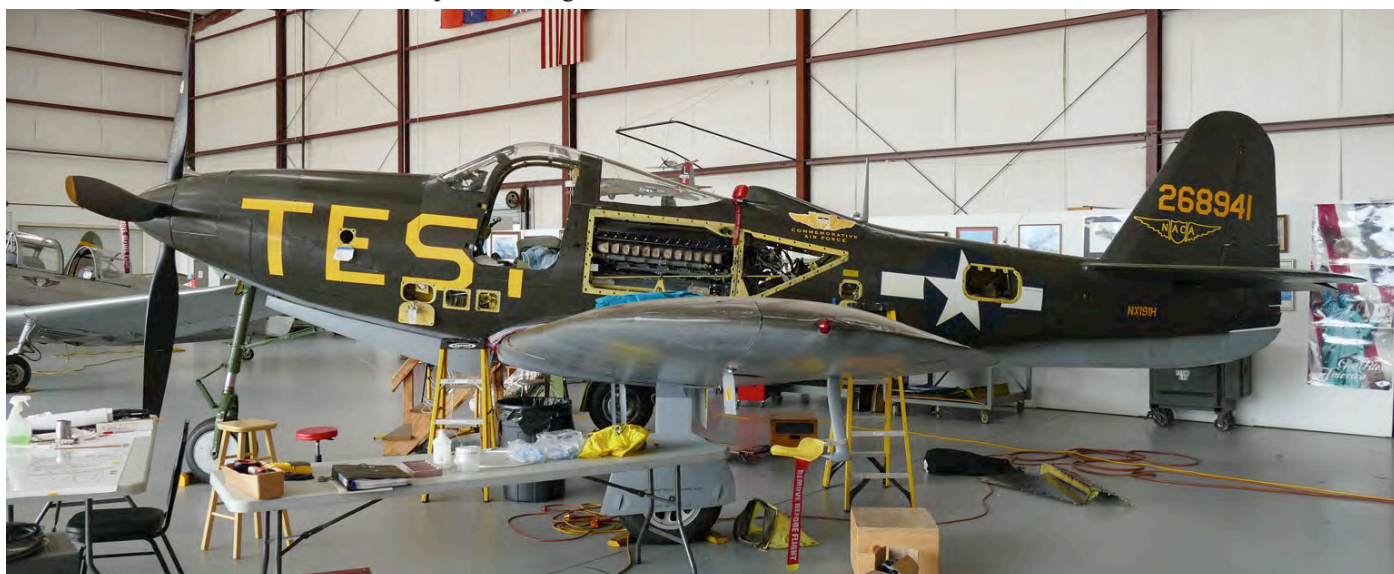
For many years Bell P-63 Kingcobra 42-68941 has been part of the inventory of the Commemorative Air Force. Ian Roberts took a photo of it while maintenance was carried out at Atlanta-Falcon Field (GA) on 22 October 2017. The fighter, NX191H, carries large 'TEST' titles, not because of the phase of restoration, but it is an authentic colourscheme from the time this aircraft was used as a testaircraft by NACA.

Credits: Flypast forum, Fox Alpha Zulu, WIX