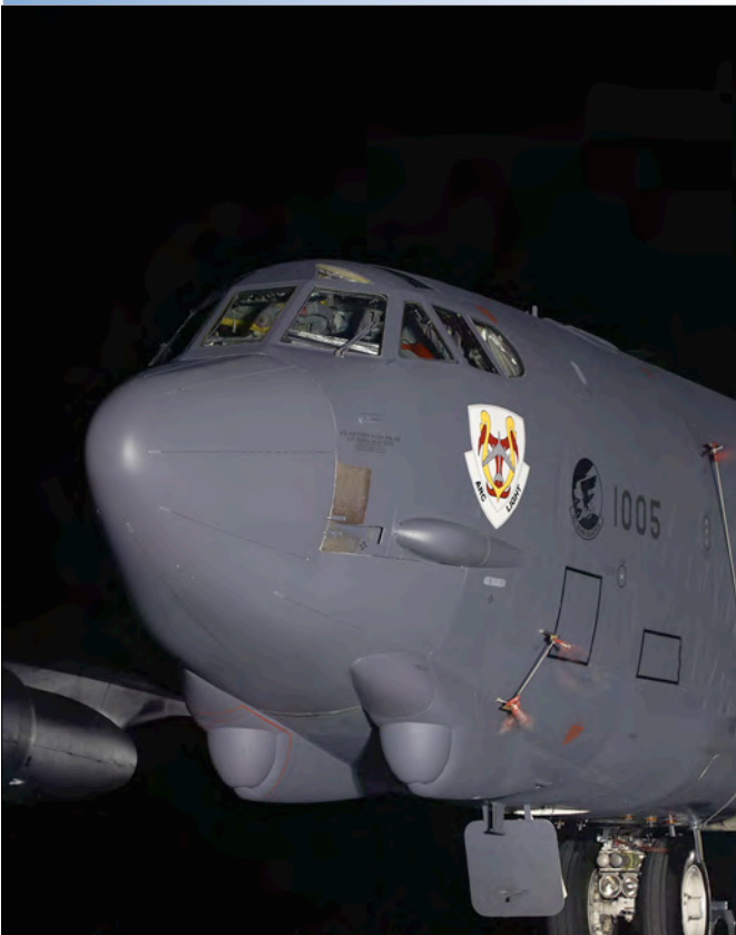
Although this B-52H 61-0005 is part of the 69th Bomb Squadron, during its deployment at Fairford it was being used by 23rd Bomb Squadron. (Fairford, 23 January 2018, Ralph Blok)

If you would like to subscribe to our digital magazine, go to www.pocketmags.com and search for "Scramble"