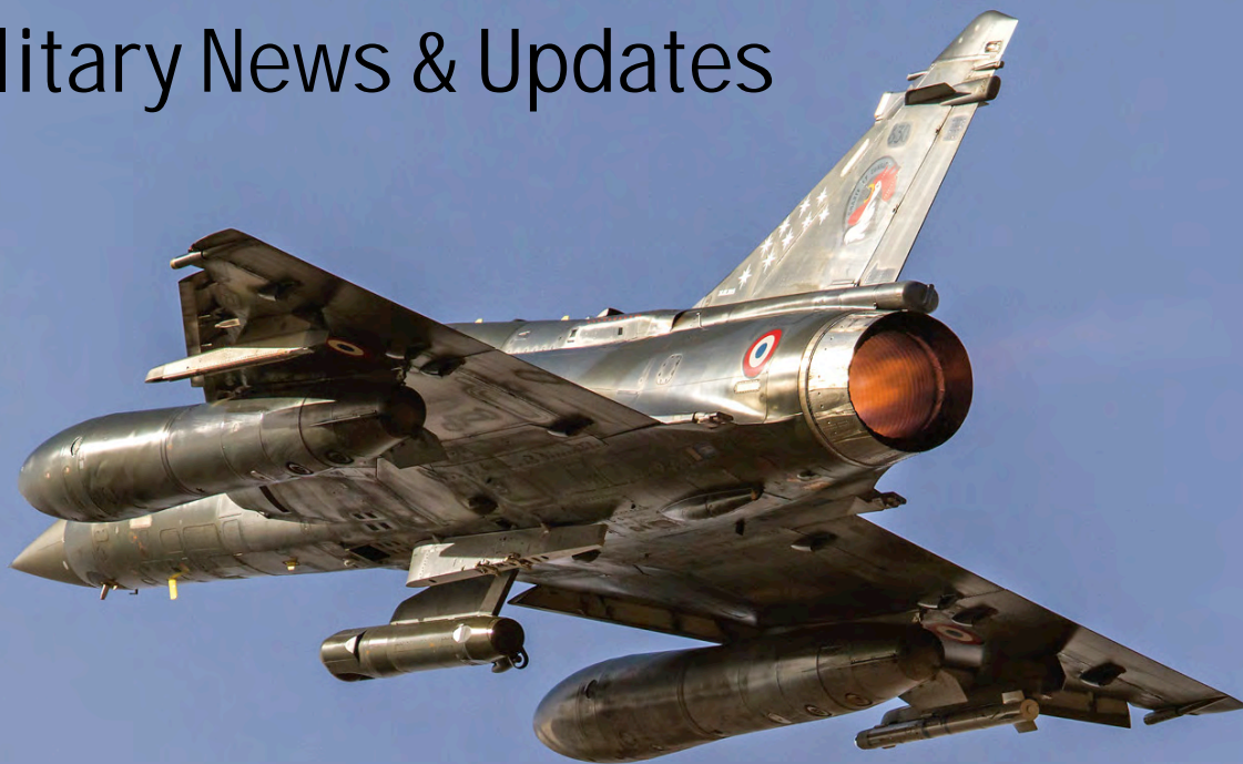
Seen taking off from Albacete on a CSAR mission during TLP2018-1 are the tailpipe and wings of Mirage 2000D 630. The Mirage belongs to ETD02.007 at Nancy-Ochey. (13 February 2018,)

Because of our standardization we sometimes use type, unit and serial presentations that may strongly differ from those used by the manufacturer or user. It is therefore possible that the information sent by you can deviate from the information we publish.