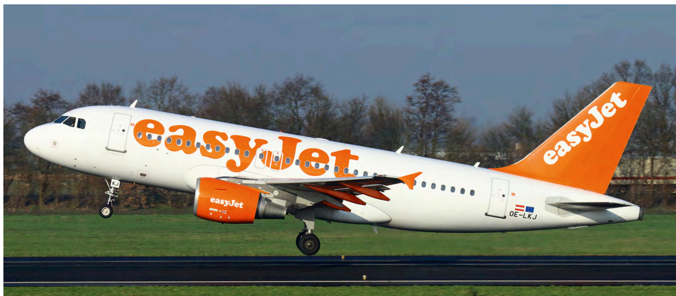
Former G-EZBG was delivered to easyJet in 2006. The Airbus A319 was transferred to easyJet Europe as OE-LKJ in December 2017. The airline was established following the UK referendum vote to leave the European Union. (Rotterdam- the Hague, 26 January 2018, Cor mout)