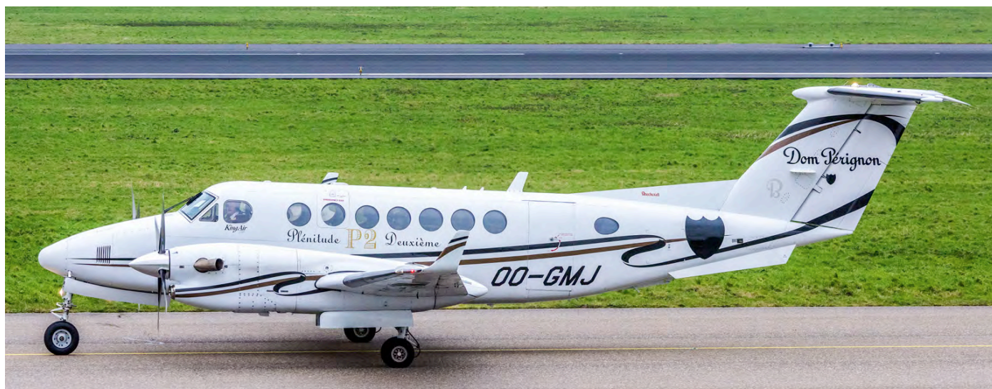
Air Service Liège started operating this Beech 350 registered as D-CGMJ in April 2006. From September 2006 on the Beech has been registered as OO-GMJ. Recently champagne related stickers were added to the aircraft. (Rotterdam- the Hague, 8 January 2018,)