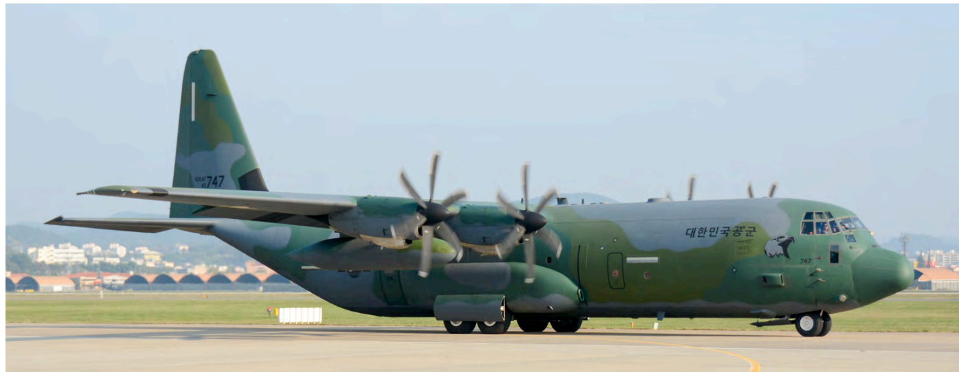
South Korea operates four stretched C-130s based at Gimhae. Note the eagle emblem on the nose, which is the badge of 251 Tactical Air Support Squadron, the unit that operates all the Korean C-130s. (Sacheon, 27 October 2017, Raymond van Dijkhuizen)

All above 13 Hiko Kyoikudan T-4s are now in the red/white colours. T-4 672 was seen landing at Nyutabaru, so could be for 23 or 305 Hikotai. Another possibility is it only made a fuel-stop on its way to Naha. 811 lost the red/white colours during IRAN at Gifu. Lots of T-4 not seen since end 2015: 96-5618 (l/n jun16, 302Hik), 96-5623 (l/n sep16, 304Hik), 06-5629 (l/n sep16, 305Hik), 06-5633 (l/n nov16, 13FTW), 06-5637 (l/n nov16, 13FTW), 06-5646 (l/n nov16, ADC), 06-5651 (l/n aug16, ADTW), 06-5652 (l/n dec16, 32FTS), 16-5660 (l/n mar16,