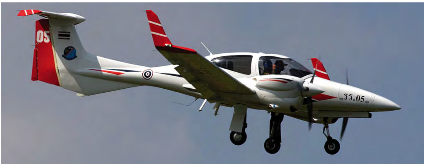
For multi-engine flight training the F20/Da-42 is used by the Royal Thai Air Force, like this F20-12/60 with code RR.05 from Flying Training School/Diamond Flight based at Kamphaeng Saen (Don Muang, 8 January 2018)

Distribution to a third party is not allowed