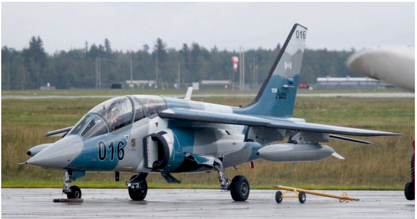
Alpha Jet C-GTZO is used by Montreal (QC) based Top Aces, a company that offers various sorts of airborne training for armed forces. For these missions the aircraft has been upgraded with modernized TacNav avionics. (CFB Bagotville (QC), 15 August 2017)

19 October 2017 Iruma 28-1002 C-1 403 Hikotai 37-4489 CH-47J 52-1151 YS-11FC Hiko Tenkentai 58-1012 C-1 403 Hikotai 68-1014 C-1 403 Hikotai 68-1018 C-1 402 Hikotai 75-1077 C-130H 401 Hikotai 75-3251 U-4 402 Hikotai 78-1021 EC-1 Denshi Sakusen 78-1023 C-1 scrapped 78-1025 C-1 402 Hikotai 85-1080 KC-130H 401 Hikotai 88-1028 C-1 402 Hikotai 98-1029 C-1 402 Hikotai