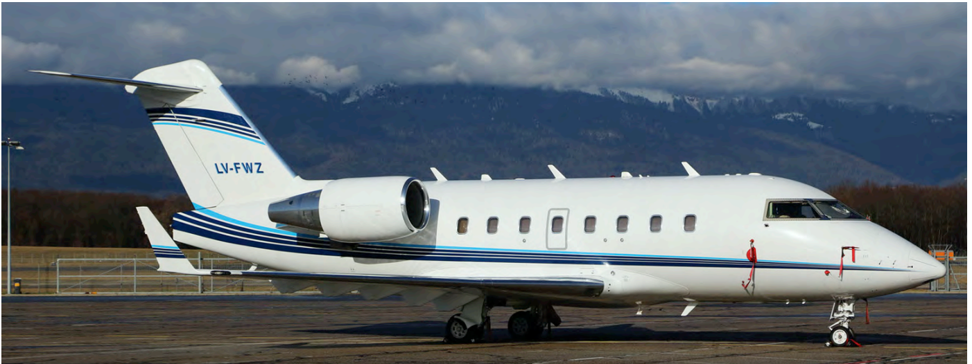
Delivered to Nationwide Mutual Insurance as N72NP in 1998 this Challenger went to Canada in 2012. Baires Fly added this CL-604 to its fleet in 2015 as LV-FWZ but it was transferred to Aerorutas early 2016. (Geneva, 23 January 2018,)