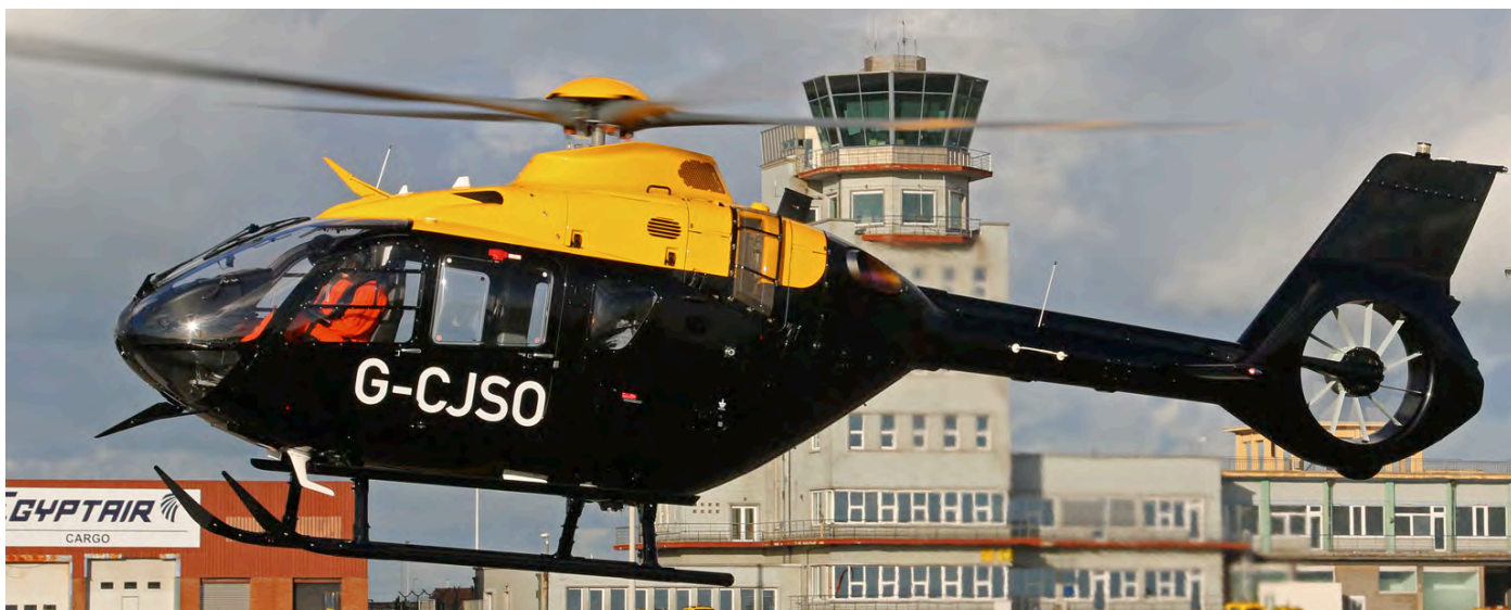
This H135 was registered to Airbus Helicopters UK on 17 January 2018. Almost a week later it was transferred to Ascent, a 50/50 joint venture between Lockheed Martin and Babcock International, as Juno HT1 ZM515. G-CJSO was caught on camera while on its delivery flight to the UK. (Antwerp, 19 January 2018,)