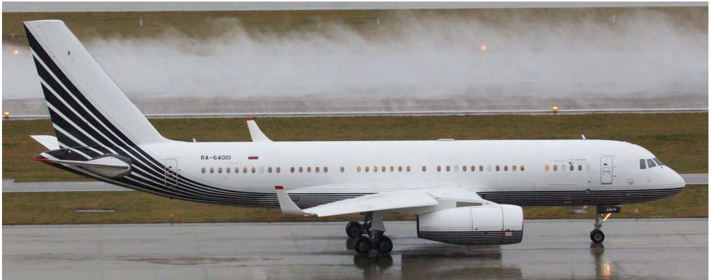
RA-64010 was first noted in 1993 at Le Bourget with OryolAvia as operator. Two years later it was the first Tu-204 converted to freighter. In August 2009 the aircraft made its first flight after conversion to Tu-204-300A, a VIP aircraft for eighteen passengers. Biznes-Aero is the current operator. (Zurich, 22 January 2018,)