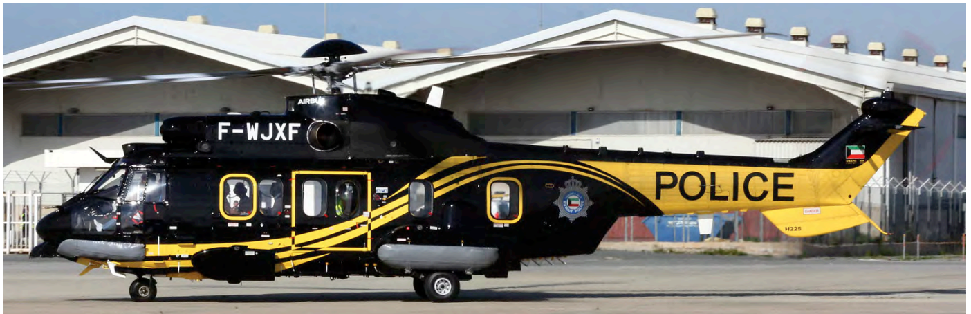
The Kuwait Police has taken delivery of two H225, probably part of an order for 30 H225s placed in 2016. F-WJXF will become KMOI-08, which signals that the Kuwait Police falls under the Ministry of Interior. (Larnaca, 19 February 2018,)