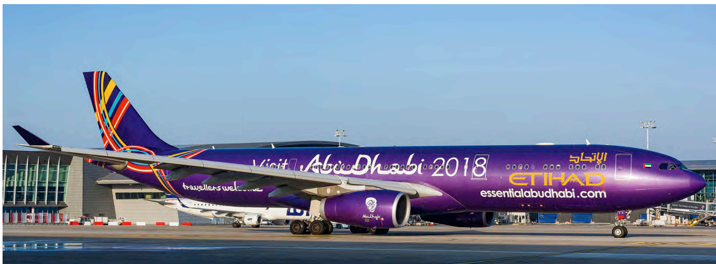
Airbus A330 A6-AFA was delivered to Etihad Airways in 2009. It carries the 'Abu Dhabi Welcome Travelers' livery since 2012 and each year the last number in the year is adjusted. (Brussel, 14 January 2018,)