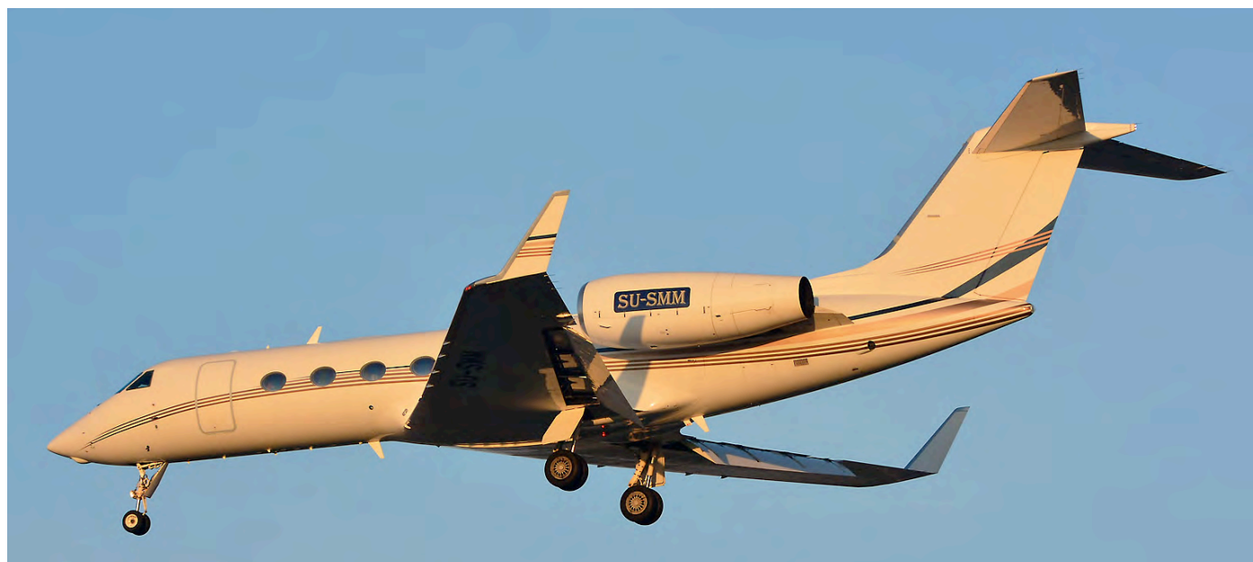
Smart Aviation took delivery of its first G450 in October 2017. Airframe 4111 was formerly N178SD and operated in Venezuela for eight years. (Amsterdam-Schiphol, 18 February 2018,)