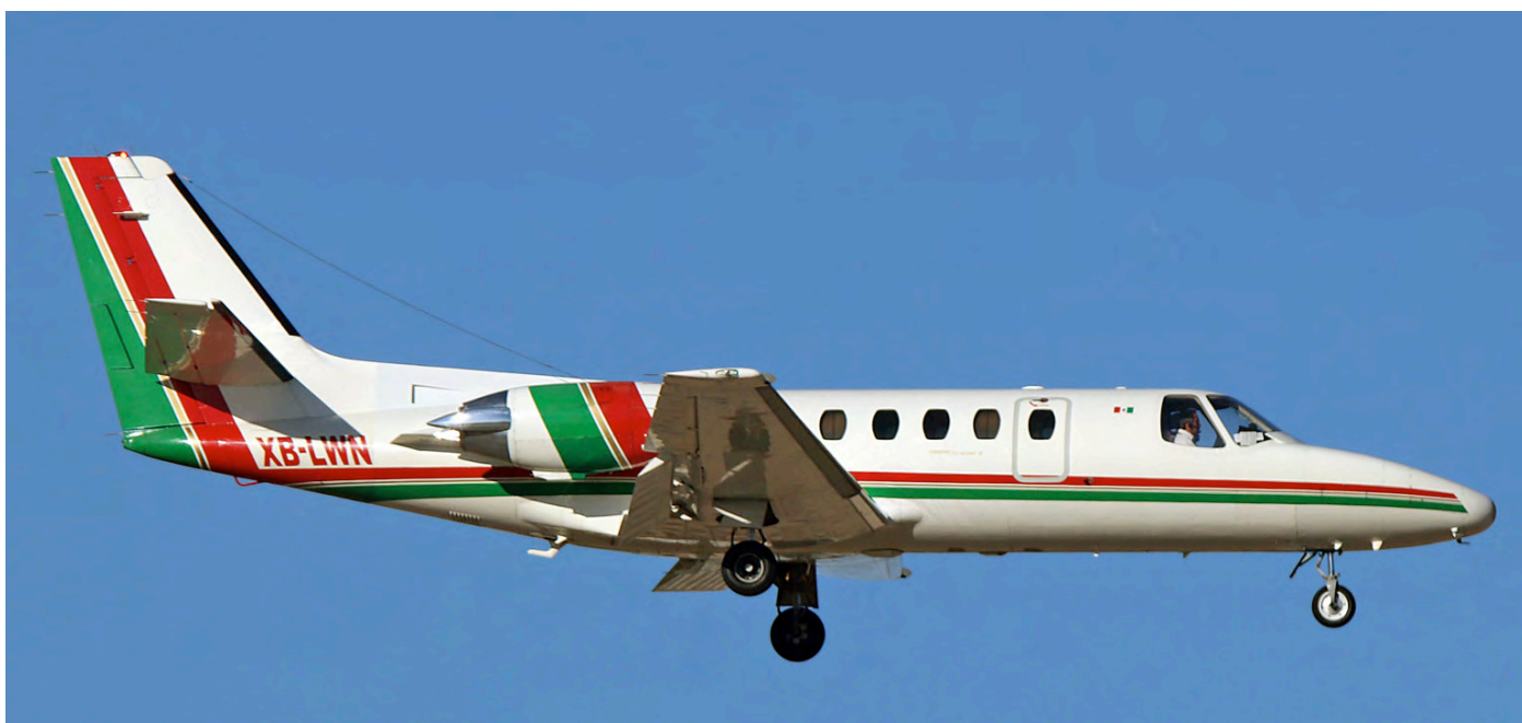
Owners and operators for these kinds of Mexican registered aircraft are very hard to find. In this case it is no different. This Mexican registered aircraft makes regular trips to Tucson International Airport. Cessna 550 XB-LWN has been operational in Mexico since its delivery in 1991. (Tucson (AZ), 10 October 2017, Ramon Berk)