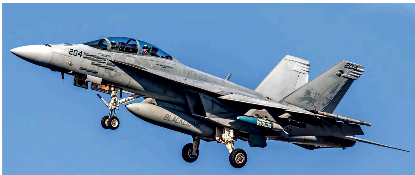
Judging by the markings on the nose, F/A-18F 166682 of VFA-213 Blacklions has dropped quite some ordnance above the Middle East. It is seen here returning from a sortie at NAS Oceana.