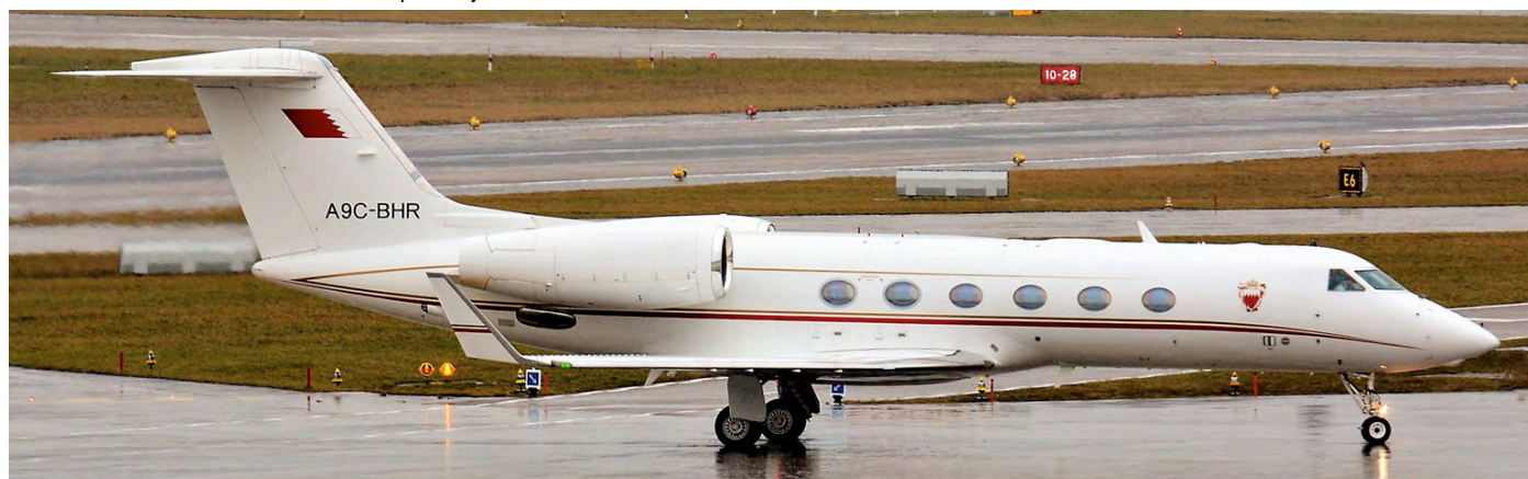
The Government of Bahrain is the operator of Gulfstream G450 A9C-BHR. It was delivered to Bahrain in January 2007. (Zurich, 22 January 2018, Majid Khoshnaw)