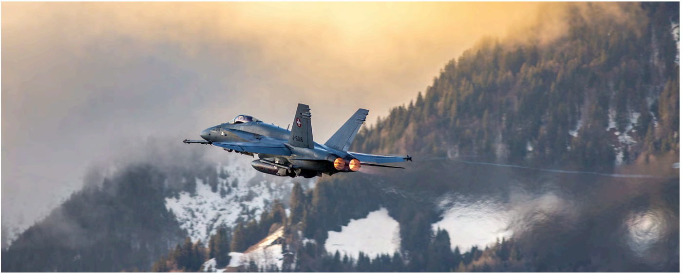
During conference hours, the F/A-18 pilots monitored the no-fly zone across the whole of Graubünden, the eastern most and largest canton of Switzerland, without interruption flying Combat Air Patrol missions. J-5016 is seen taking off from the air base on its way to another WEF-CAP mission. The Swiss Air Force guarded the sky above Davos with Hornets out of Meiringen and Payerne. (Meiringen, 23 January 2018)