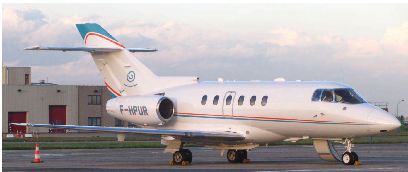
This Hawker 800 was acquired by Laboratoire Puresentiel in August 2017. The BAe125 was transferred to ING Equipment Lease Belgium as owner on 10 January 2018. At that same date Valljet became the operator. F-HPUR still carries the logo of its previous owner. (Brussels, 19 January 2018,)