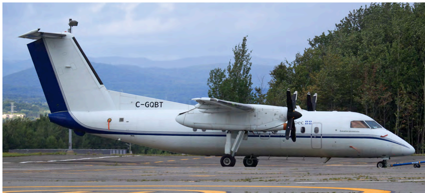
This Dash-8 was delivered to Air Niugini in July 1997. Former P2-ANL was transferred to the Gouvernement du Québec in October 1999 as C-GQBT. (Quebec/Jean Lesage Int'l (QC), 24 August 2017,)