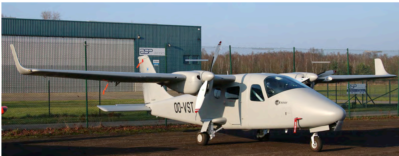
OO-VST is one of two TECNAM P2006Ts on the Belgian registry. The aircraft is based at Ostend. The owner is Vansteelandt, specialists in performing detailed and accurate 3D measurements according to their website. (Genk-Zwartberg, 14 January 2018, Toon Cox)