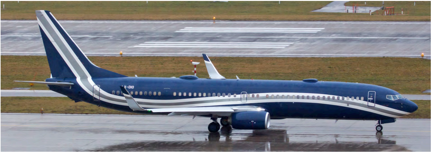
Global Jet Luxembourg took delivery of this BBJ3 in 2017 after spending twelve months at Basel for outfitting. LX-DIO spend some time at Basel again while operating on behalf of the Angolan Government during the WEF. (Zurich, 22 January 2018,)