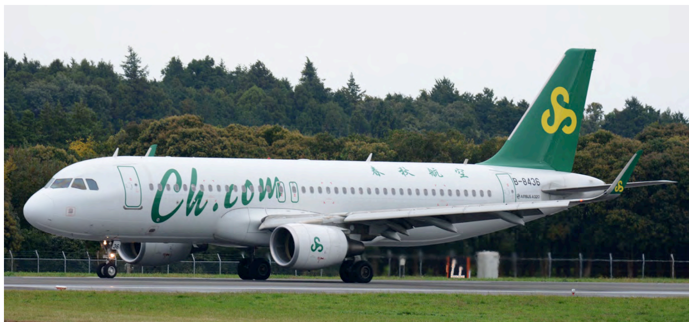
Spring Airlines is a Chinese low-cost carrier. The first flight was on 18 July 2005. Airbus A320 B-8436 was delivered to the airline in June 2016. Fun fact: Its Chinese name literally means Spring Autumn Airlines. (Ibaraki Airport, 20 October 2017)