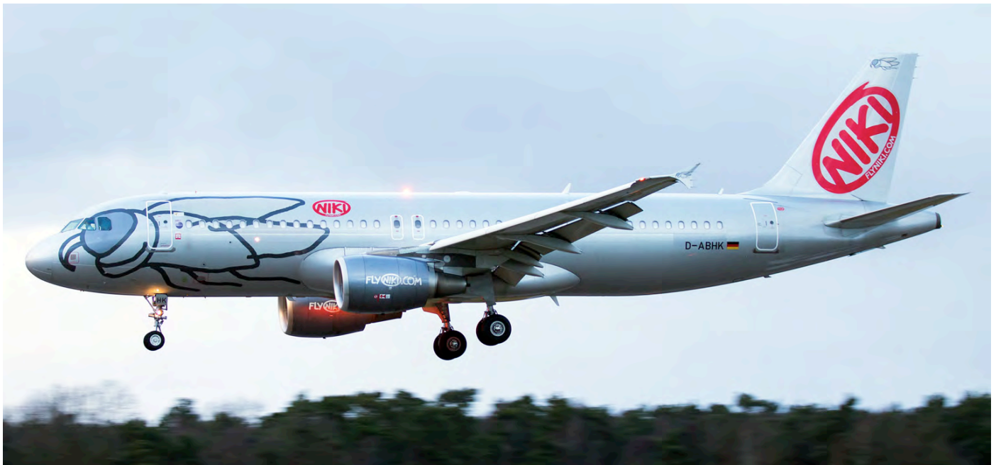
This Airbus A320 was delivered to Niki in January 2011 as OE-LEG. It was transferred to Air Berlin in February 2017 but retained the Niki colours. After the demise of Air Berlin the Airbus was withdrawn from use and ferried to Munich. On 12 December 2017 D-ABHK was ferried from Munich to Dusseldorf. (Woensdrecht, 17 January 2018,)