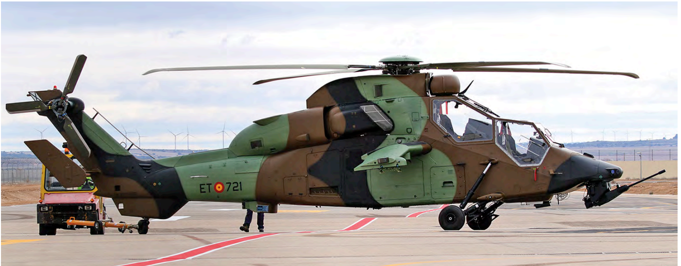
Also noted at the TLP was Tiger HAD HA.28-21, the latest Tiger delivered to the FAMET. (Albacete, 14 February 2018,)

aircraft in scope are QQ100 (A109E), QQ101 (BAe146-RJ100), QQ102 (BAe 146-RJ70), QQ103 (Diamond DA42) and ZE416 (A109E).