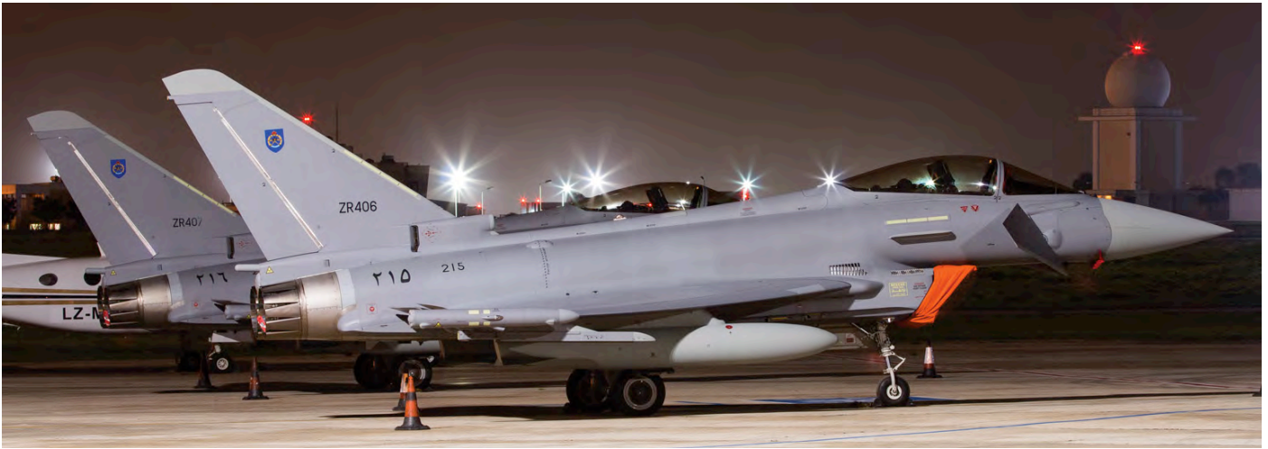
Photographed here are Omani Typhoons nine and ten on delivery to their new home. They were noted at Malta during a night stop. (5 February 2018, Shaun Psaila)

OB-2114 (468?) EDACI ex N639AB 172S-11639 may17 OB-2115 to 477? EDACI ex N640TA 172S-11640 dec15 OB-2116 (478?) EDACI ex N641TA 172S-11641 dec17 OB-2117 to 479? EDACI ex N642TA 172S-11642 dec15