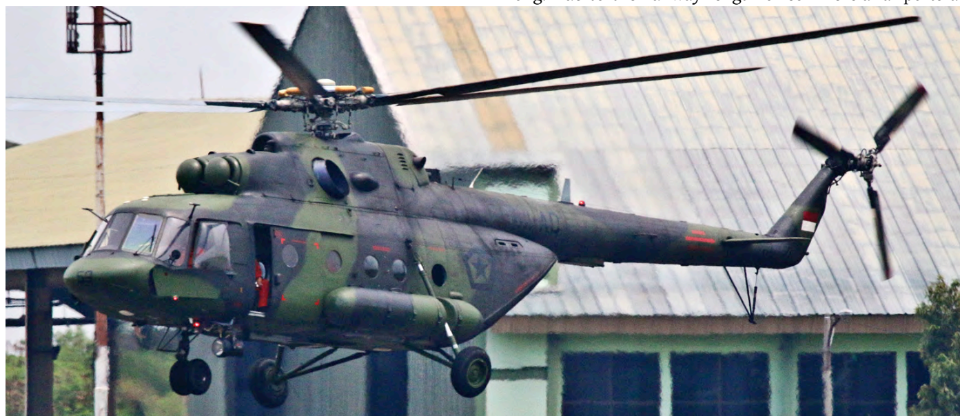
The TNI-AD operates eleven Mi-17V-5s, down from the twelve delivered from 2008 to 2011. They are all operated by Skuadron Udara Angkatan Darat 31 at Semarang, where HA-5159 was photographed as well. (1 February 2018, Robbert Snijders)

Japan is exploring the possibility to procure the F-35B as an improvement of its current capabilities of defending the remote islands. Now it is the sole task of two Naha Hikotais, however the flying time to possible targets proves to be too long. Due to the runway length of commercial airports at