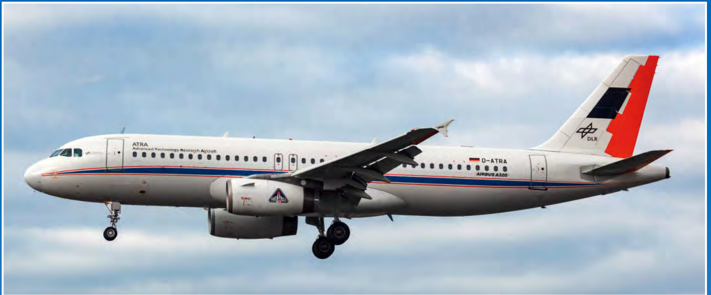
Together with the NASA DC-8 this DLR (Deutsches Zentrum für Luft- und Raumfahrt) A320 D-ATRA was present at Ramstein AB to make several test flights above Europe. (Ramstein AB, 30 January 2018)