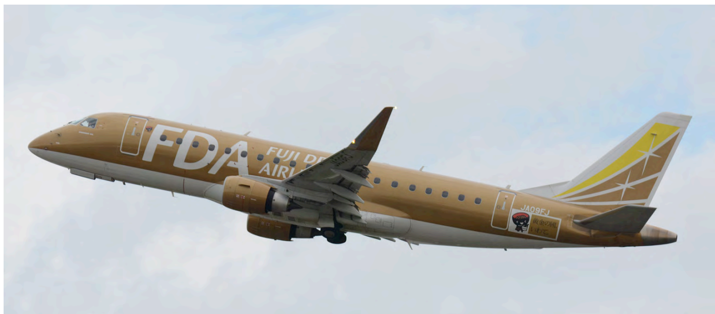
Embraer 175STD JA09FJ was delivered fresh from the factory in 2015 to Fuji Dream Airlines. The domestic airline inaugurated its first flight on 23 July 2009. (Nagoya Chubu Centrair International Airport, 24 October 2017)