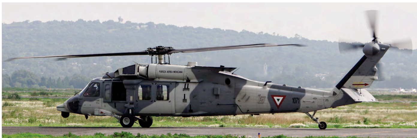
Fuerza Aérea Mexicana Black Hawk 1071, of EA.108, crashed on 16 February when it attempted to land during a VIP inspection flight of earthquake damage in Oaxaca State, Mexico. The helicopter crashed on top of two vans in an open field. (Santa Lucia, 8 September 2017, Enrique Giese)