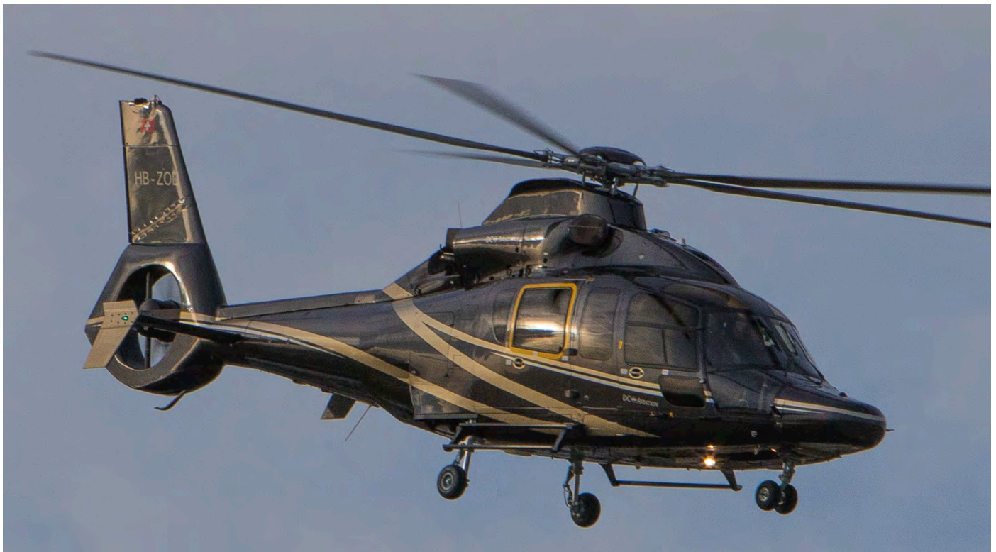
This EC155B1 was initially delivered to Spain as EC-KPU in 2009. It was acquired by Heli-Link Helicopter April 2013 as HB-ZOL. In 2016 that company was renamed to DC Aviation Switzerland. (Zurich, 25 January 2018,)