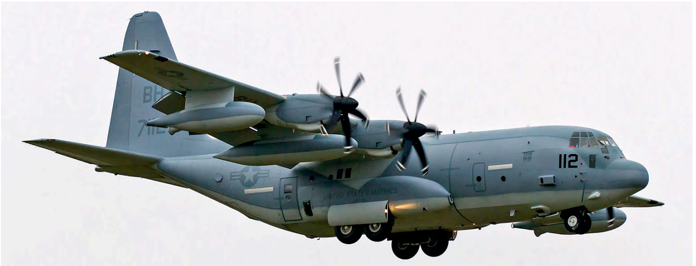
KC-130J 167112 is operated by VMGR-252 at MCAS Cherry Point, and is one of in total 51 KC-130Js operated by the USMC. (Ramstein, 14 January 2018, Dino van Doorn)

F-35A-31 15-5118/OT 31st TES ex OT/422nd TES AF-109 jan18 15-5135/LF 63rd FS AF-126 jan18 15-5136/HL 4th FW AF-127 jan18