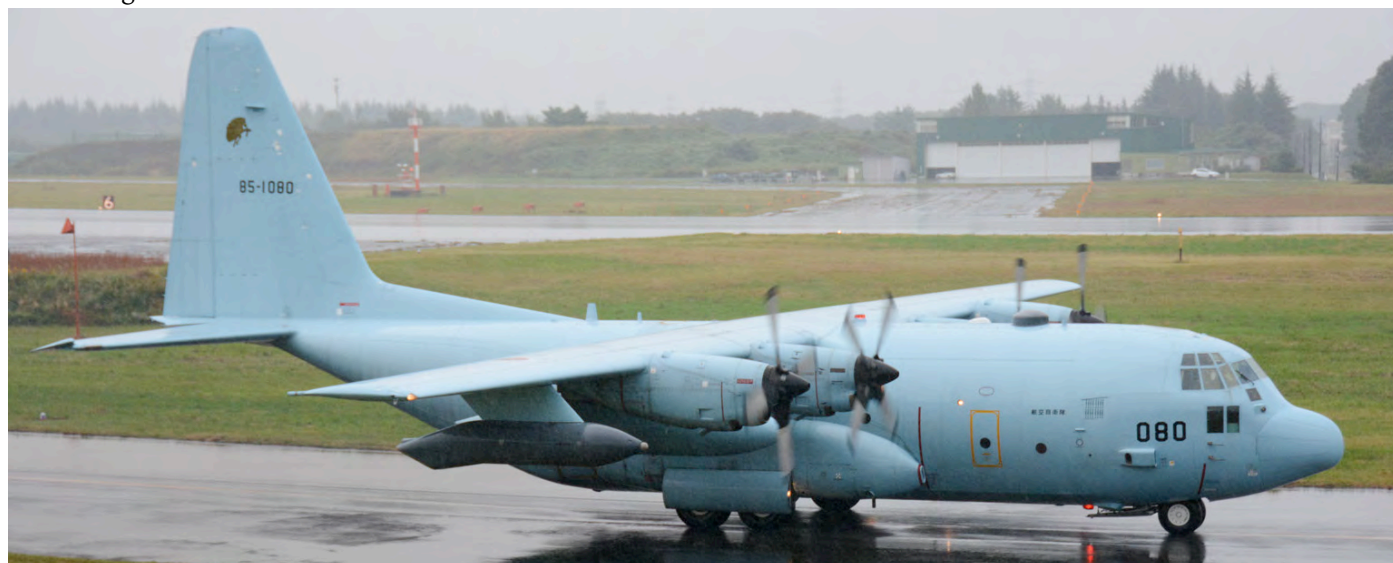
One of the few JASDF C-130H Hercules still in the light blue colour scheme is 85-1080, also one of only two (for the moment) aircraft modified to KC-130H, able to carry two aerial refueling pods. On this photograph at Iruma on 19 October 2017, one of these pods is clearly visible.