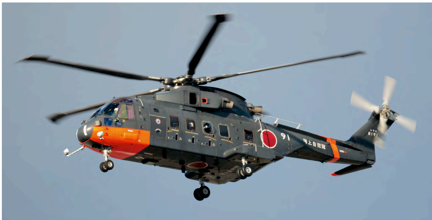
Seen on a test-flight after overhaul at Gifu, Kawasaki built CH-101 8191 is operated by the Shirase Hikohan, a unit shore-based at Iwakuni but frequently operating from the Polar icebreaker AGB5003/JDS Shirase. Besides the ten MCH-101 ASW helicopters, the Japanese navy also operates three CH-101s. (Gifu, 23 October 2017, Raymond van Dijkhuizen)