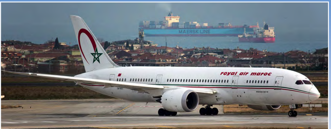
A Boeing 787 of Royal Air Maroc at Istanbul is not a common sight. On 27 January CN-RGC performed a flight from Casablanca. (Marcus Steidele)