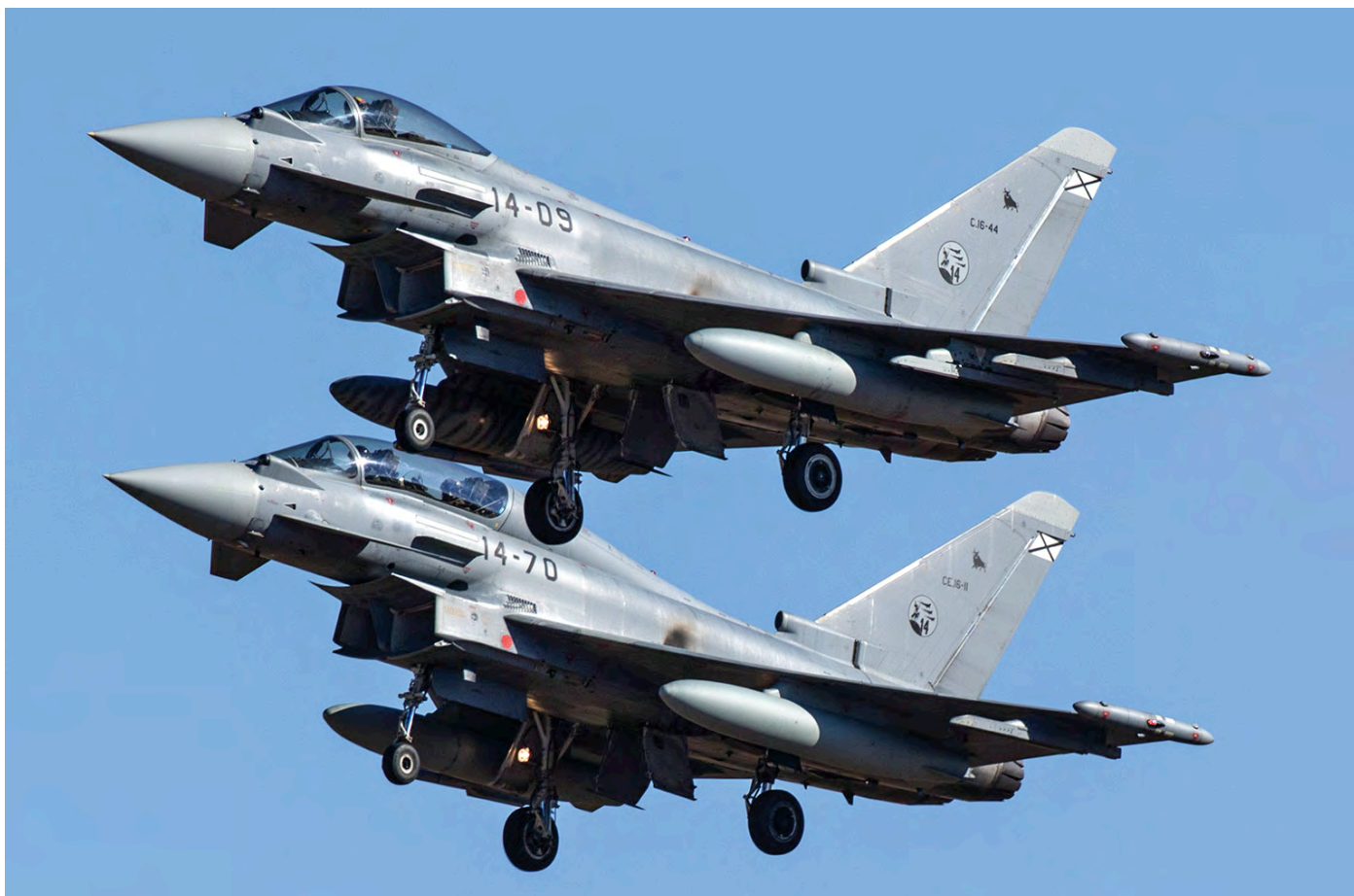
One of the obvious participants at the TLP are of course EF-2000s belonging to the EdA. Seen here are C.16-44 and CE.16-11 performing a dual landing. (Albacete, 15 February 2018,)