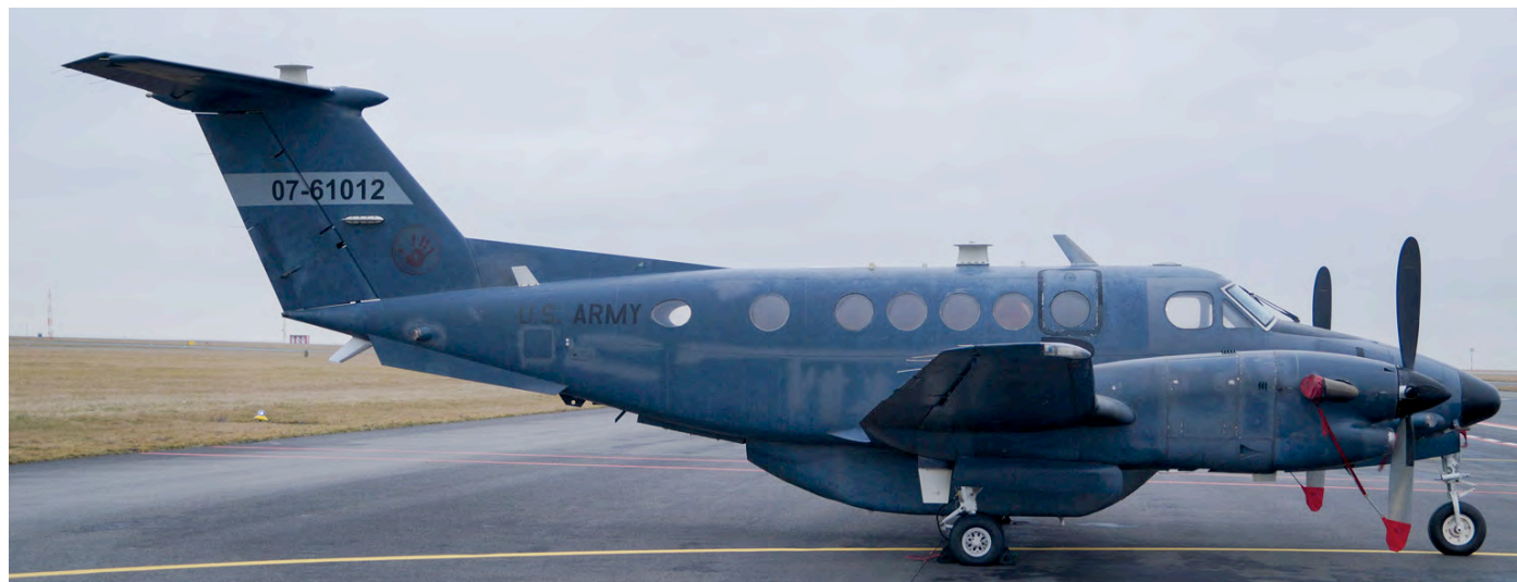
Our trusted contributor Václav Kudela photographed Beech 300LW 07-61012 at Prague. It is said to be operated by Task Force Odin. (8 January 2018)

88-0434/HO 314th FS ex LF/308th FS 1C-36 feb18 88-0517/HO 314th FS ex LF/314th FS 1C-119 feb18 90-0770/HO 314th FS ex LF/314th FS 1C-378 feb18