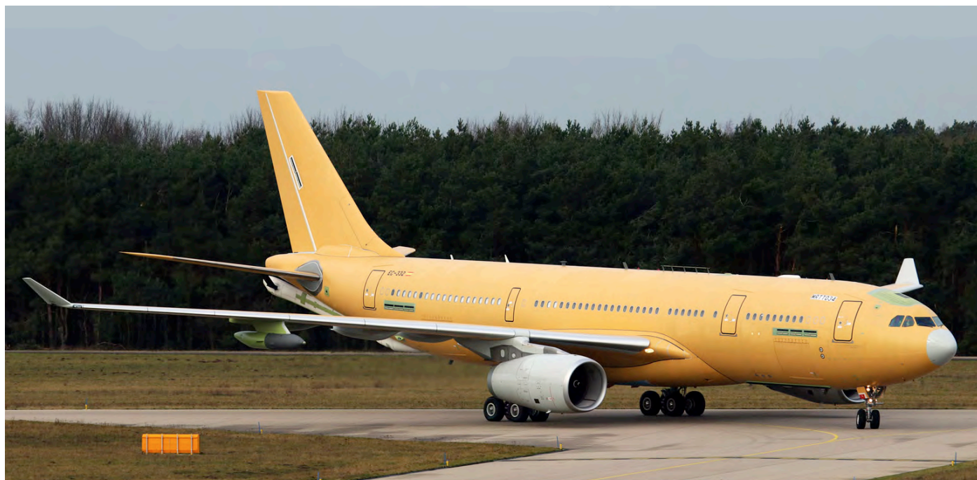
The second Airbus A330MRTT, EC-332 destined for the Singapore Air Force paid a visit to Eindhoven in its pre-painted phase. From 2020 Eindhoven Air Base will be the home of Airbus A330 MRTT. Staff and guests were given the opportunity to see the aircraft from the inside and outside. (Eindhoven, 23 January 2018,)