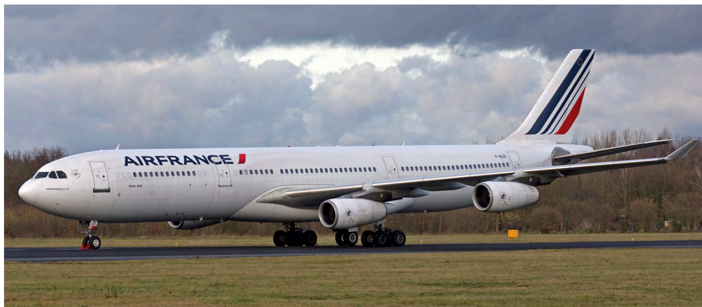
This Airbus A340 was delivered to Air France in July 1995. It operated its last flight for Air France 22 years later. F-GLZI was one of two Air France A340s flown to the Netherlands for dismantling. (Twente, 21 January 2018, Rene Liebe)