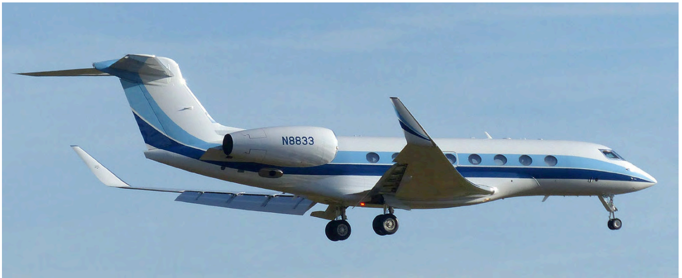
This Gulfstream G650 was assembled in 2012 but delivered as N8833 to its first owner in February 2014. Moore Capital Management was founded in 1989 by American billionaire Louis Moore Bacon and is the current operator. (Zurich, 24 January 2018,)