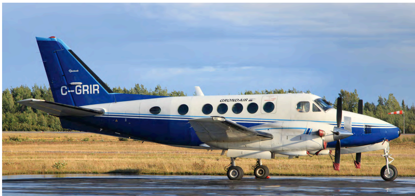
Grondair was founded in 1978 and Beech C-GRIR is one of four in the fleet. The company has a flightschool but also operates charters. This Beech A100 was added to the fleet in 2010. (Baie-Comeau Airport (QC), 16 August 2017,)