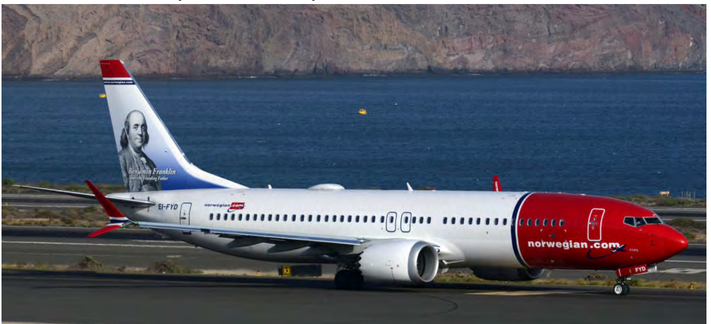
On 20 February 2018 Norwegian received their last Boeing 737-800. From now on they will only receive the Boeing 737-8 from which they have already received six. Another 104 have to follow. Boeing 737-8 EI-FYD was delivered in July 2017. (Las Palmas, 17 January 2018,)