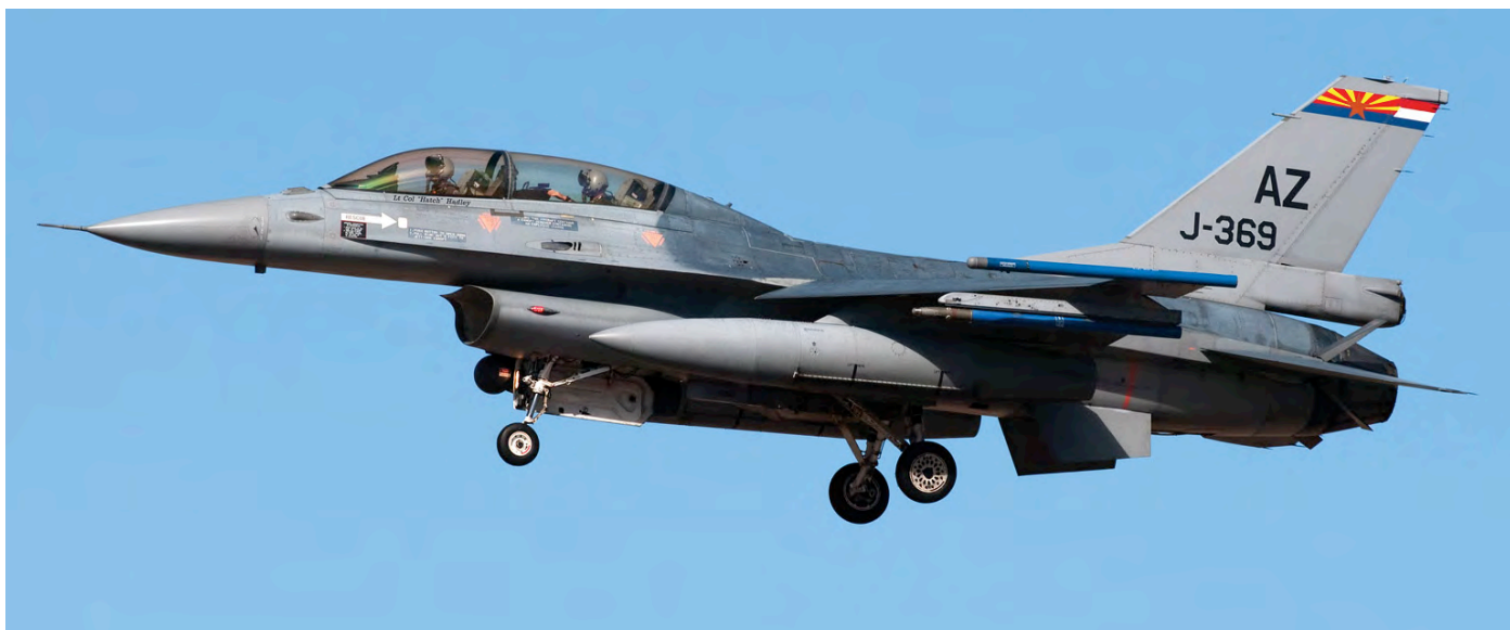
F-16BM J-369/AZ of the Koninklijke Luchtmacht, from 148th FS based at Tucson (AZ), sustained substantial damage when it struck a cable during a low-level flight near Black Canyon City. The canyon is some sixty miles north of Phoenix, in the training area VR-241. The F-16 was badly damaged, but the pilot managed to land the aircraft Phoenix Sky Harbor Airport (AZ). (Tucson (AZ), 14 November 2017, Joost de Wit)

17feb18 N155PR Be95-B55 TC-1328 w/o A private Beech Baron went missing on a flight from Toussus-le-Noble to Annemasse (both in France) and eventually was found in the wooded mountain area near La Grange en Cey, Saint-Laurent-la Roche, Jura. All three French occupants had died in the crash. The pilot, managing director of a company in Toussus-le-Noble, was an instrument flight rules pilot (IFR) allowing to "fly with the help of aircraft instruments and control guidance without external visual information."