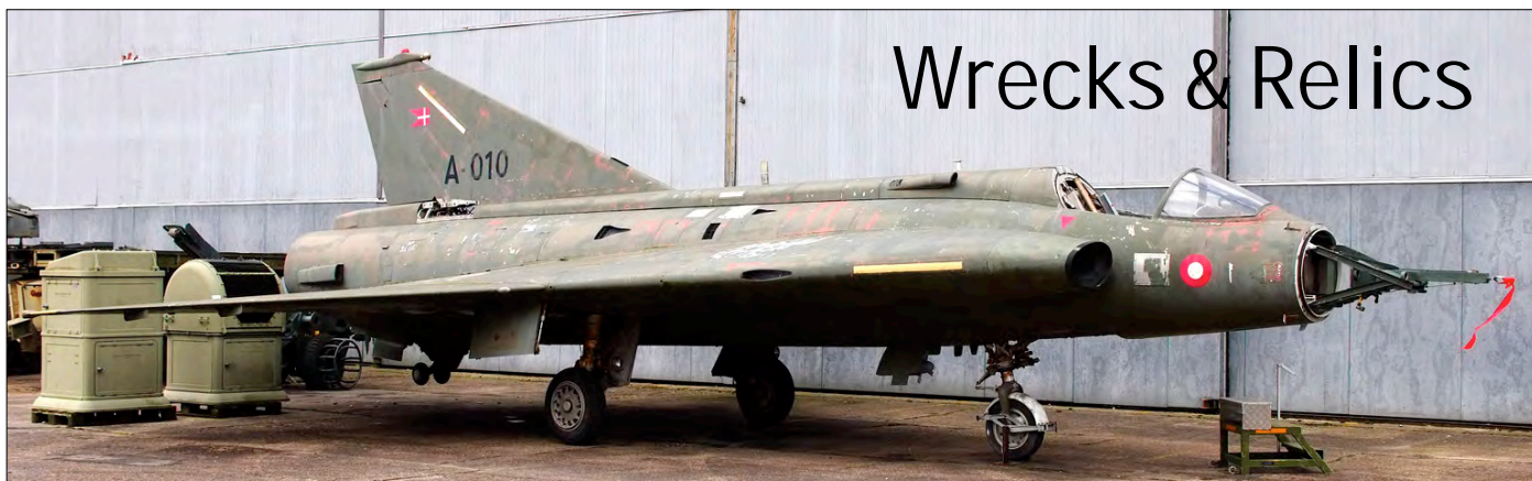
This may be the last photo of Danish F-35 A-010. It was planned to be scrapped four days later. (Aalborg, 22 February 2018, Per Thorup Pedersen)