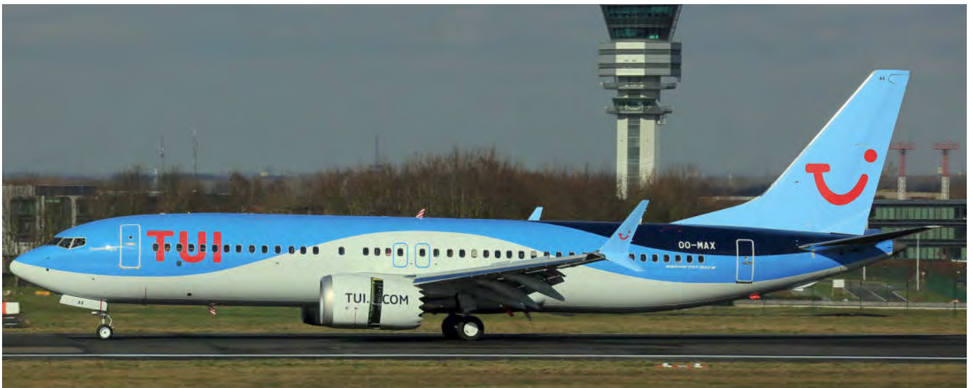
The TUI group at this moment has an order for 50 B737-8 aircraft. The first one delivered for TUI Fly Belgium, as OO-MAX, arrived at Brussels on 30 January. (Brussels, 10 February 2018, Marco Massert)