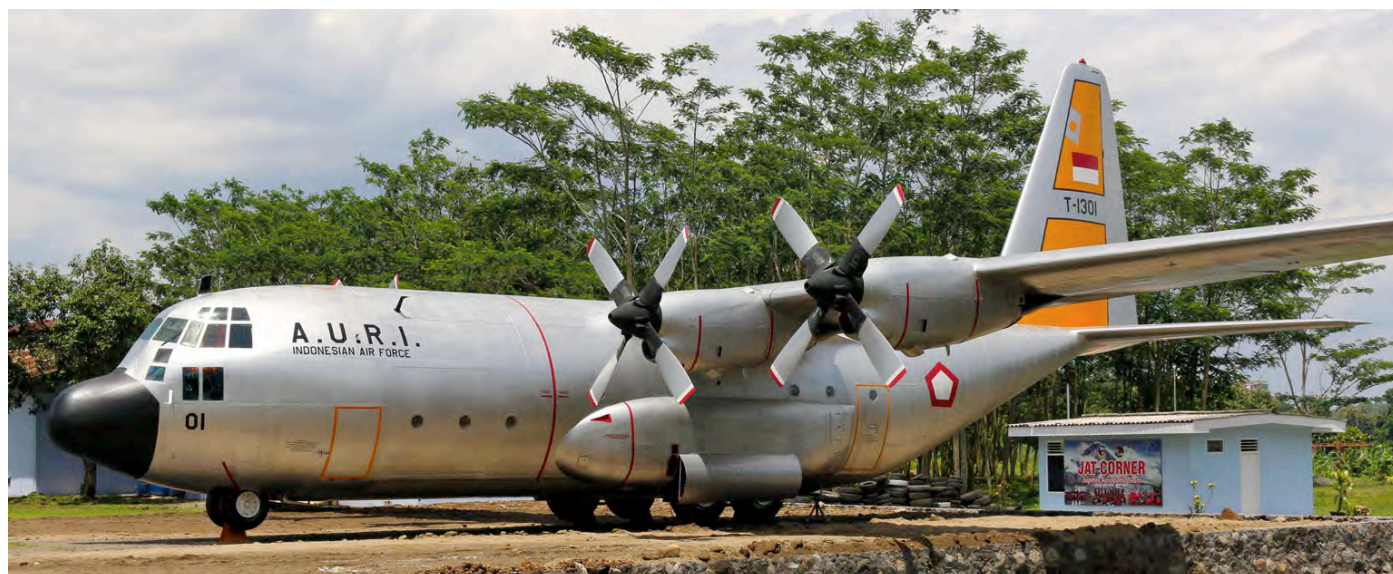
Indonesia's oldest Hercules, C-130B A-1301, had been preserved at Bandung since 2005. It has recently arrived at the Dirgantara Mandala Air Force Museum at Yogyakarta, and was repainted in its old colour scheme and old serial T-1301. (28 January 2018,)

In contrast to the logic presented last month, both Xinjiang and Xizang LH Brigades have received serial ranges not in the range used by Western TC. Also, the new base for the Xizang Brigade that has evolved from a detachment of the former 2nd (now 77th) Brigade just south west of Lhasa is nearing completion.