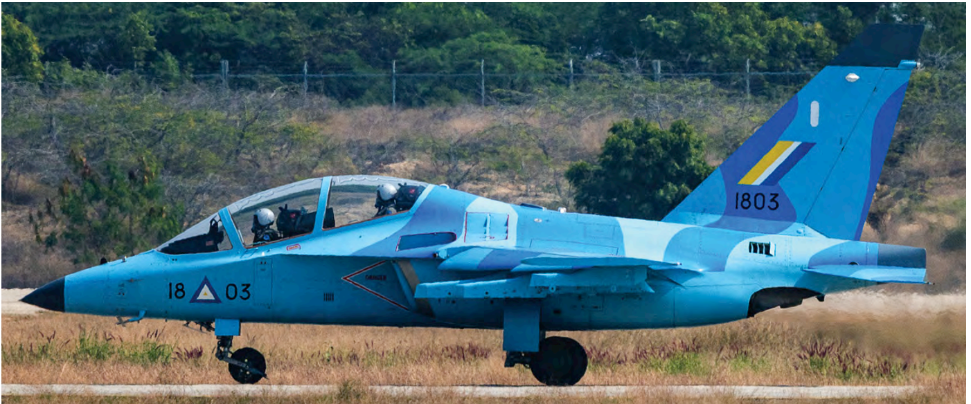
Myanmar seems to get more and more popular with spotters. Here we see Yak-130 1803, one of six operated by 1FTS at Mandalay. (Mandalay, 16 January 2018, Rudolf Stämpfli)

these islands it is difficult to base F-15Js there. Because of its STOVL capabilities, operating the F-35B from these airports should much improve the coverage of the outer edges of Japan's airspace.