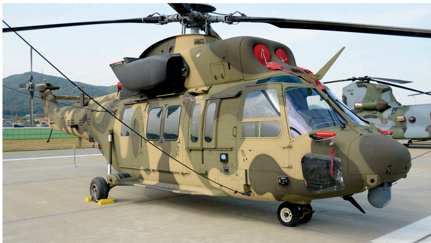
Photographed at the static of the ADEX exhibition at Seongnam Air Base on 16 October 2017, this KAI KUH-1 Surion 16055 is serving the Republic of Korea Army. This type is the replacement for Korea's aging UH-1H helicopters.