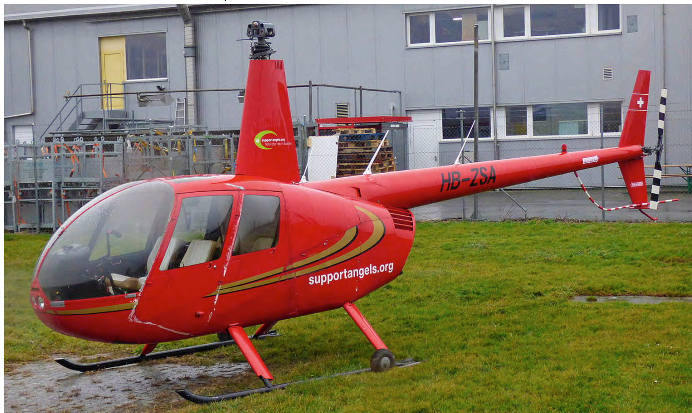
HB-ZSA is without blades since at least 15 October 2017. Although officially owned by Helisupport and operated by Mountain Flyers 80 the latter has confirmed that the Robinson R44 has been withdrawn from use. (Altenrhein, 22 January 2018,)

J-1559 Venom FB50 Swiss Air Force January 2018 std