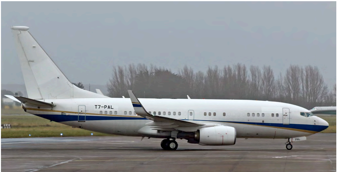
This Boeing 737 BBJ was originally delivered to Chinese company Nanshan as B-5286 in July 2013. Late January 2018, the aircraft found a new owner in Arab Wings Company, which has registered the aircraft in the San Marino register as T7-PAL. The Boeing made a transit stop at Shannon on 18 February en route from Amman to New-York Kennedy (NY) and still sports the colours in which it flew for Nanshan, but now without the Nanshan logos. (Shannon, 18 February 2018,)