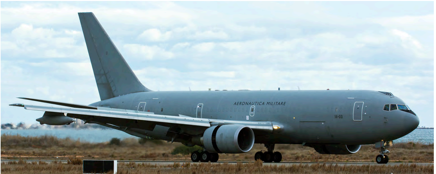
Seen here at Murcia-San Javier, probably acting as support for the Italian TLP delegation, is KC-767A MM62228. The Italian KC-767s have become a familiar sight around Europe since their delivery. (26 January 2018,)