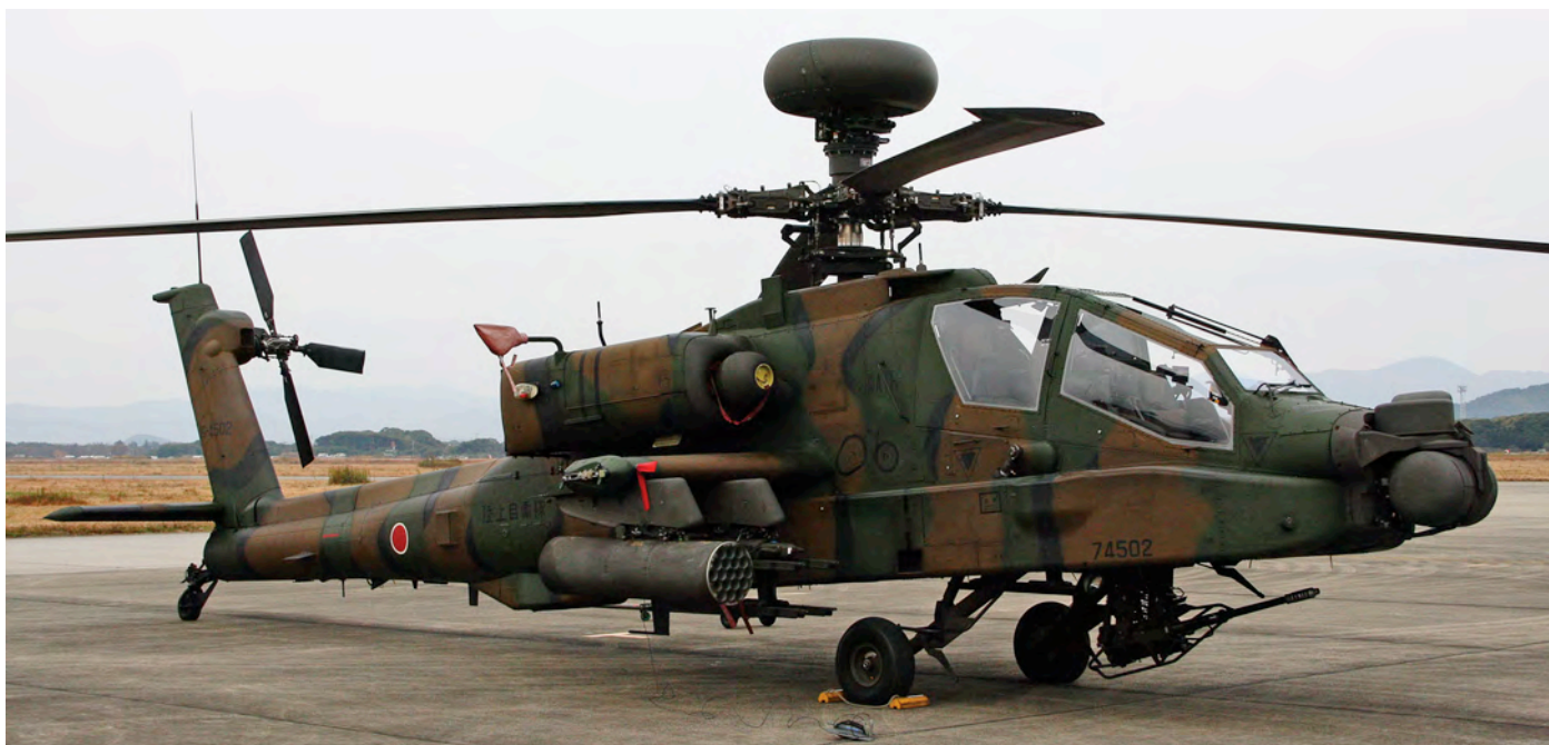
The Japan Ground Self-Defense Force's 3 Taisensha Herikoputatai lost Apache Longbow 74502 when it crashed in a house near a school, located four kilometres south of Metabaru Airbase, in Chiyoda, Kanzaki city, Saga prefecture, on 5 February this year. It is seen here at the Tsuiki Open Day on 26 November 2017 by Mike Bursell.

The pilot who was flying the Kenya Air Force Tiger II that crashed near Ilgvesi Conservancy on the Laikipia-Isiolo border was lucky to walk away unscratched, having used his ejection seat to good effect. The F-5 was destroyed by the post-impact fire. Kenya is often performing combat missions in the Garissa and Wajir provinces, the borderline with war-torn Somalia.