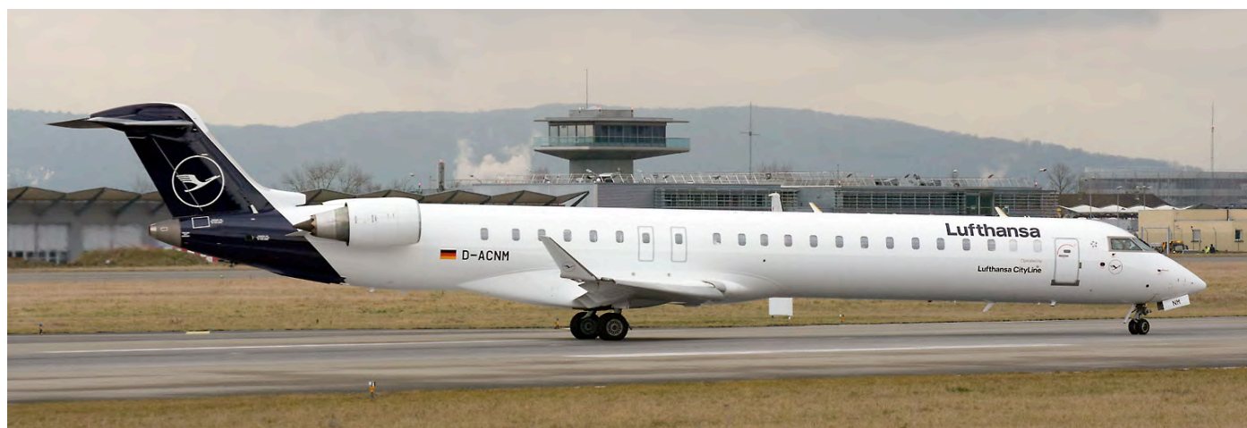
Not only the Lufthansa main linefleet will be repainted in the new corporate colours, also the fleet of Lufthansa Cityline will receive the new colours. The first CRJ900 to be painted is D-ACNM. With the repaint not only the yellow dots in the tail are gone, but also the additional title "Regional" has disappeared. (Basel-Mulhouse, 16 February 2018, Eric Barnwarth)