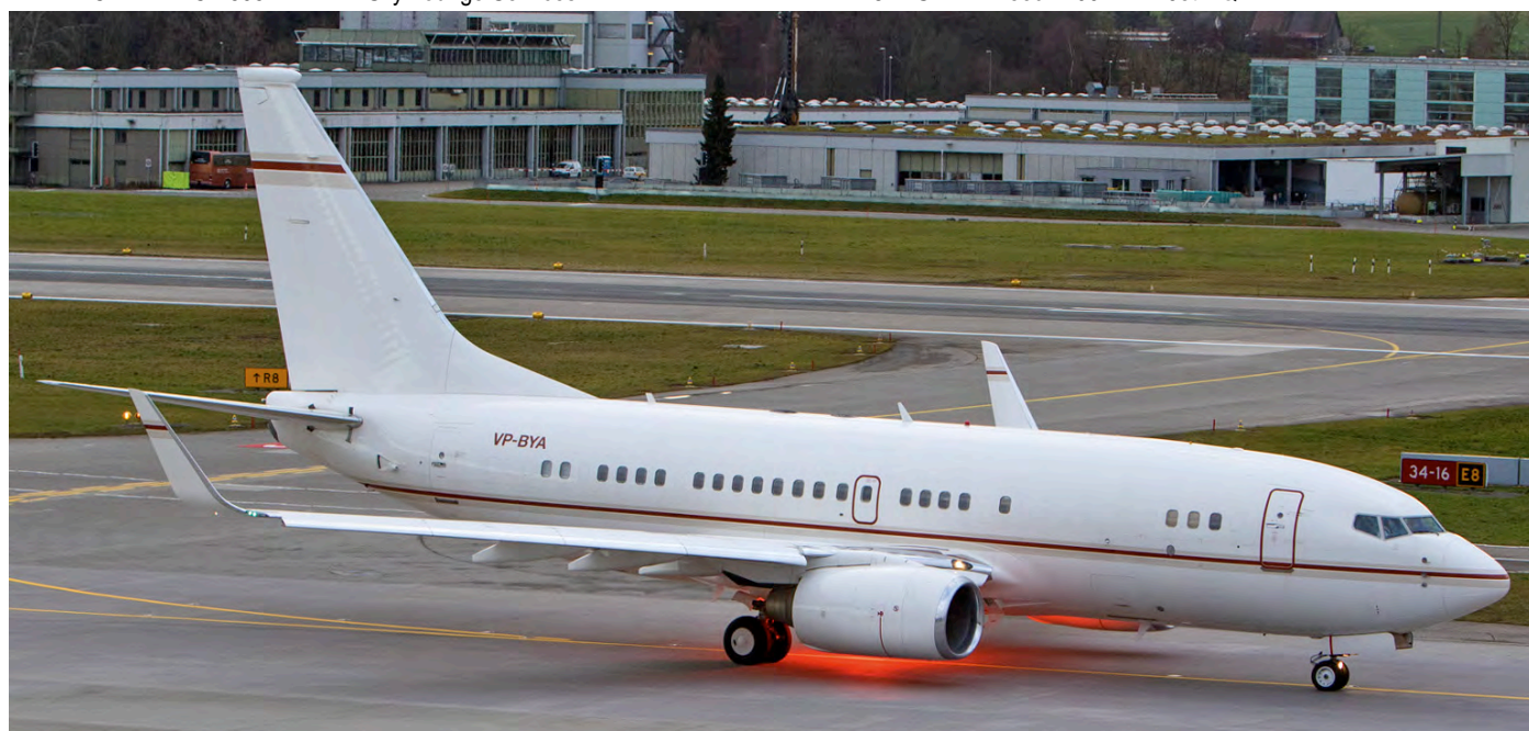
BBJ1 VP-BYA was delivered to the Saudi Oger Aviation Department in August 2000. Although its Saudi construction company closed down on 31 July 2017 its fleet of aircraft keep on flying. (Zurich, 23 January 2018,)