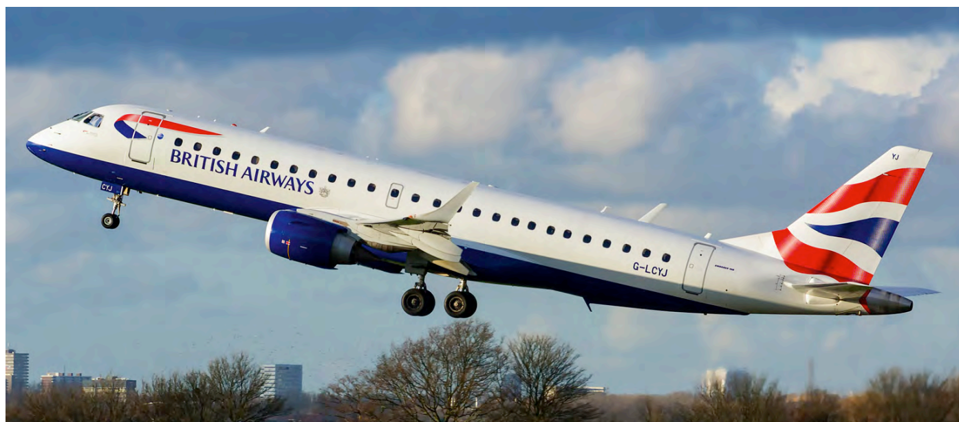
British Airways signed a contract for five Embraer 190SR in December 2008. G-LCYJ was the first Embraer 190 that was delivered in March 2010. BA CityFlyer, British Airways' regional subsidiary, operates the jet.