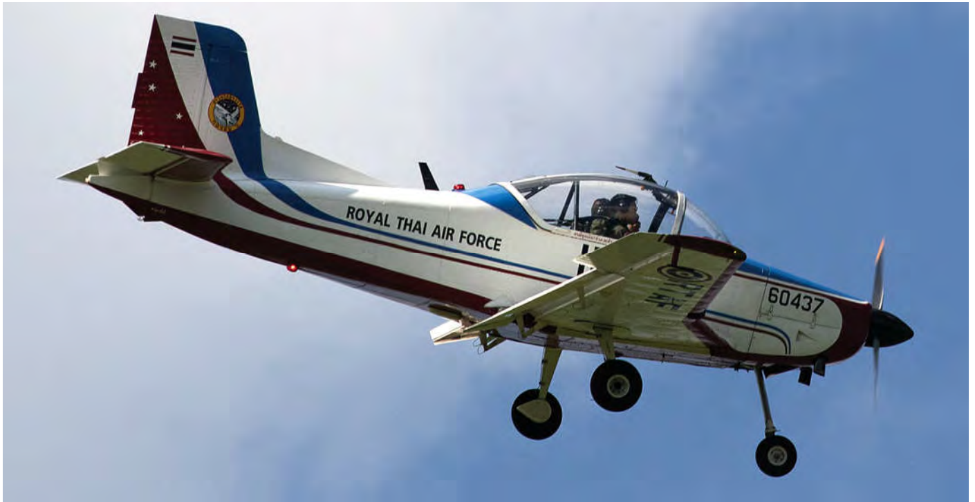
Each year on the second Saturday of January Thai armed forces organise open houses during nationwide Children's Day. Usually also Don Muang has the biggest open house, that usually also includes demonstration by the flight school aircraft. This CT/4A with serial F16-11/17 is used by 604sq, hence its code 60437 (Don Muang, 8 January 2018)