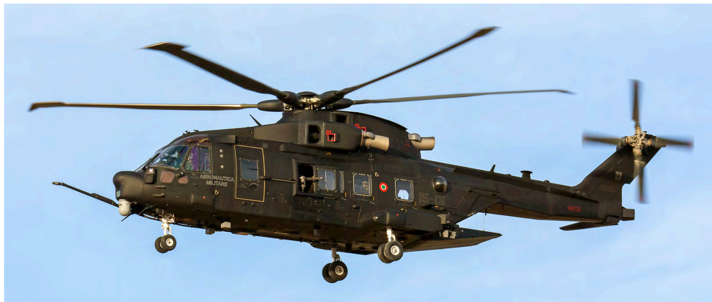
HH-101A MM81864 of the Aeronautica Militare belongs to 15° Stormo at Cervia, more specifically the 81° Centro Addestramento Equipaggi. The unit specialises in SAR and CSAR and was present at the TLP for this purpose. (Albacete, 13 February 2018,)

According to the information provided, the costs of a flight hour for the Hkp14 is five times as high as for the Hkp16 Black Hawk helicopter. In this case around €20,000 versus €4,000 per flying hour. The Hkp14 is already troubled with a long history of delays and performance issues. In 2011, it was decided to order fifteen Black Hawk helicopters because of a high demand in transport helicopters. Looking at the various articles in the Swedish media, the eighteen Hkp14 helicopters are split between nine Hkp14E helicopters intended for ground operations and nine Hkp14F helicopters intended for ASW operations. The expectation is that also the ASW version is too expensive, but at this moment all fingers are pointed at the Hkp14E variant.