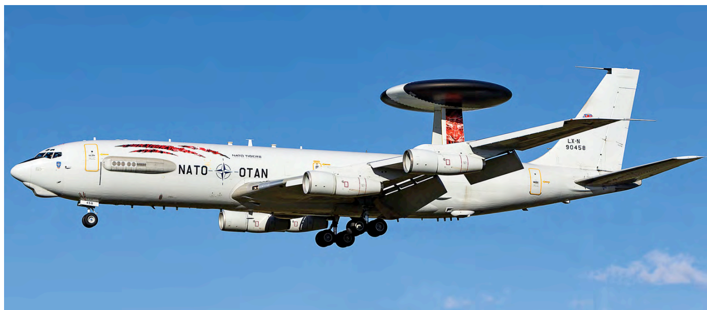
Wearing a small homage to the NATO Tiger Association is E-3A LX-N90458. (Geilenkirchen, 13 February 2018,)