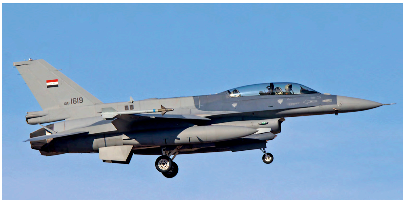
The Iraqi Air Force is using Tucson International Airport (AZ) as a base to train its F-16 crew. Around seven Iraqi F-16 C/D are assigned to the 152nd FS AZ ANG. One of the duals, 1619 was photographed here by Ramon Berk on 11 October 2017.