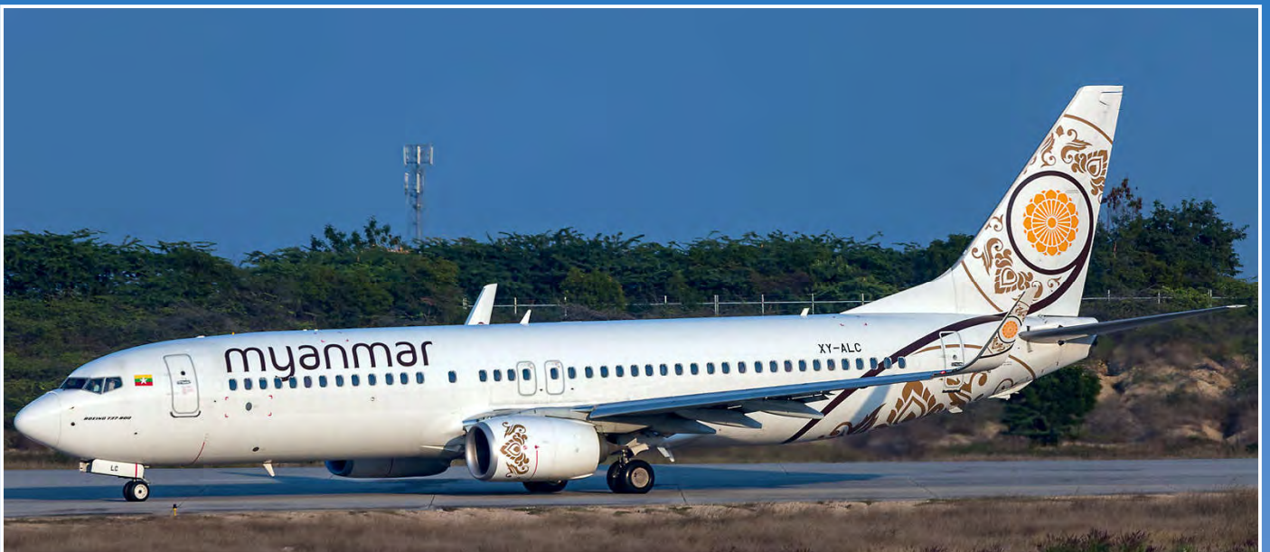
Myanmar National Airways has four Boeing 737-800s. XY-ALC is one them and delivered freshly from the factory on 10 October 2015. (Mandalay, 16 January 2018, Rudolf Stämpfli)