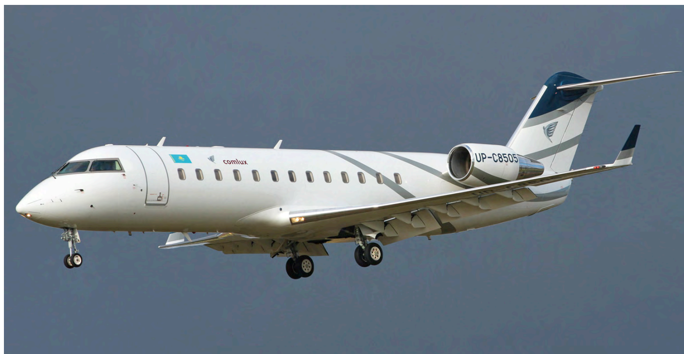
Comlux Kazakhstan is a fully owned subsidiary of the Comlux Group. CL-850 UP-C8505 was initially delivered to Comlux KZ in September 2009 as P4-AST and has changed registration a few times since. (Amsterdam - Schiphol, 19 January 2018,)