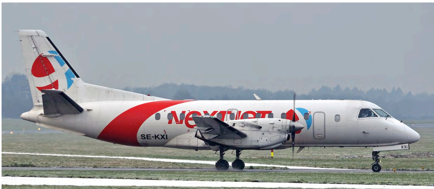
Operational in Sweden since September 2006, SE-KXI was initially delivered to Crossair in 1990 as HB-AKE. Since August 2010 the commuter is being operated by NextJet. (Eelde, 20 January 2018, Jaap Niemeijer)