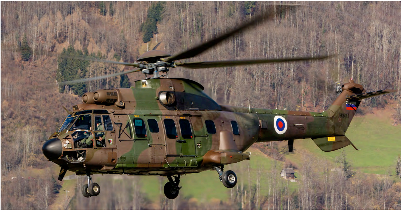
Slovenia operates four AS532AL Cougar helicopters, all delivered in 2003. H3-71 is seen here at Alpnach where the helicopter is for overhaul. (24 January 2018)