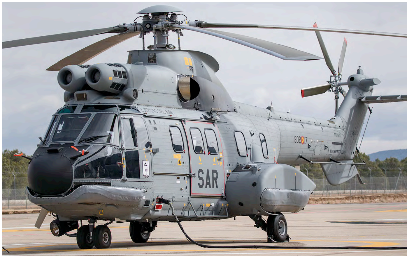
AS332C1e HD.21-17 was delivered only a couple of days before this photo was taken, hence the extreme clean look. (Albacete, 14 February 2018,)

A photo found on facebook shows the above three Soko G-2s on the flightline of Misurata, all three are a first noted for the