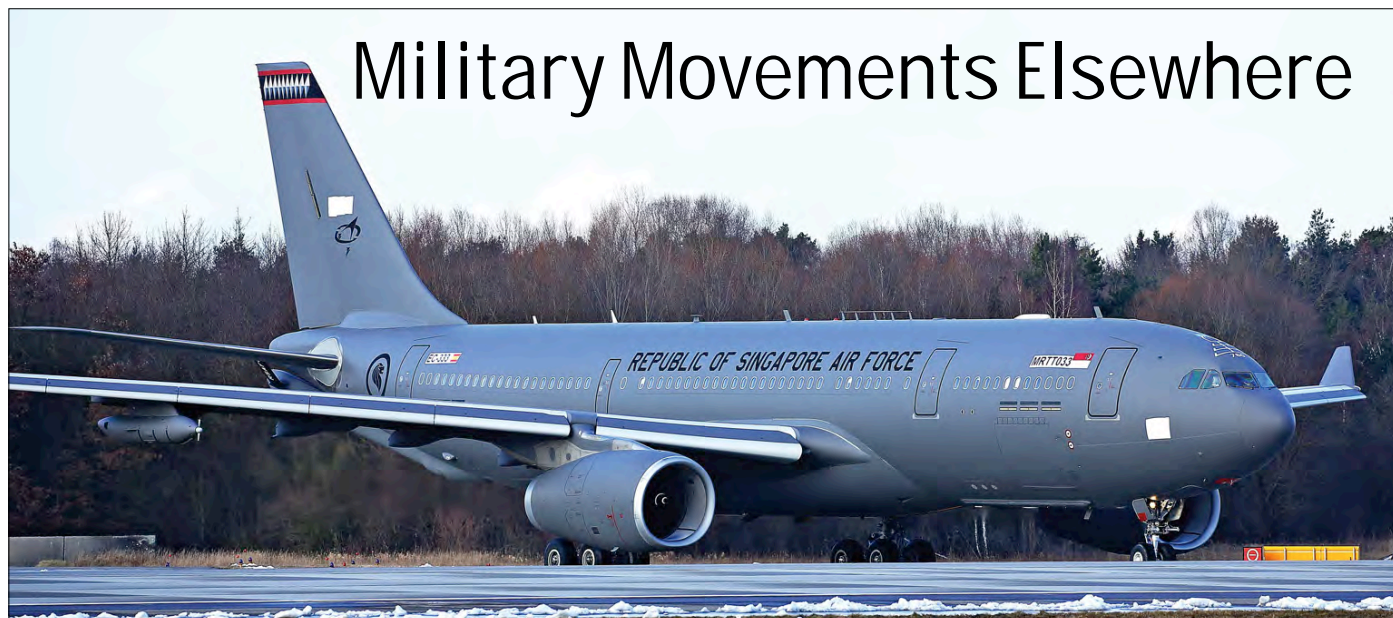
Noted at Manching was the first A330 MRTT for the Republic of Singapore Air Force. It was still carrying test registration EC-333. (16 February 2018,)