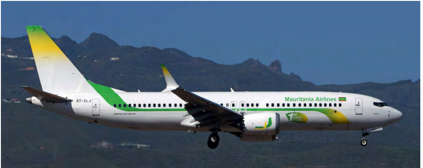
At the time of making this issue there were approximately 85 B737-8 (MAX) delivered to about 22 operators. Southwest is leader with 18 aircraft in the fleet. Mauritania Airlines has only this 5T-CLJ in their fleet. It was delivered on 20 December 2017. (Las Palmas, 23 January 2018,)