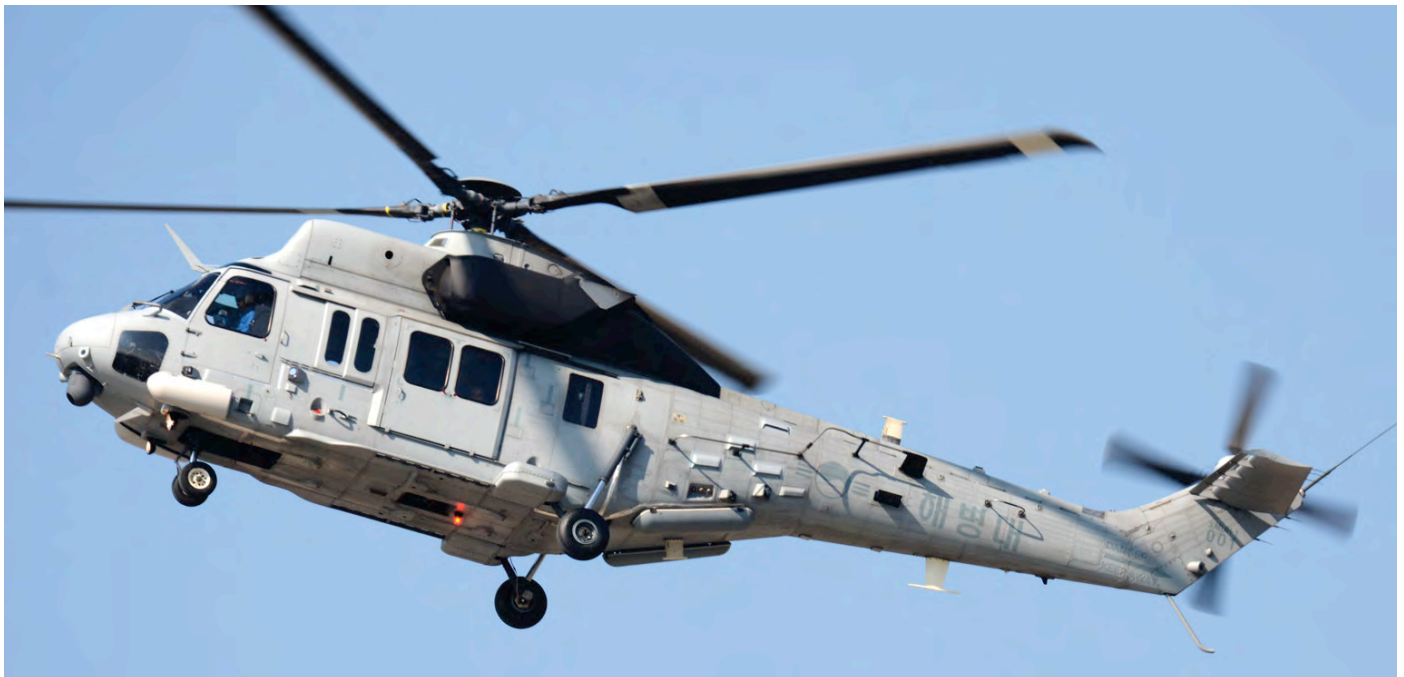
The MUH-1 of the Republic of Korea Marine Corps made its first public appearance at Seoul ADEX 2017. The MUH-1 will be the first helicopter operated by the RoKMC. Note that according to the inscription on the tail this actually concerns an XMUH-1. (Seongnam, 17 October 2017)

ADC), 26-5680 (l/n nov16, 301Hik), 26-5687 (l/n mar16, ADC), 36-5705 (l/n may16, SW-ADF), 46-5714 (l/n nov16, ADC), 46-5726 (l/n dec16, BlueImp), 56-5734 (l/n may16, 32FTS), 76-5759 (l/n nov16, 302Hik), 96-5781 (l/n dec16, 31FTS), 06-5782 (l/n nov16, 32FTS), 06-5791 (l/n sep16, N-ADF), 16-5792 (l/n mar16, 306Hik) and 26-5806 (l/n oct16, 31FTS)